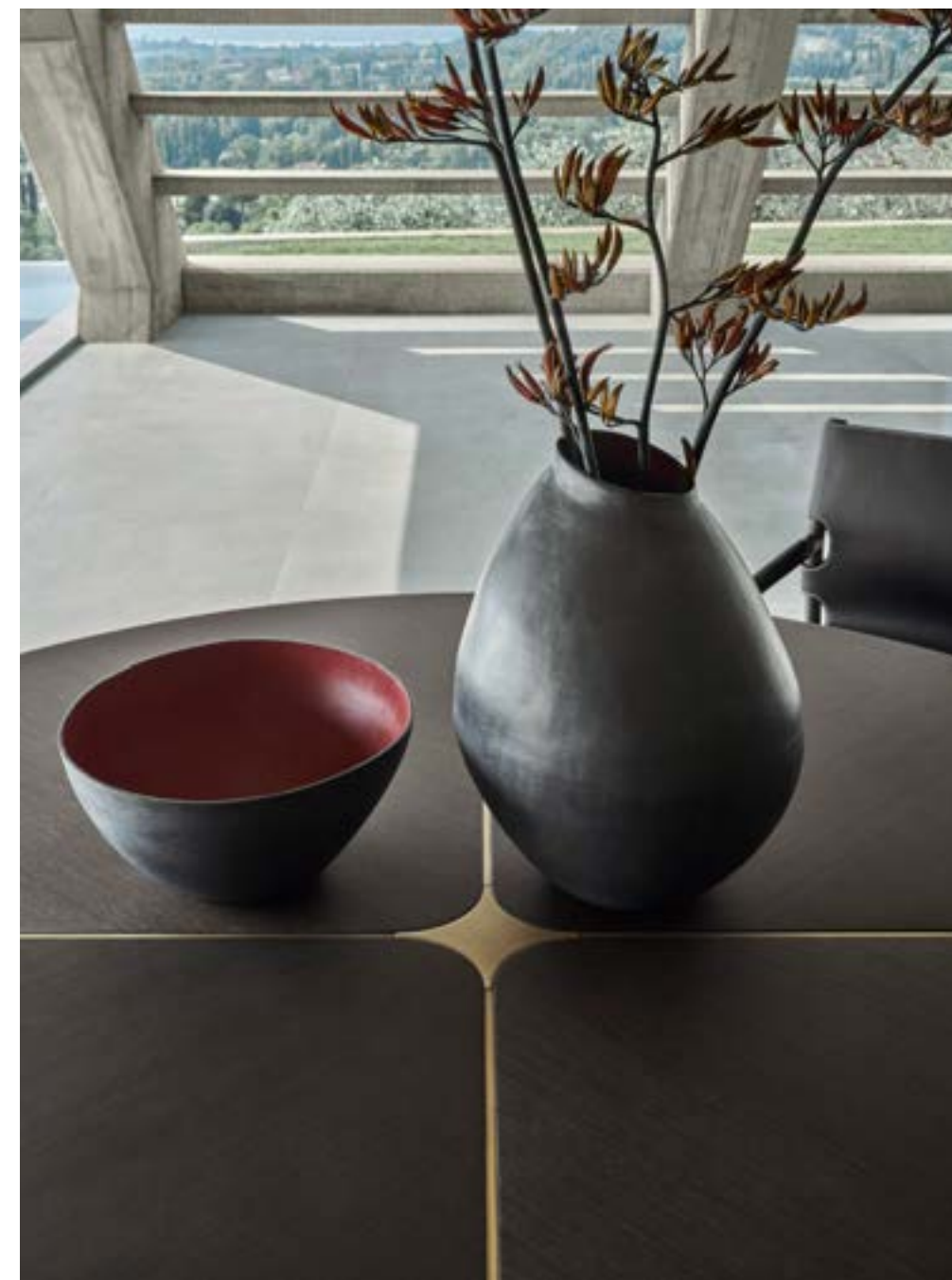
DAVOS dining table MONTREUX chair