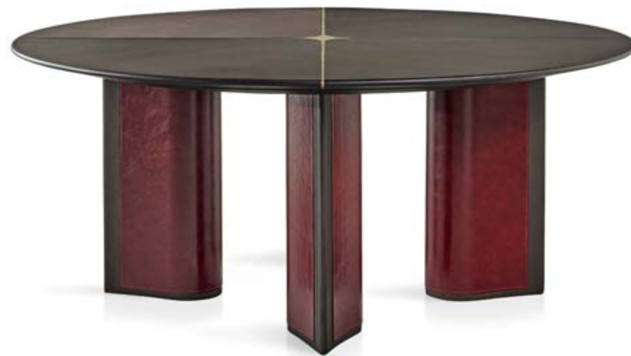
DAVOS dining table

The DAVOS table perfectly embodies the dialogue between rigor and softness, a hallmark of Gianfranco Ferré Home distinctive style. Its sculptural forms are enhanced by the interplay of materials with a strong tactile presence, with leather details providing a refined contrast in both texture and tone. Exposed stitching, inspired by haute couture, highlights the sartorial excellence of the design, giving the piece a unique character, a flawless fusion of elegance and contemporary spirit.