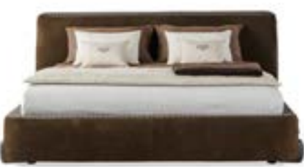
F.KA2.312.ABC L 229 D 248 H 103 cm L 90 D 97 1/3 H 40 1/2 in

Bed with structure in multilayer fir wood with padding in variable thickness high-density expansive polyurethane foam and resin. Main upholstery of headboard and bedframe in leather cat. B Nabuk L.08.06 col. Brown. Upholstery for buttons and for the top parts of headboard and bedframe in fabric cat. A Duchesse 25.04 col. Choconavy. Button detailing aligned with the position of the feet. Feet in solid Ash wood Dyed Smokey Grey. Mattress not included.