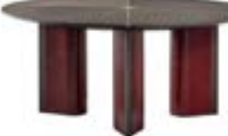
F.DAV.121.A0X + F.DAV.805.C1X Ø 180 H 75 cm Ø 71 H 29 1/2 in

Console with structure in metal with matt Black finishing. Top in marble cat. B Rosso Levante - Matt.