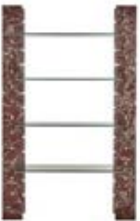
F.FIT.241.AQG L 130 D 38 H 213 cm L 51 D 15 H 83 3/4in

Bar cabinet with structure and front doors in Tay Veneered Dyed Smokey Grey. Element of left door in marble cat. B Rosso Levanto - Matt. Handles in Black metal and Dark Brown Saddle Leather. Internal structure in Tay Veneered Dyed Smokey Grey and anthracite microfibre. Inner back in Natural mirror. Shelves in glass. Led lighting included on the sides. Base in metal with Brushed Bronze finishing.