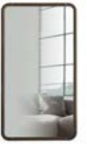
F.INA.524.AAX L 110 D 5 H 200 cm L 43 1/3 D 2 H 78 2/3 in

Standing mirror with metal tubular frame covered in leather cat. A Wild L.02.13 col. Dark Chocolate with decorative stitching in contrasting color. Natural mirror with vertical gradient shading on the left side. Back panel in MDF covered in microfibre col. anthracite.