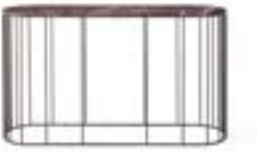
F.DOP.541.AQX L 150 D 40 H 85 cm L 59 D 15 3/4 H 33 1/2 in

Console with top in high-density fibreboard and poplar multilayer wood with Tay Veneered Dyed Smokey Grey finishing. Legs in high-density fibreboard with Tay Veneered Dyed Smokey Grey finishing, partly covered in Shiny Saddle Leather col. Bordeaux, with decorative tone-on-tone stitching.