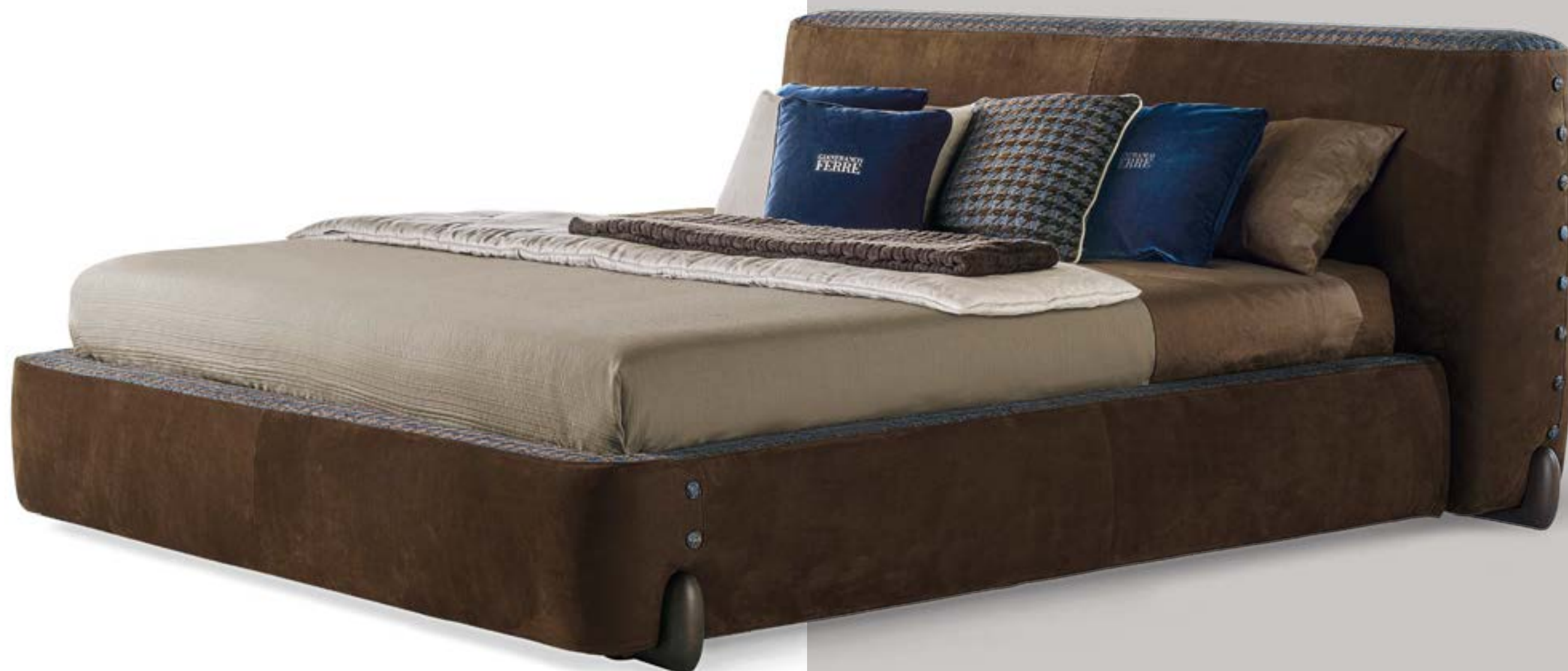
KAUNAS BOUND bed

Defined by clean lines and a balanced, essential design, the KAUNAS BOUND bed expresses contemporary elegance with subtle sartorial accents. Slightly raised on wooden feet and available in a wide range of finishes, it features upholstery in leathers and fabrics inspired by classic tailoring, enhancing its distinctive character.