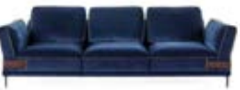
F.BBE.211.ACX + F.BBE.219.BCX (3x) L 265 D 106 H 82 cm L 104 1/3 D 41 3/4 H 32 3/4 in

3-seater sofa with structure in solid poplar wood, multilayer poplar wood and multilayer pine wood. Padding in high-density variable thickness expansive polyurethane foam. Under-seat frame with elastic webbing. Upholstery in velvet cat. A Tender 27.09 col. Navy. Structural back cushions in goose down with polyurethane foam insert, upholstered in velvet cat. A Tender 27.09 col. Navy. Decorative belts with tone-on-tone stitching and piping in leather cat. B Blush L.17.01 col. 02 Brown. Metal eyelets and feet with matt Black finishing.