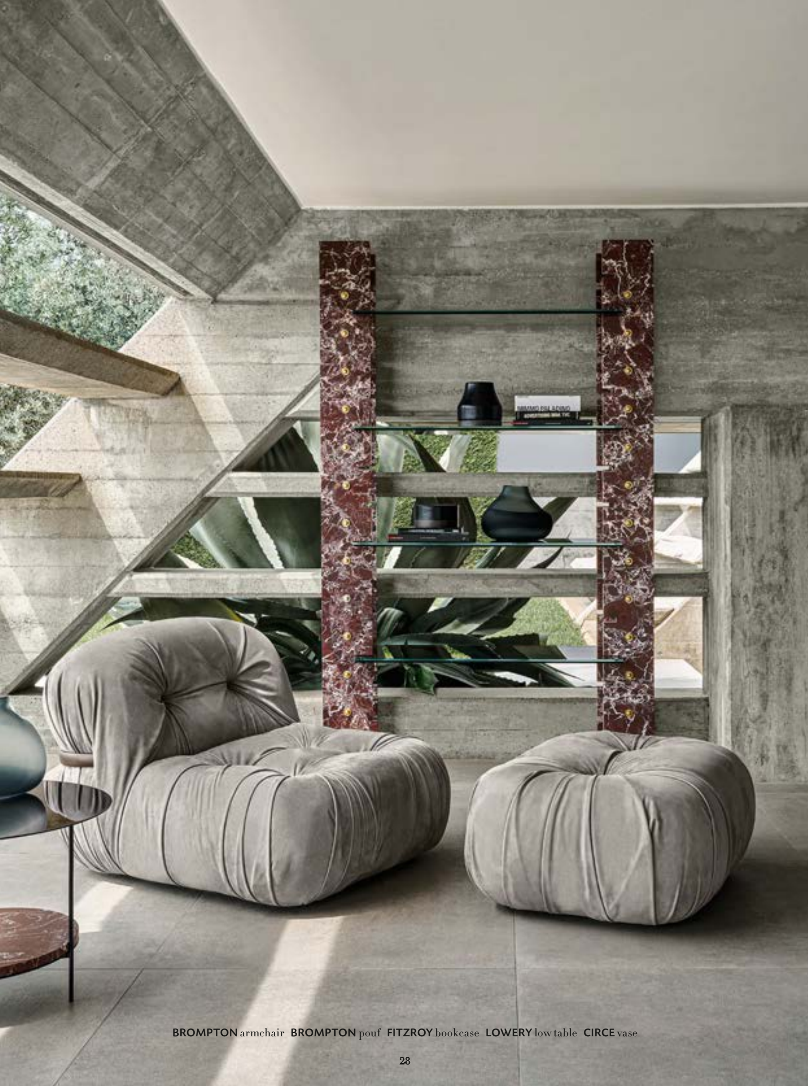
BROMPTON armchair BROMPTON pouf FITZROY bookcase LOWERY low table CIRCE vase