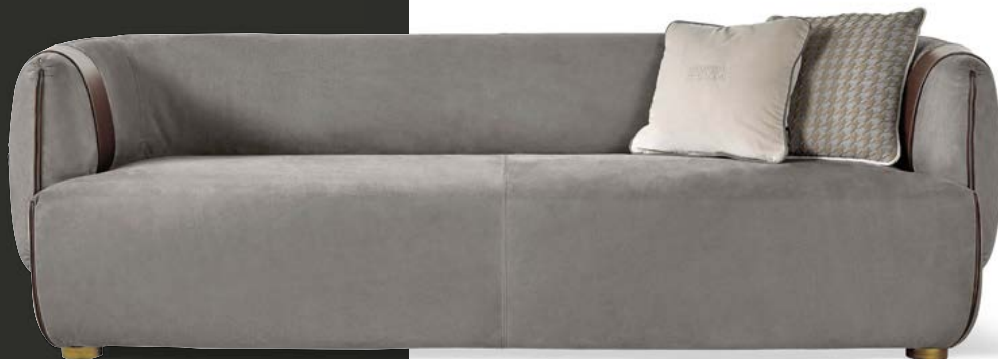
ZURICH 3-seater sofa ZURICH armchair