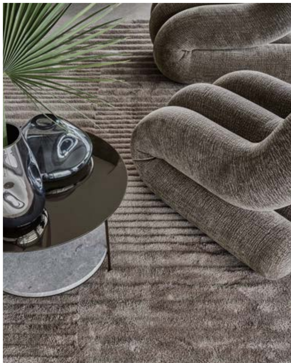
BRYGGE armchairs LOWERY low tables