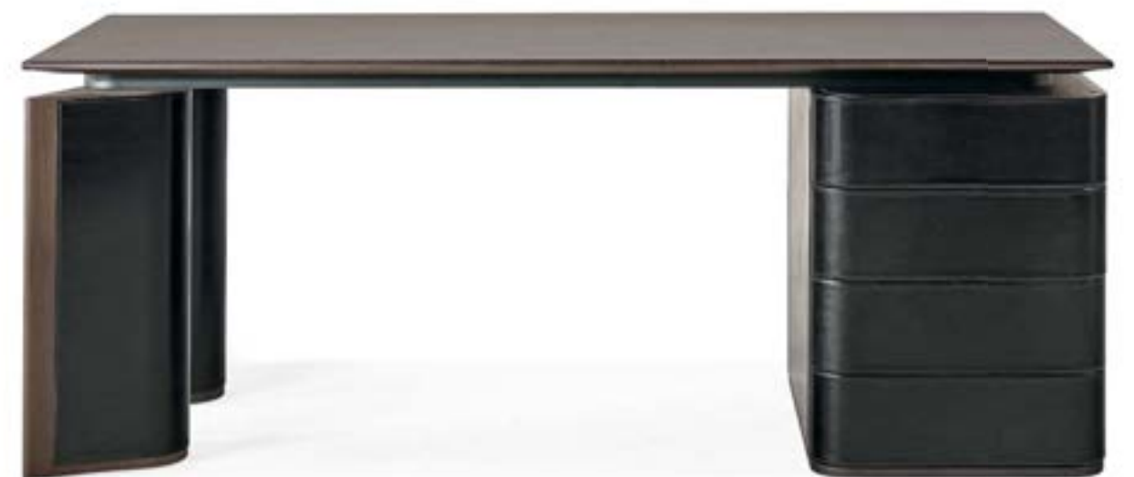
DAVOS desk HARLEM chair BADEN card case / desk blotter

An expression of balance and intention, the DAVOS desk captures the spirit of Gianfranco Ferré Home through clarity of form and refined detail. The silhouette unfolds with quiet strength, its lines defined without rigidity. Wood and saddle leather engage in a tactile interplay, where contrast becomes character. Tone-on-tone stitching traces the contours of the legs, evoking the precision of couture. More than a functional piece, DAVOS lends presence to the workspace—a composed statement shaped by vision and control.