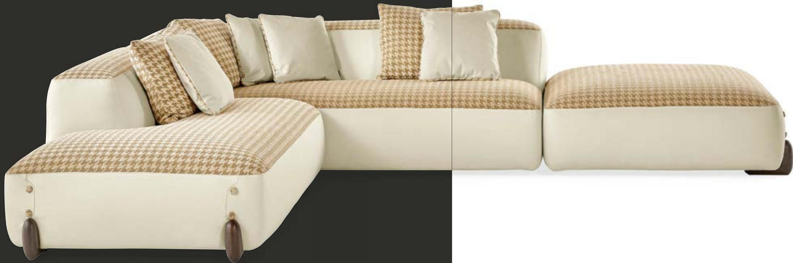
KAUNAS BOUND sectional sofa