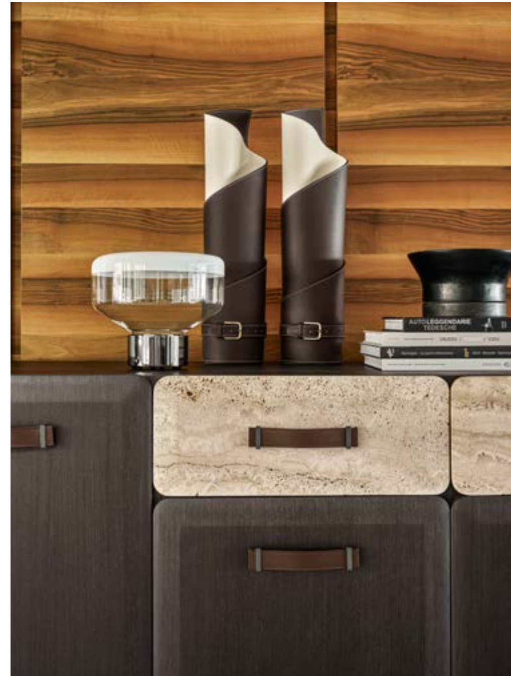
BERN armchair FIVE POINTS sideboard SPOT table lamp COIRA vases