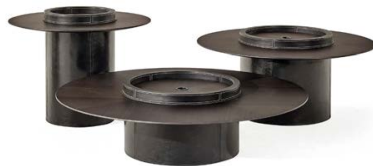
KAUNAS BOUND sectional sofa QUEENS low table HAVNEN CASE low tables