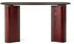
F.DAV.541.A0X + F.DAV.805.B1X L 160 D 40 H 90 cm L 63 D 15 3/4 H 35 1/2 in

Console with top in high-density fibreboard and poplar multilayer wood with Tay Veneered Dyed Smokey Grey finishing. Legs in high-density fibreboard with Tay Veneered Dyed Smokey Grey finishing, partly covered in Shiny Saddle Leather col. Bordeaux, with decorative tone-on-tone stitching.