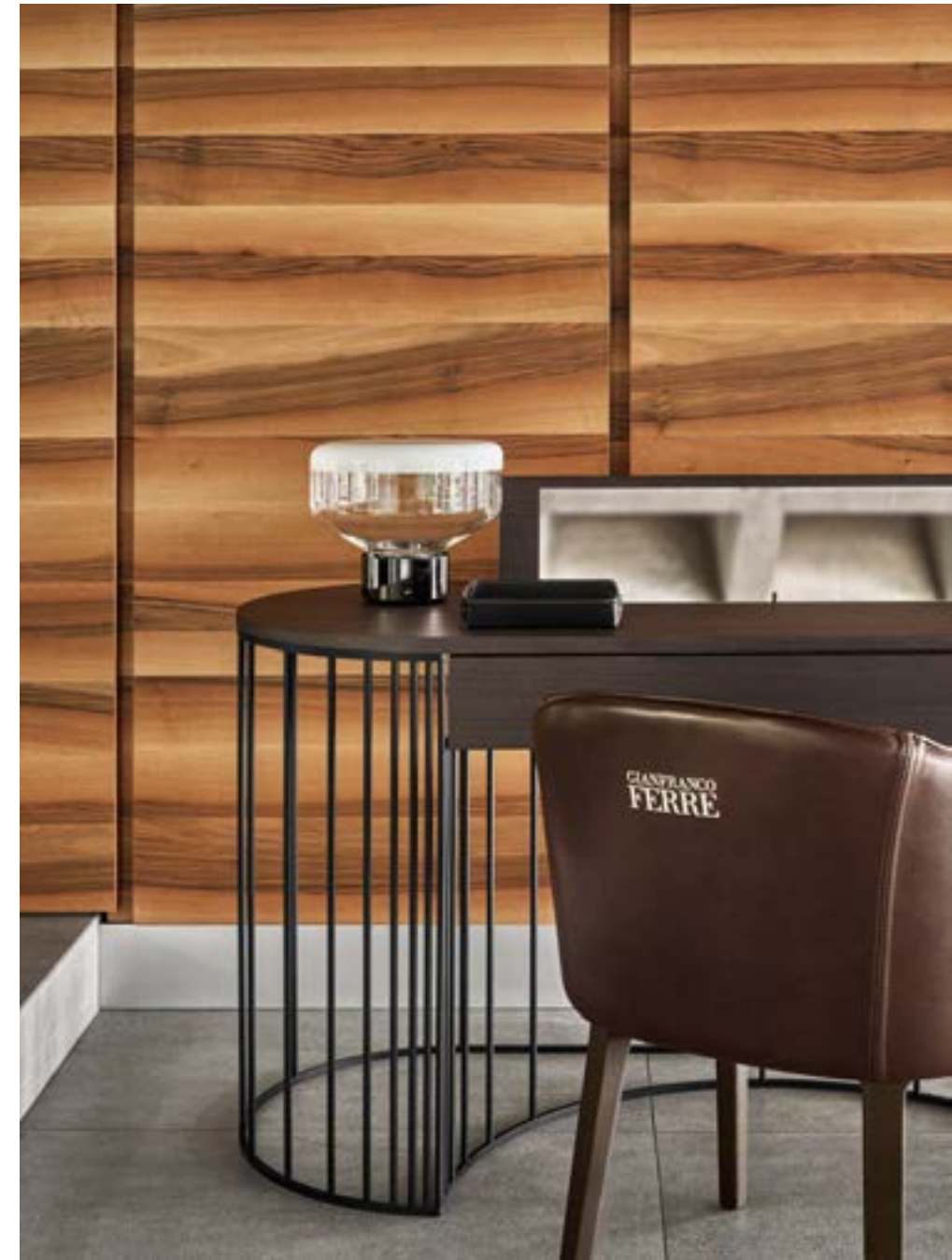
DOPPLER dressing table RIO chair INARI mirror SPOT table lamp BADEN change tray