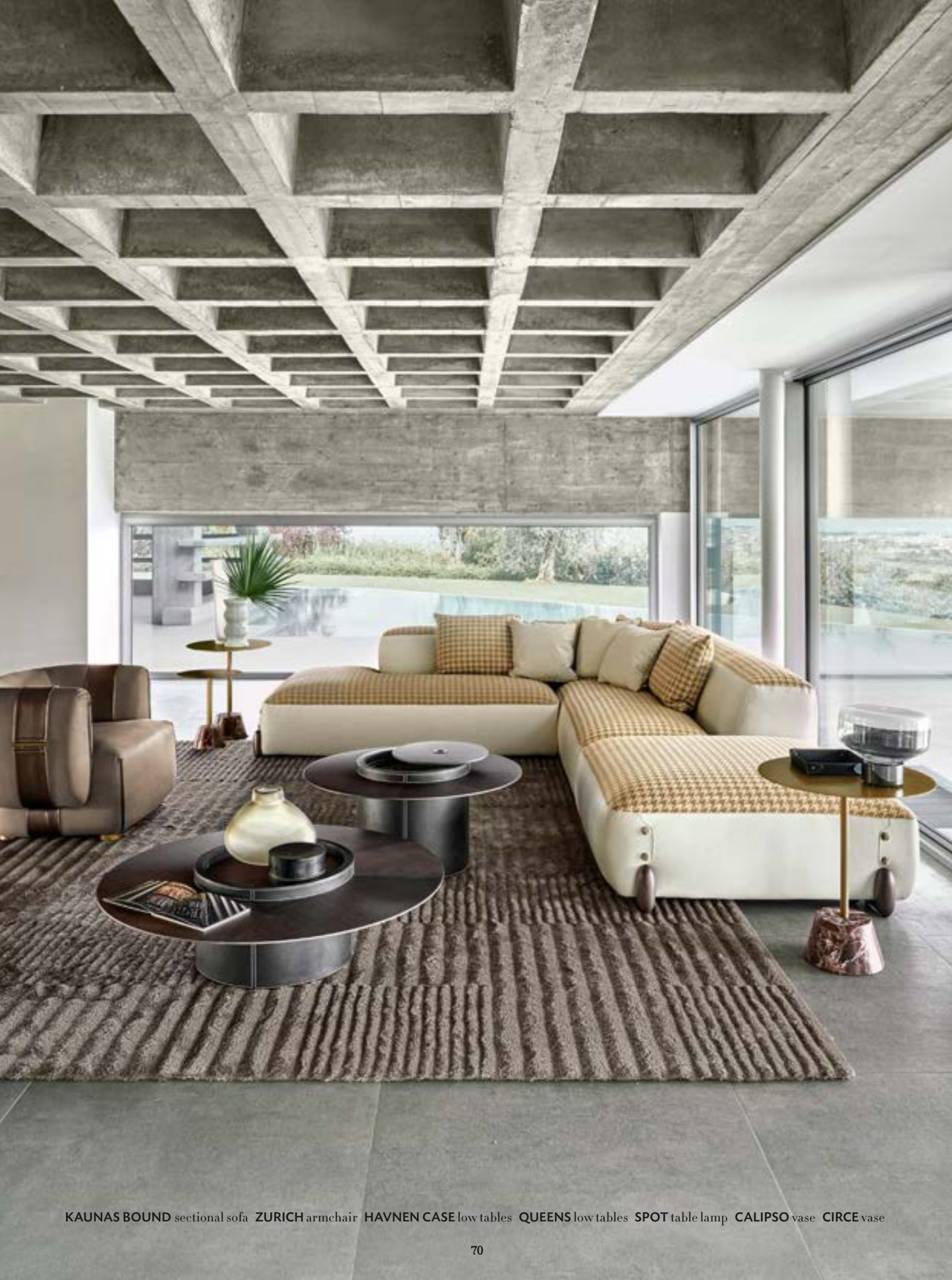
KAUNAS BOUND sectional sofa ZURICH armchair HAVNEN CASE low tables QUEENS low tables SPOT table lamp CALIPSO vase CIRCE vase