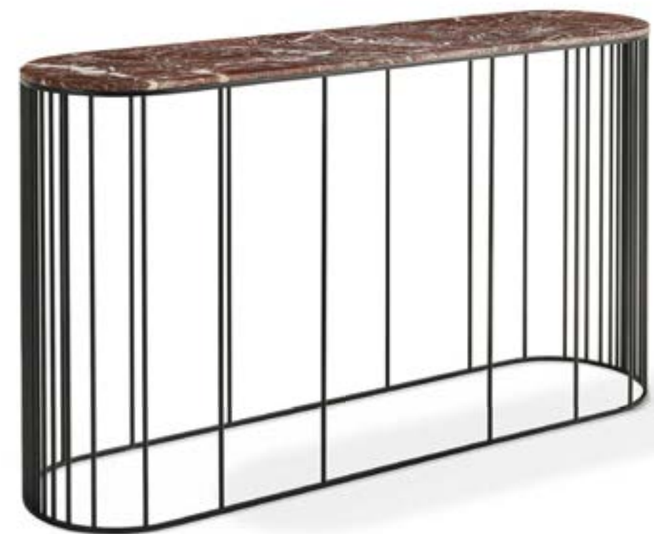
DOPPLER console BROOKLYN low table CIRCE vase