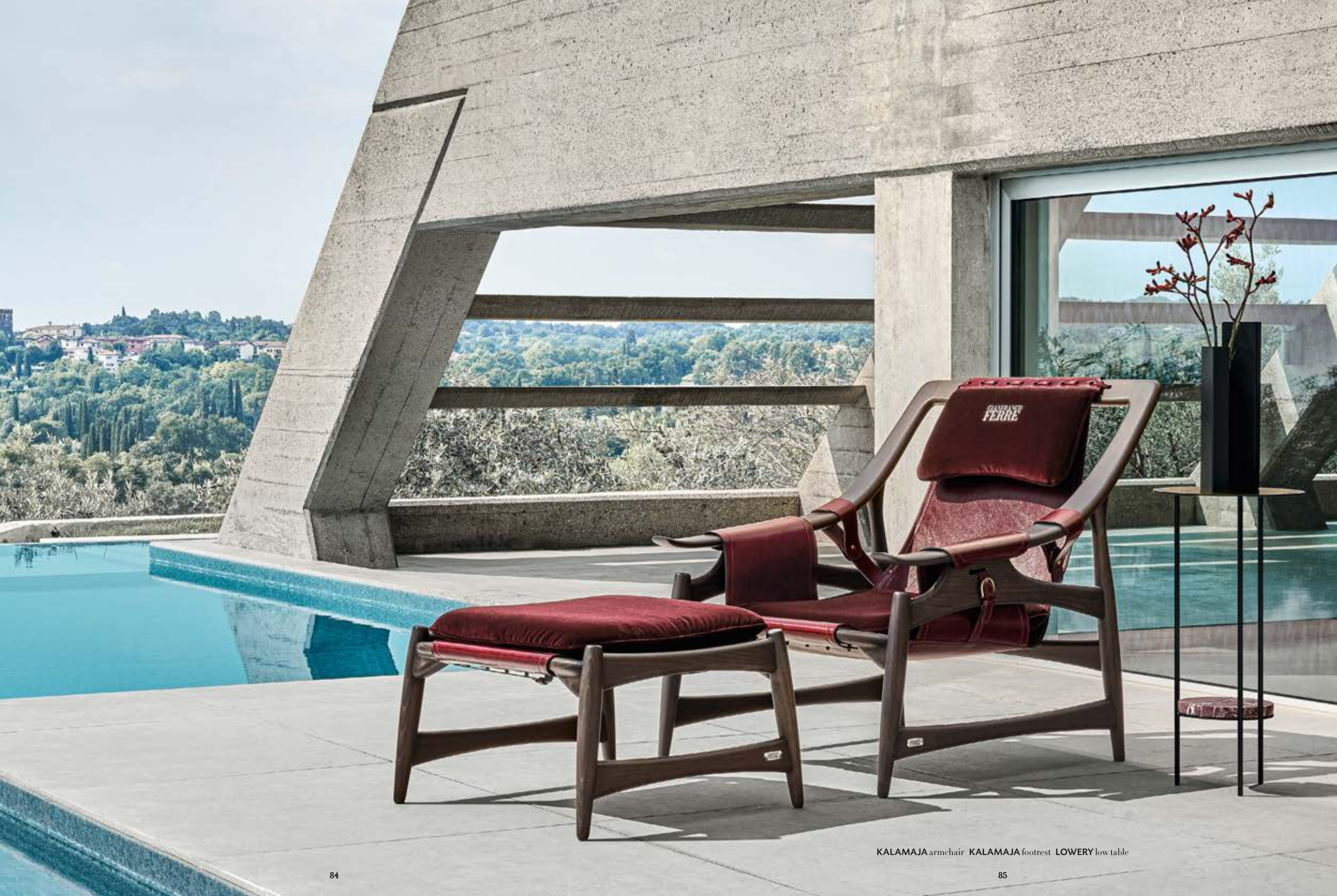
KALAMAJA armchair KALAMAJA footrest LOWERY low table