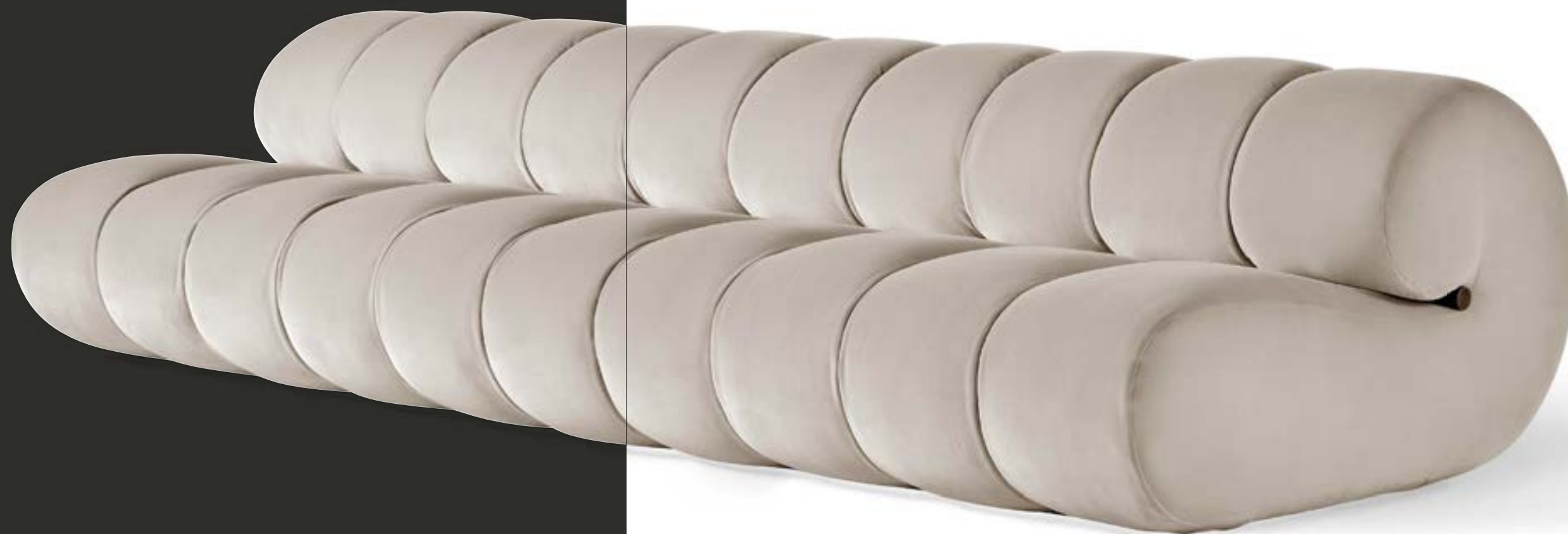
HAAGA 4-seater sofa

A bold expression of design and comfort, the HAAGA sofa seduces with its soft, modular volumes and a vintage soul. Its rounded geometry, inspired by the classic capitonné, is reimagined with contemporary flair, creating a statement piece that feels both sculptural and inviting. Upholstered in the collection's refined fabrics or leathers and enriched by sleek metallic details, HAAGA is a celebration of tactile beauty and modern elegance.