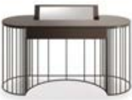
F.DOP.352.ASX L 150 D 60 H 76 cm L 59 D 23 1/3 H 30 in

Drawer unit with structure and drawers in Tay Veneered Dyed Smokey Grey finishing. Upper right drawer front in marble cat. A Open Pore Travertino - Matt. Handles in Dark Brown Saddle Leather with metal elements in matt Black finishing. Drawers with inner lining in microfibre col. Anthracite. Base in metal with Brushed Bronze finishing.