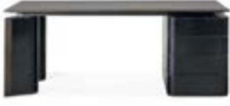
F.DAV.411.A0X + F.DAV.805.A1X L 200 D 90 H 75 cm L 78 3/4 D 35 1/2 H 29 1/2 in

Bookcase with structure in marble cat. A Open Pore Travertino - Honed. Structural bars in matt brass. Coupled clear and smoked glass shelves with GF logo.