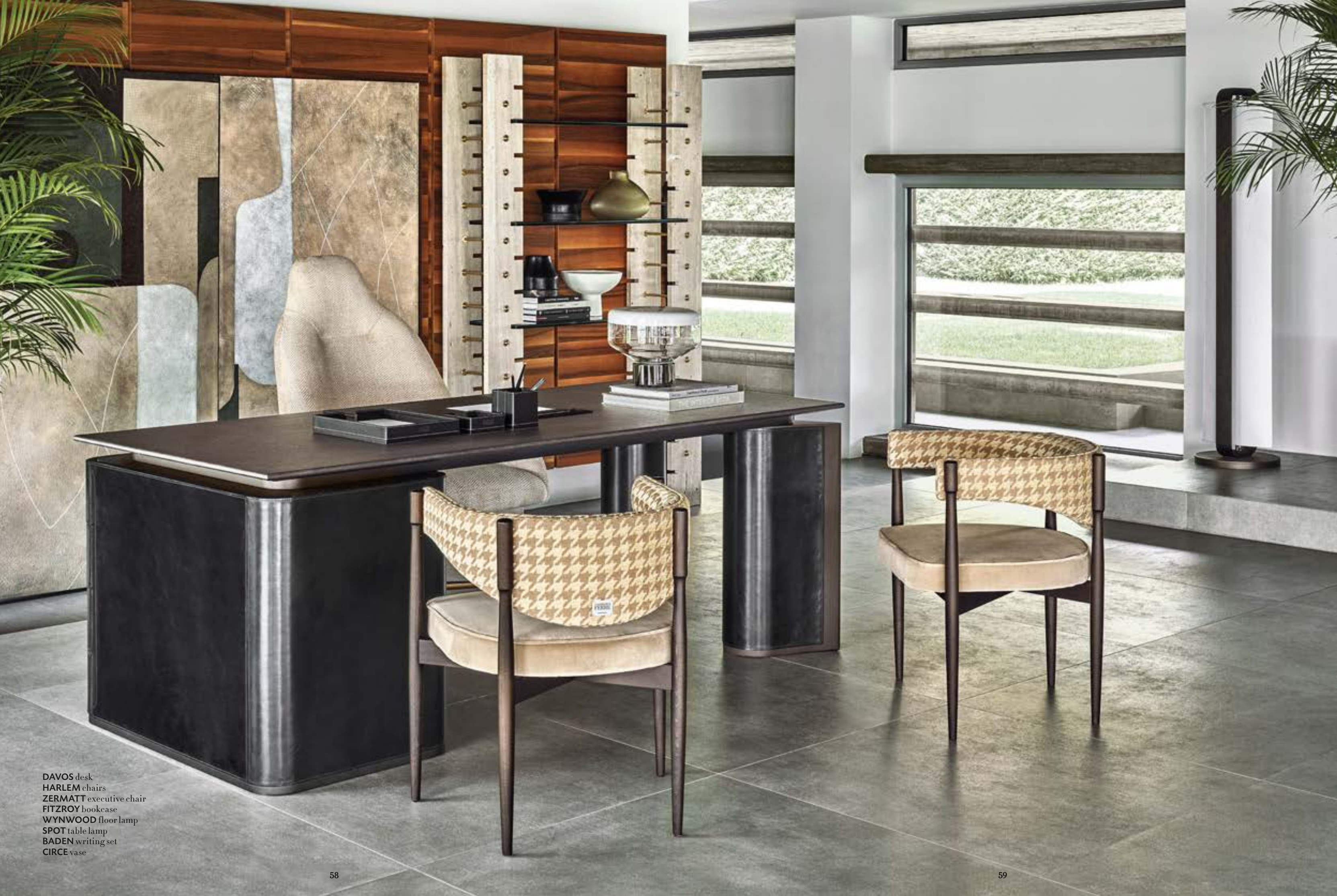
DAVOS desk HARLEM chairs ZERMATT executive chair FITZROY bookcase WYNWOOD floor lamp SPOT table lamp BADEN writing set CIRCE vase