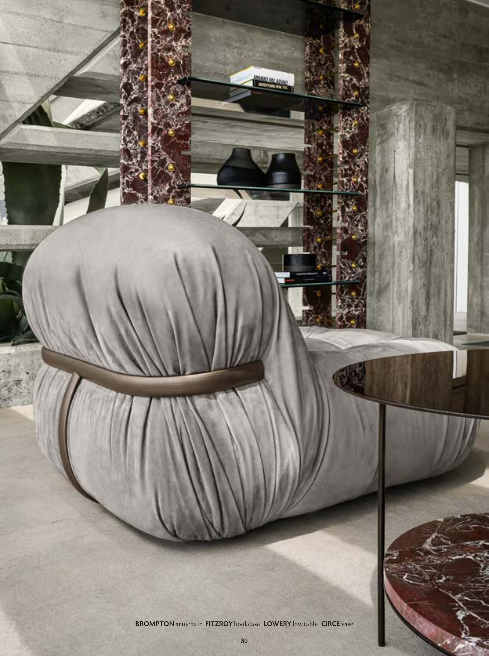
BROMPTON armchair FITZROY bookcase LOWERY low table CIRCE vase