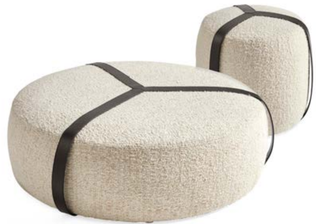
BROOKLYN poufs DOPPLER low table BADEN change trays