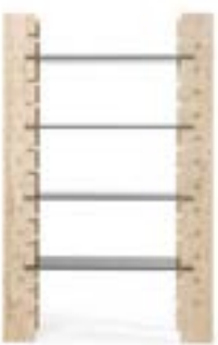
F.FIT.241.AIG L 130 D 38 H 213 cm L 51 D 15 H 83 3/4in

Bookcase with structure in marble cat. B Rosso Levanto - Matt. Structural bars in matt brass. Coupled clear and smoked glass shelves with GF logo.