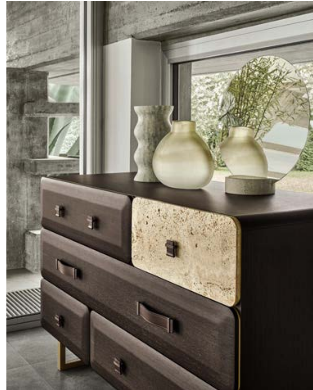
KAUNAS BOUND bed FIVE POINTS night table FIVE POINTS drawer unit MOON mirror CIRCE vase