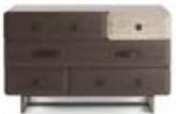
F.FIV.324.ASX + F.FIV.801.DXX L 130 D 52 H 81 cm L 51 1/4 D 20 1/2 H 32 in

Night table with structure and drawers in Tay Veneered Dyed Smokey Grey finishing. Upper right drawer front in marble cat. A Open Pore Travertino - Matt. Handles in Dark Brown Saddle Leather with metal elements in matt Black finishing. Drawers with inner lining in microfibre col. Anthracite. Open storage space covered in fabric cat. A Duchesse 25.04 col. Choconavy. Base in metal with Brushed Bronze finishing.