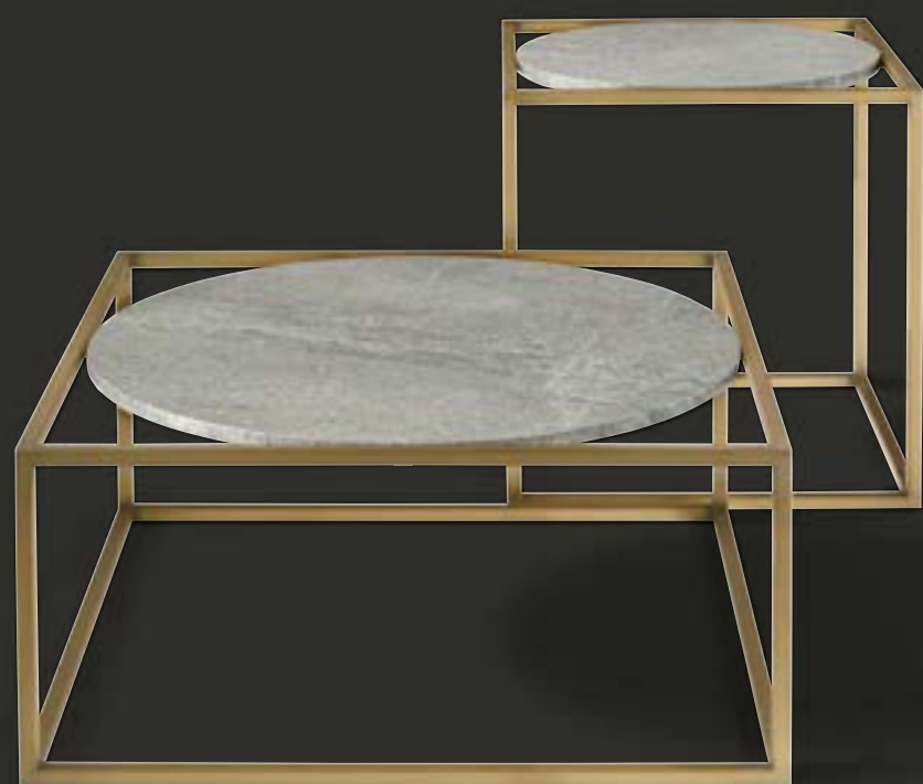
NORREBRO low tables

A bold expression of design and comfort, the HAAGA sofa seduces with its soft, modular volumes and a vintage soul. Its rounded geometry, inspired by the classic capitonné, is reimagined with contemporary flair, creating a statement piece that feels both sculptural and inviting. Upholstered in the collection's refined fabrics or leathers and enriched by sleek metallic details, HAAGA is a celebration of tactile beauty and modern elegance.