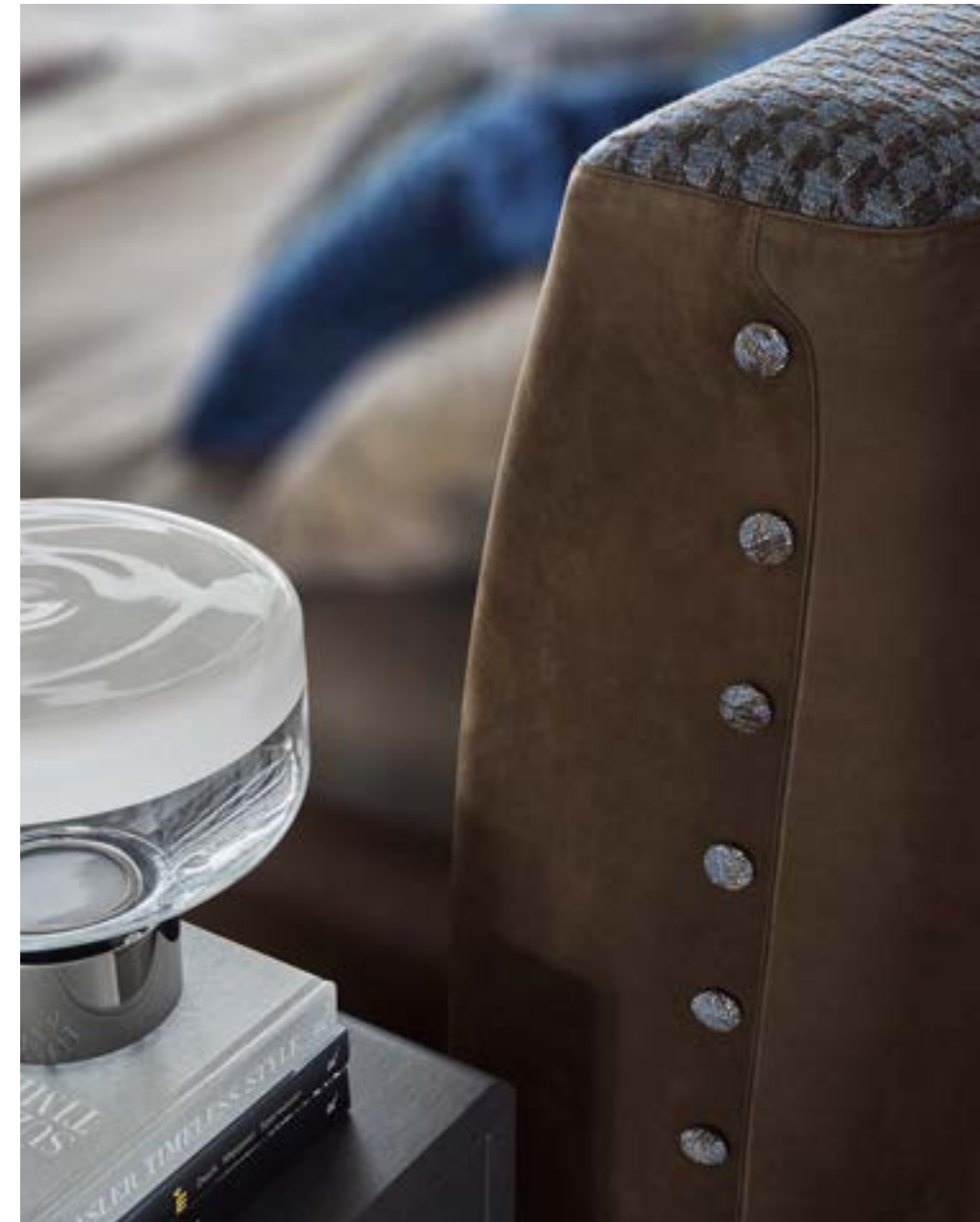
KAUNAS BOUND bed FIVE POINTS night table BASEL poufs SPOT table lamp CIRCE vase