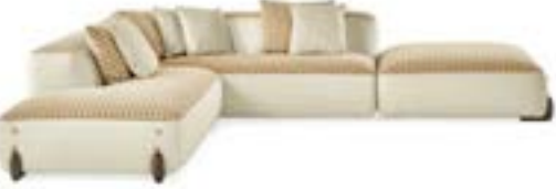
F.KA2.213.PAC + F.KA2.213.JAC + F.KA2.213.XAC + F.KAU.219.ACX + F.KAU.219.BCX (2x) + F.KA2.804.AXX (2x) + F.KAU.210.ASX (4x) L 340 D 295 H 71 cm L 134 D 116 1/4 H 28 in

4-seater sofa with structure in multilayer poplar wood and solid fir wood with padding in variable thickness high density expansive polyurethane foam and resin. Upholstery in velvet cat. A Tender 27.07 col. Ice. Metal details with Brushed Bronze finishing.