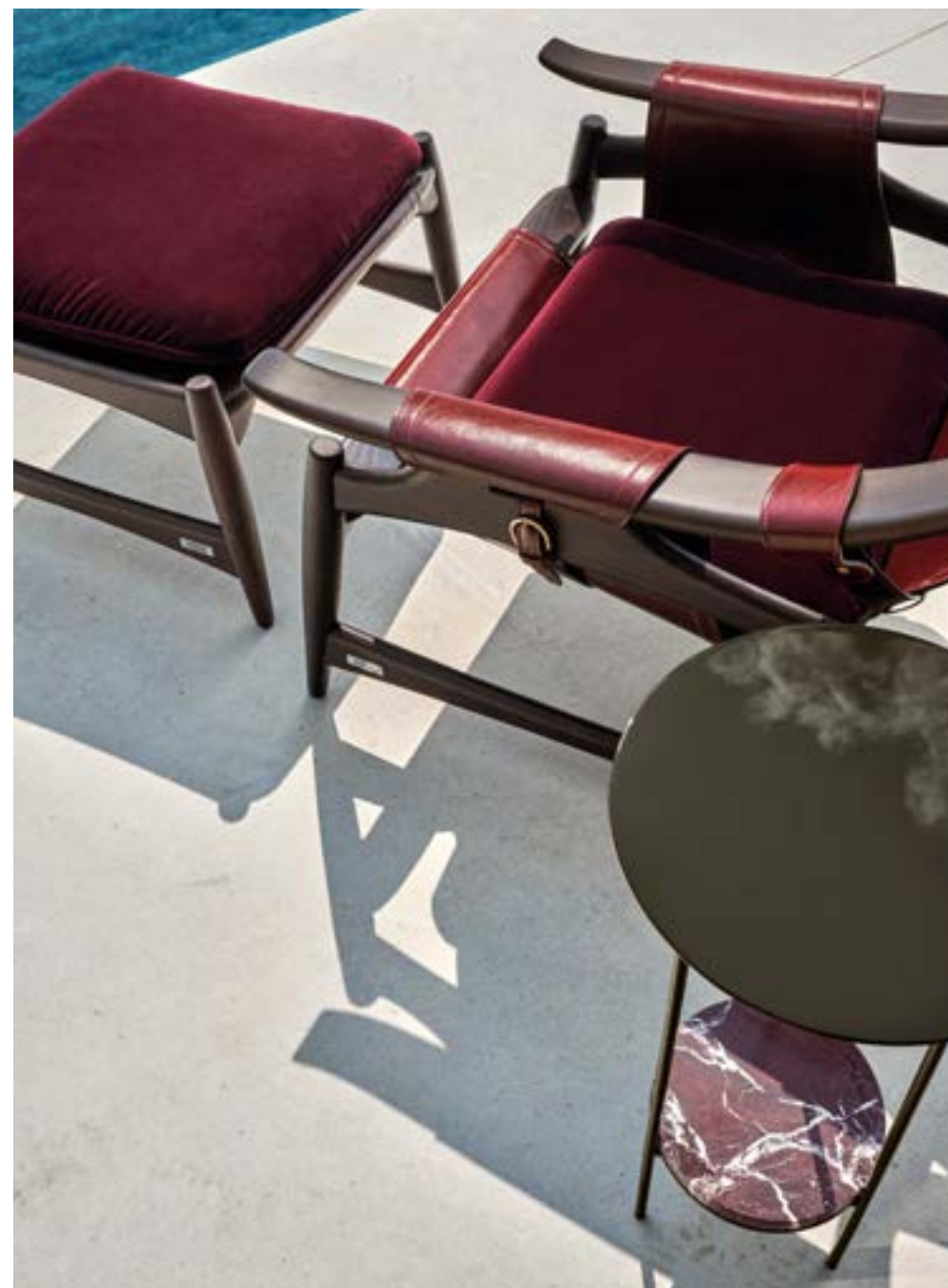
KALAMAJA armchair KALAMAJA footrest LOWERY low table