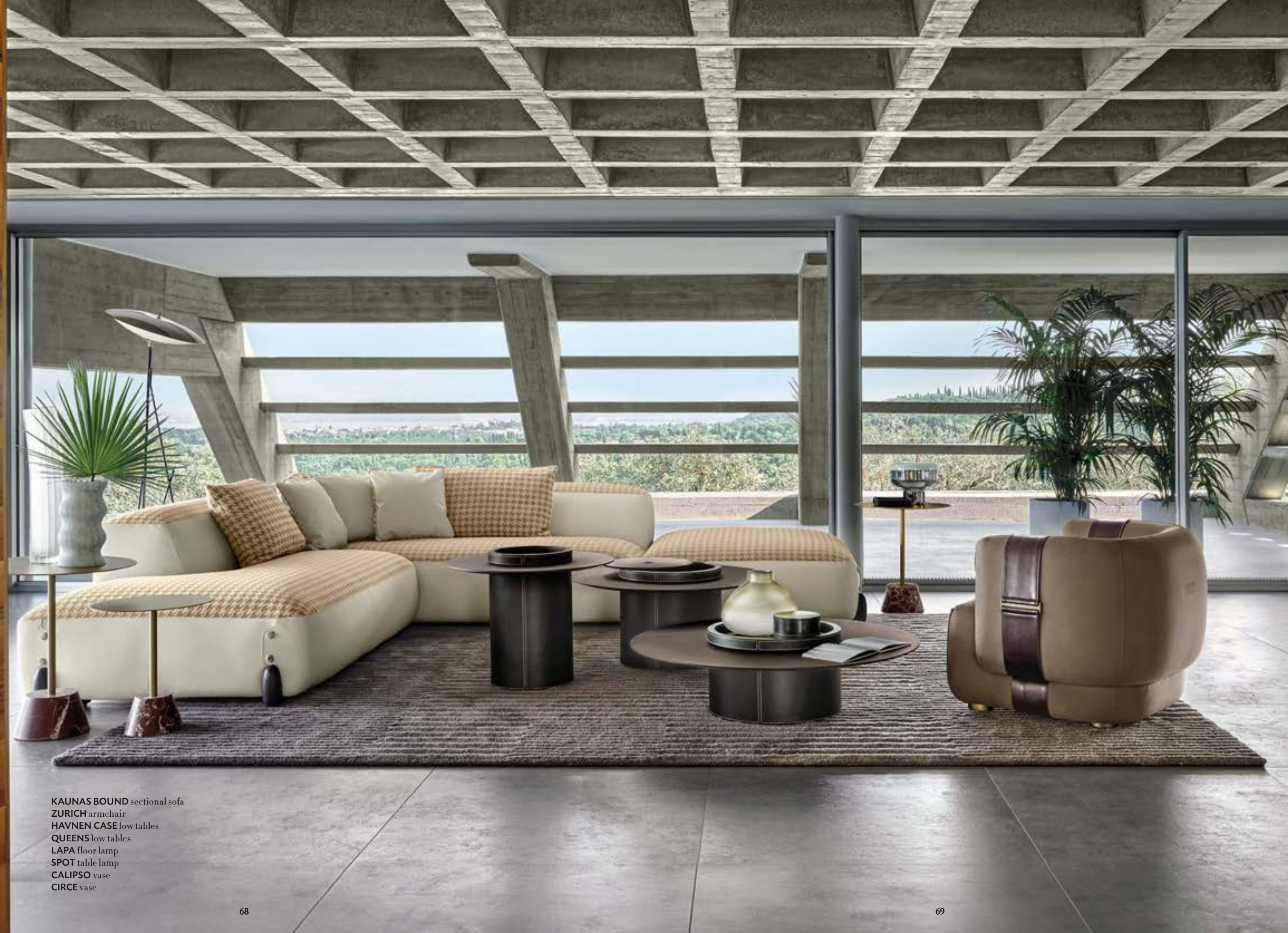
KAUNAS BOUND sectional sofa ZURICH armchair HAVNEN CASE low tables QUEENS low tables LAPA floor lamp SPOT table lamp CALIPSO vase CIRCE vase