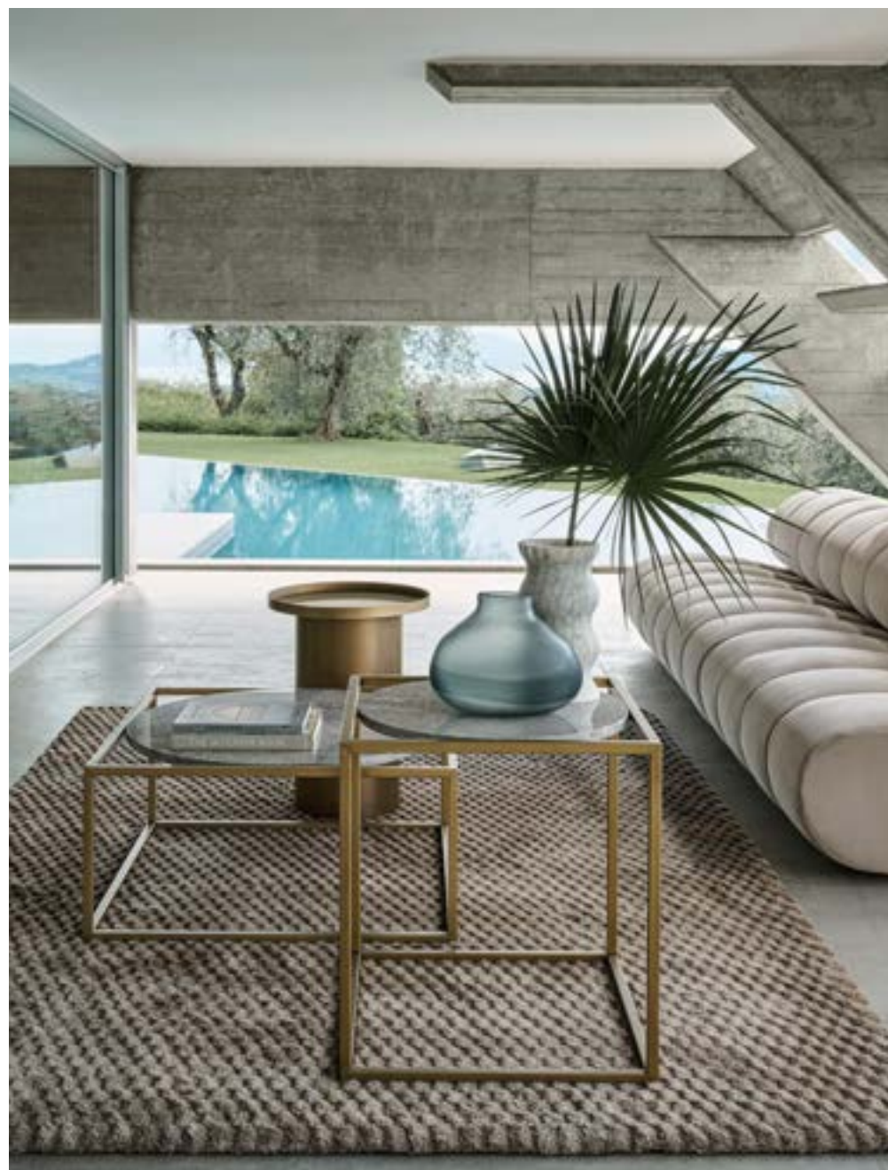
HAAGA 4-seater sofa NORREBRO low tables MOSS low table CIRCE vase