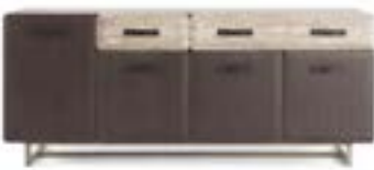
F.FIV.114.BSX + F.FIV.801.AXX L 220 D 52 H 94 cm L 86 1/3 D 20 1/2 H 37 in

Sideboard with structure, front drawers and curved doors in Tay Veneered Dyed Smokey Grey. Front drawers in marble cat. A Open Pore Travertino - Matt. Handles in Black metal and Dark Brown Saddle Leather. Internal structure and shelves covered with anthracite microfibre. Base in metal with Brushed Bronze finishing.