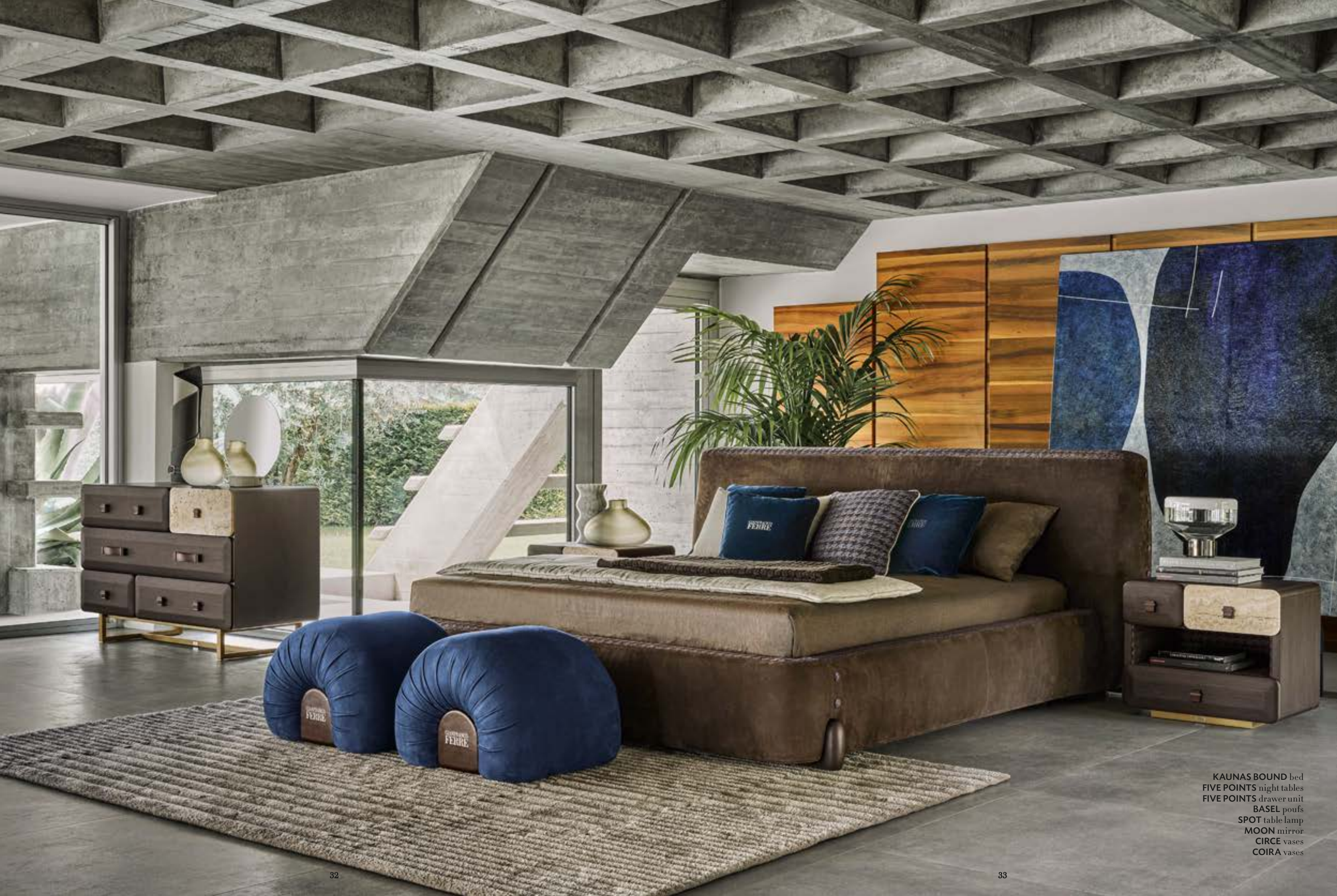
KAUNAS BOUND bed FIVE POINTS night tables FIVE POINTS drawer unit BASEL poufs SPOT table lamp MOON mirror CIRCE vases COIRA vases