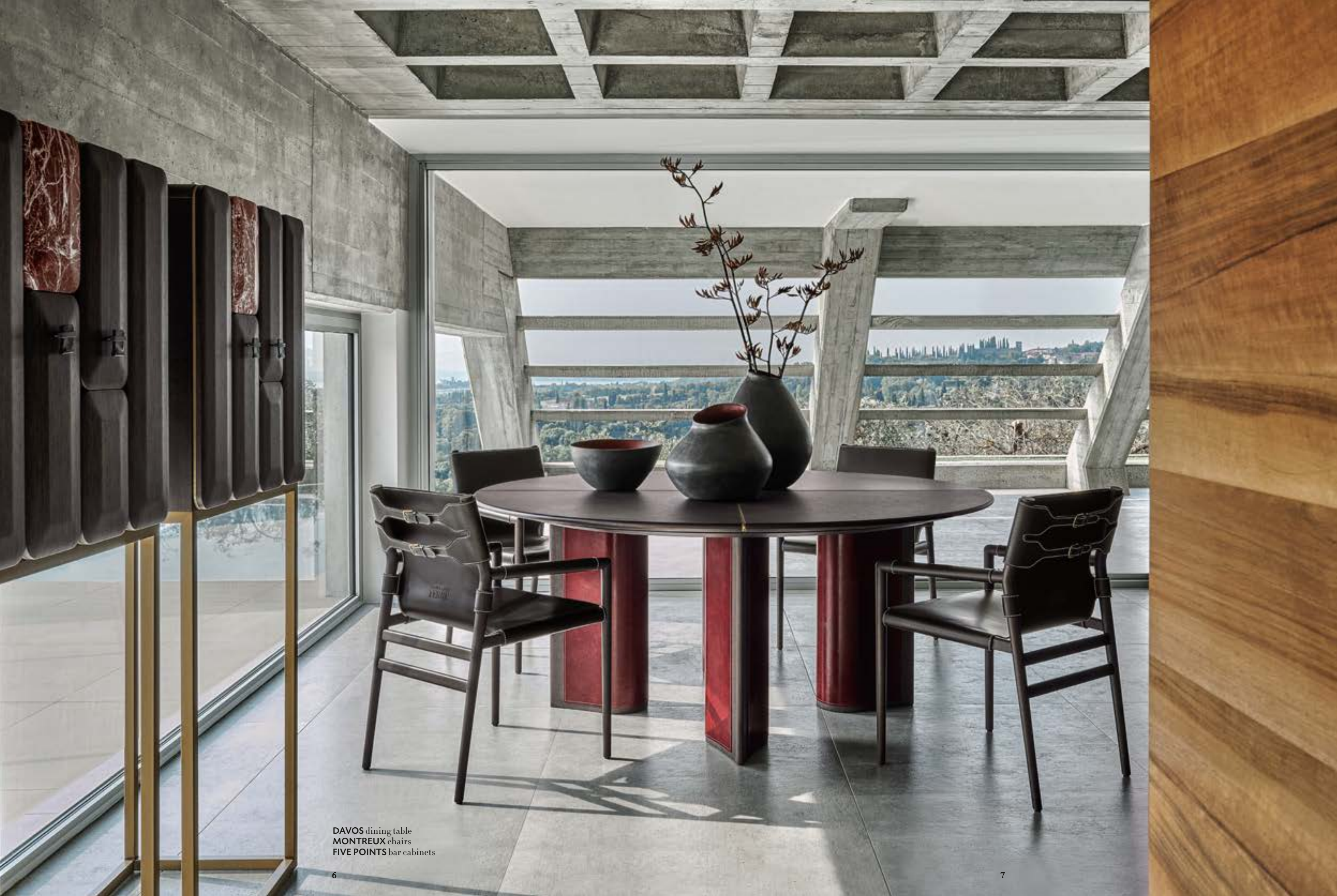
DAVOS dining table MONTREUX chairs FIVE POINTS bar cabinets