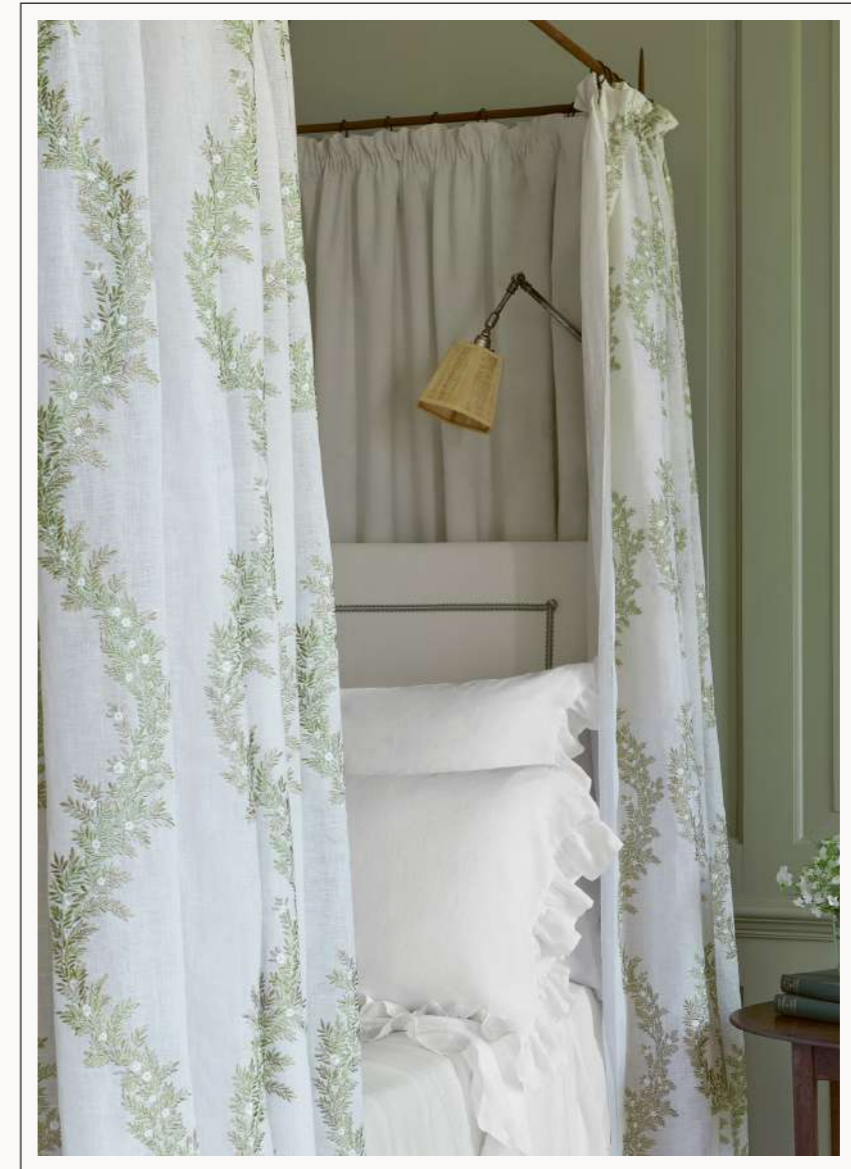
Curtain: LILIANA Lining: BECK Headboard: FOSS, NARROW PICOT BRAID Cushions: FOSS