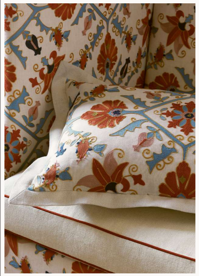
Sofa: PASHLEY, FOSS Binding: RIMINI