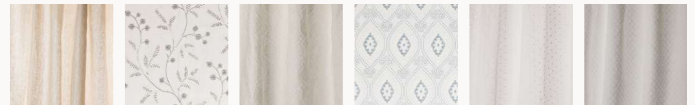
LINDALE Available in 5 colours HONITON SHEER Available in 1 colour ROSALIA Available in 1 colour STAVELEY Available in 2 colours MARGARITA Available in 1 colour ZABRINA Available in 1 colour