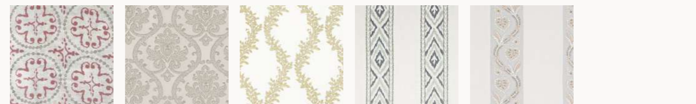
CALABRI Available in 2 colours WEXFORD Available in 2 colours LILIANA Available in 3 colours ALBURY Available in 2 colours FLORINDA SHEER Available in 2 colours