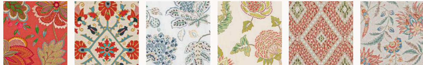
BAPTISTA Available in 6 colours PASHLEY Available in 4 colours BRAGANZA Available in 3 colours JESSAMINE Available in 2 colours ROWLEY Available in 3 colours CAMPION Available in 3 colours