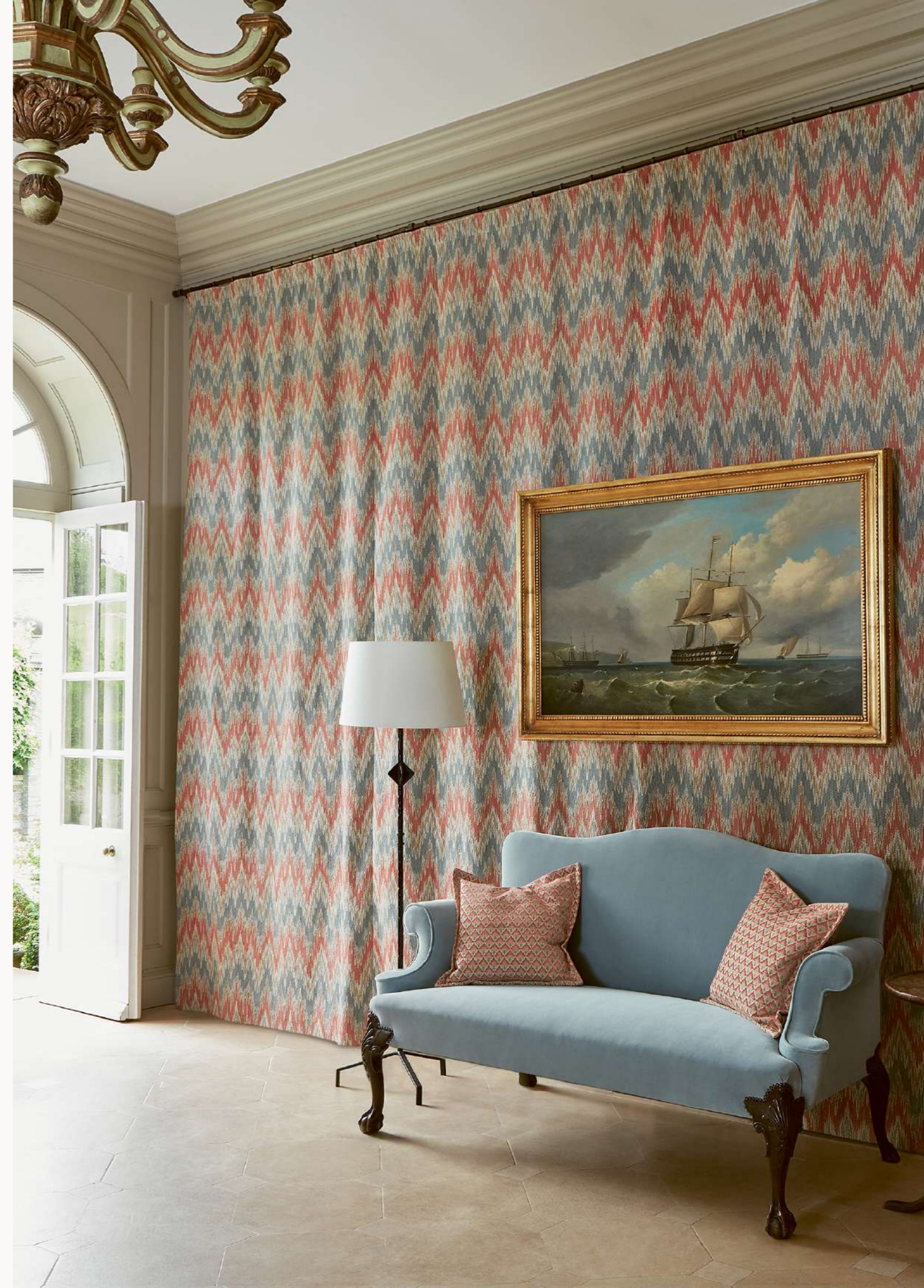
Curtain: MEDORA Sofa: DANTE Cushions: CARLOTTA