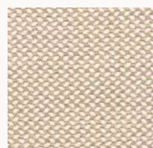
ERITH Available in 10 colours