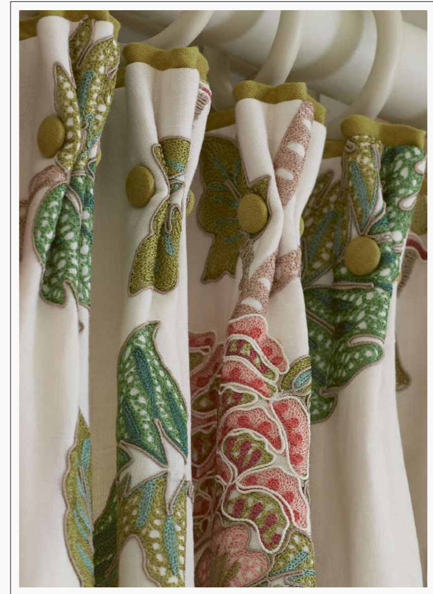
Curtain: JESSAMINE Buttons: FABRY Daybed: ERITH Cushion: HUGO, DELANO FAN EDGE