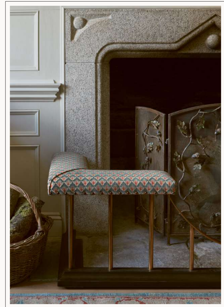
Chair: CAMPION Cushion: CARNFORTH Club Fender: CARLOTTA