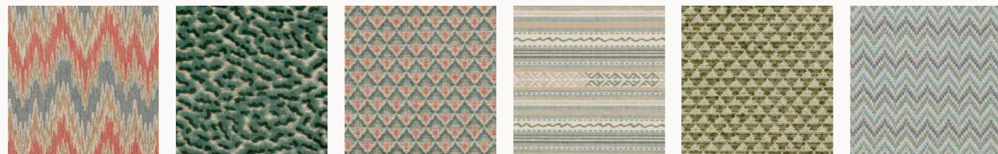
MEDORA Available in 4 colours KEMBLE Available in 6 colours CARLOTTA Available in 6 colours GENISTA Available in 4 colours NEWLAND Available in 5 colours CHANDLER Available in 4 colours