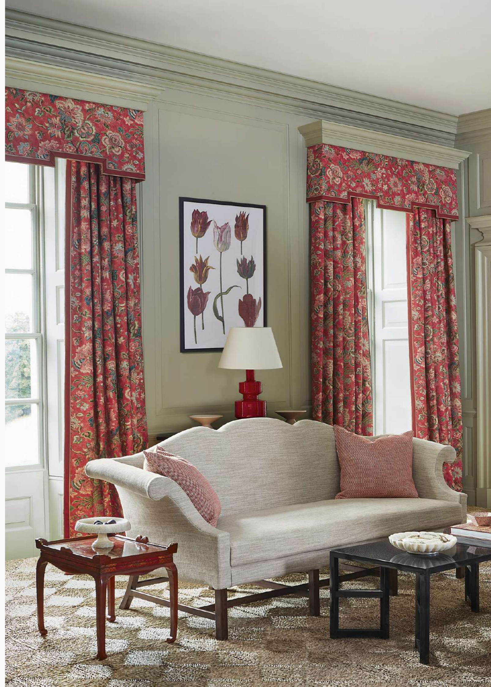
Curtain: FLORES Braid: DELANO HERRINGBONE Sofa: CARNFORTH Cushions: ERITH