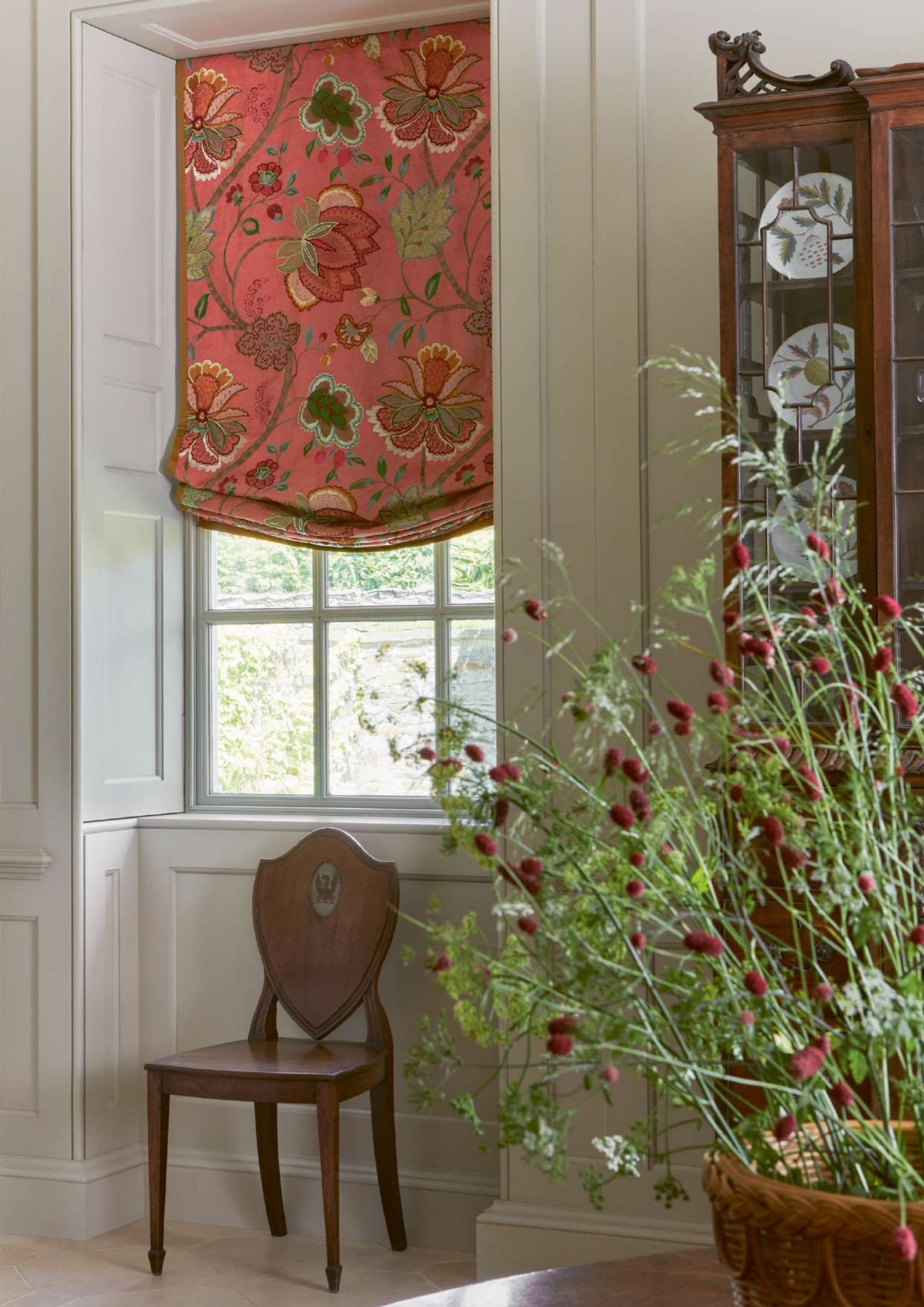
Front Cover Skirted Table: ORLANDO Trim: ARLINGTON BULLION FRINGE