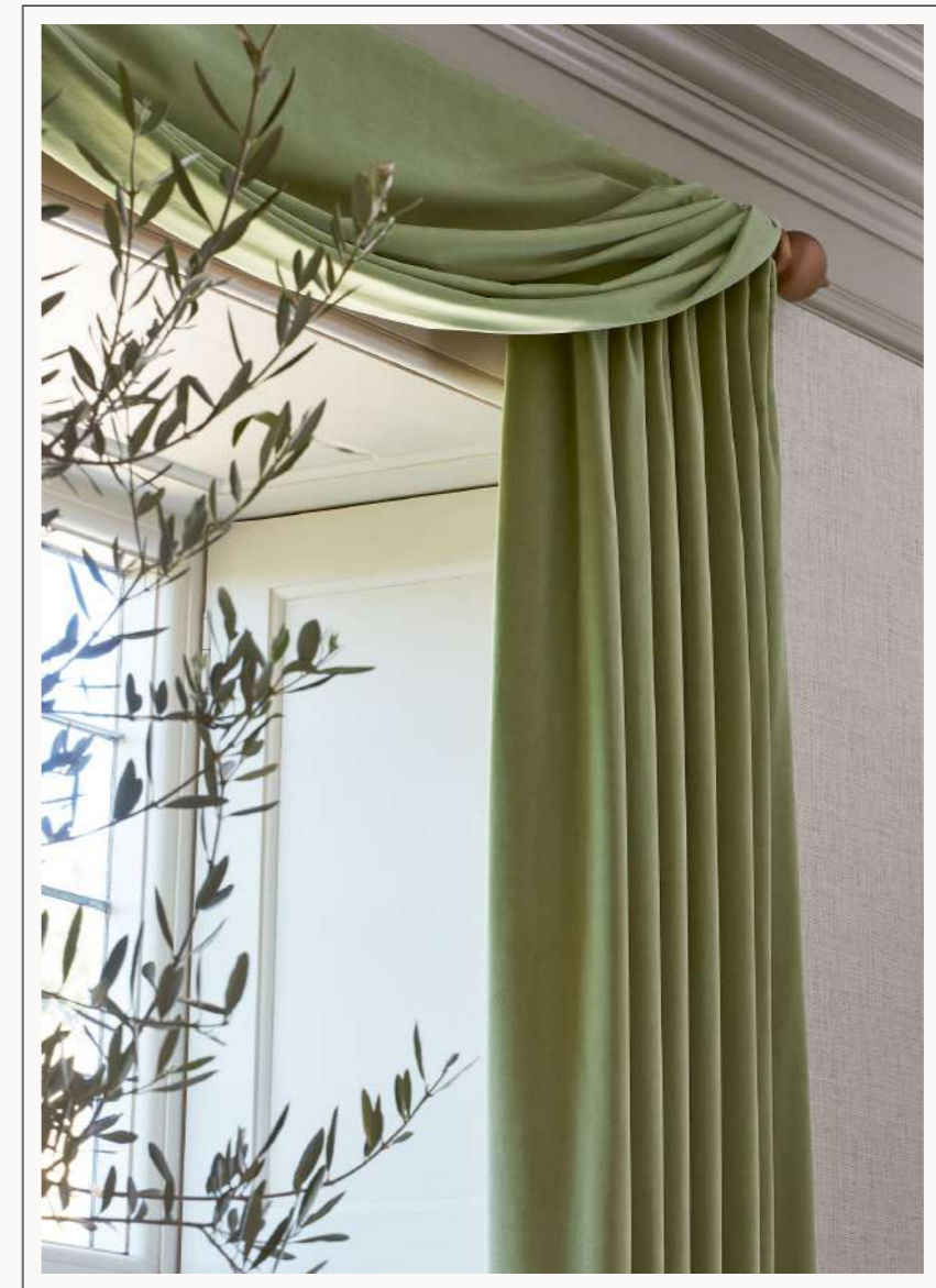
Curtain: DANTE Chairs: KELLEN Cushions: IRWIN Ottoman: GENISTA