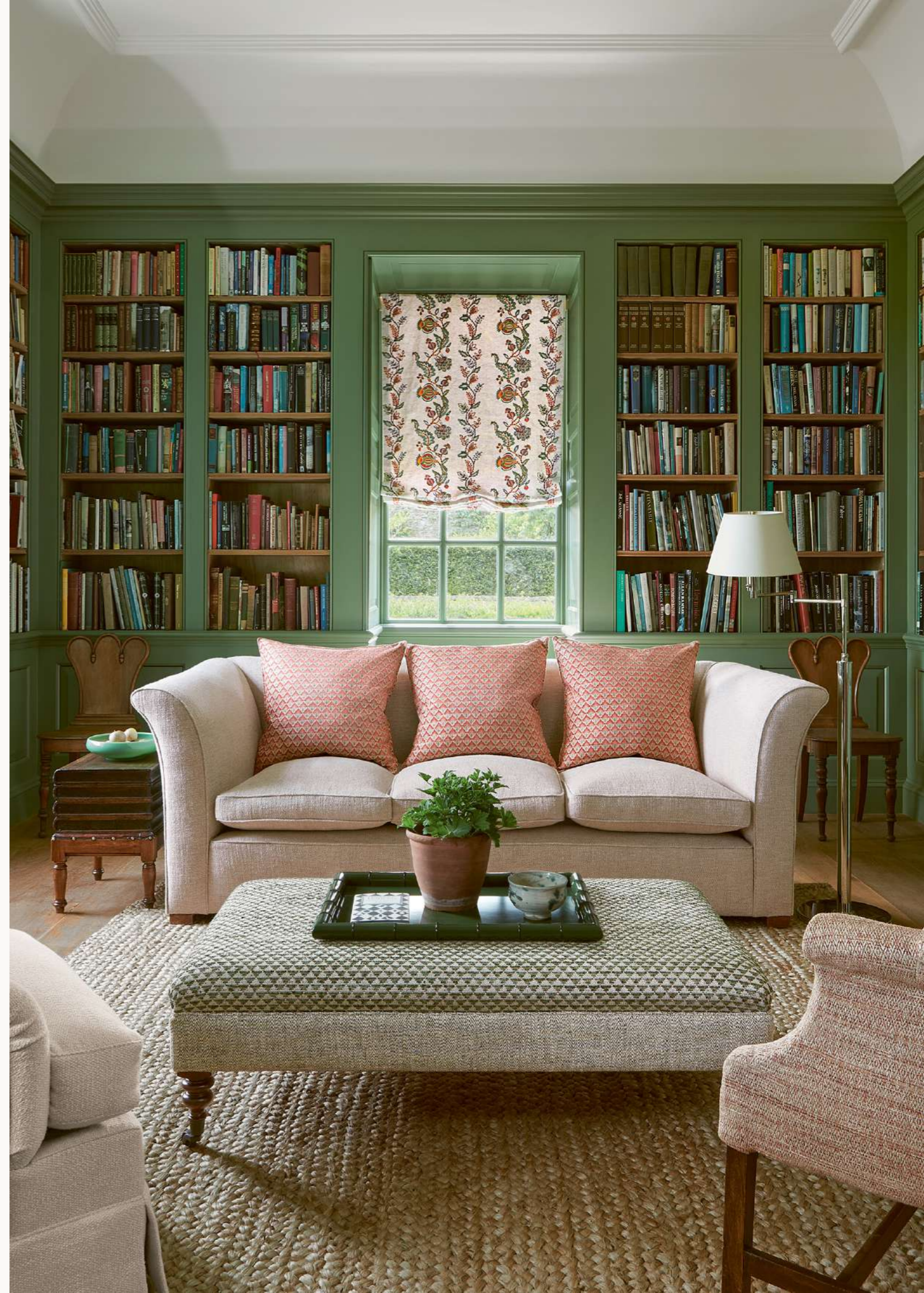
Blind: ARIADNE Sofa: TARN Cushions: CARLOTTA Ottoman: NEWLAND, TARN Chair Left: KELLEN Chair Right: HUGO