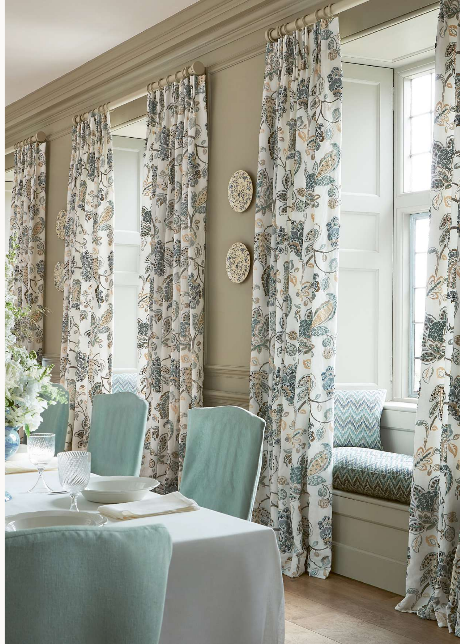
Curtain: BRAGANZA Chair Cover: BECK Window Seat: CHANDLER Tablecloth: LINDALE