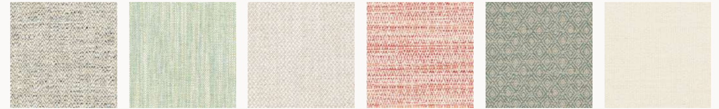
TARN Available in 7 colours CARNFORTH Available in 15 colours IVER Available in 5 colours HUGO Available in 5 colours SEBASTIAN Available in 4 colours KELLEN Available in 5 colours