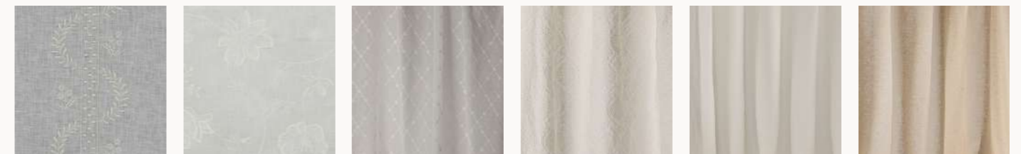
CECILE Available in 1 colour FAIRFIELD Available in 1 colour BETONY TRELLIS Available in 2 colours NANCY Available in 1 colour BUTE Available in 8 colours BECK Available in 12 colours