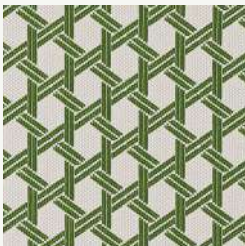
Saint Tropez Available in 5 colours