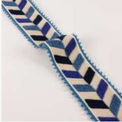
Quito Available in 4 colours