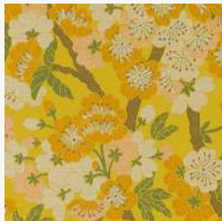
Fiorella Available in 4 colours