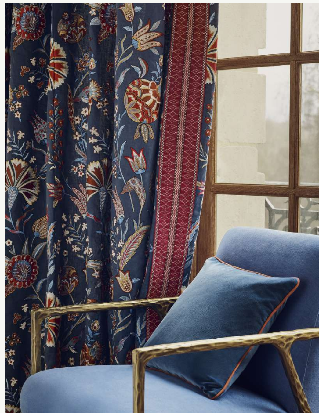
Curtain: SIKI with TULA Lampshade: HADI Chairs: OSCAR Cushions: ORSO with OSCAR Tiebacks: ARLINGTON ROPE TIEBACK