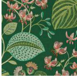
Palmaria Available in 3 colours