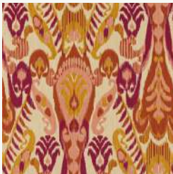
Hadi Available in 3 colours