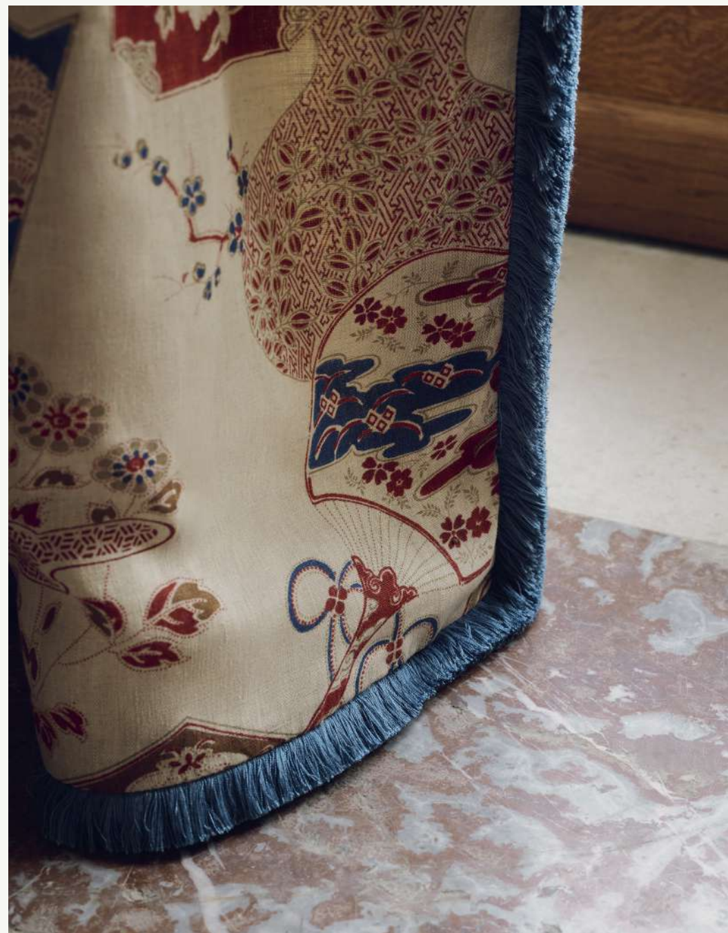
Curtain: IMARI with VISCONTI Lampshade: OSCAR