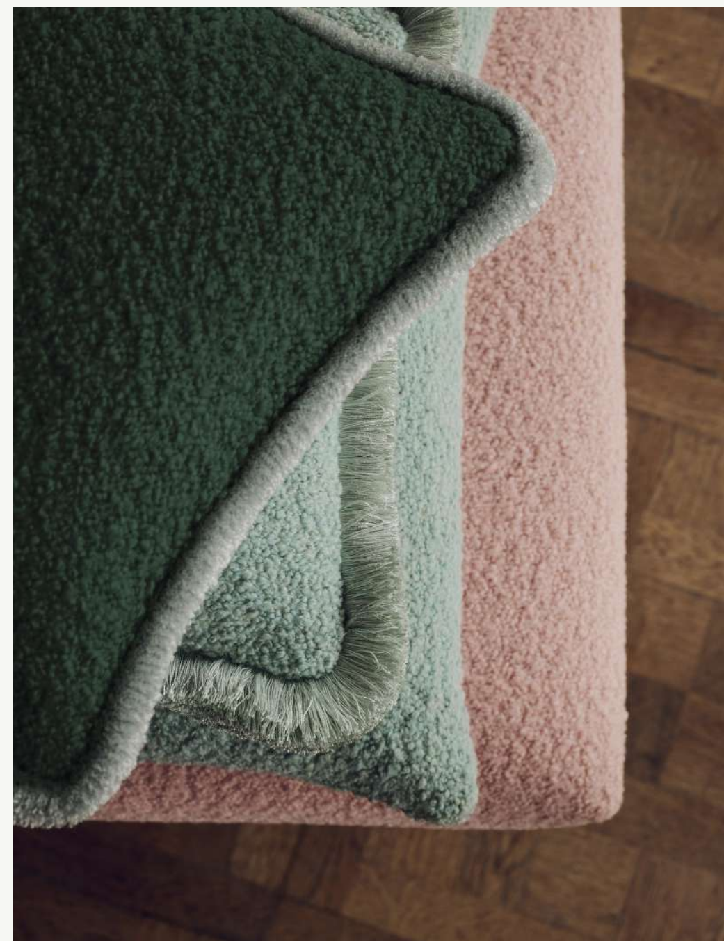
Left Sofa: GLORIA, ORSO