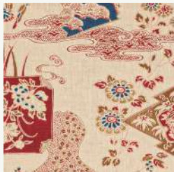
Imari Available in 3 colours