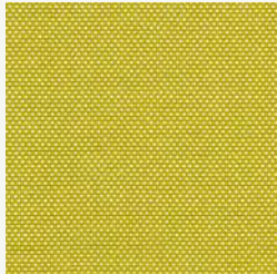
Calvi Available in 7 colours