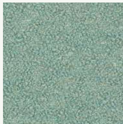
Tamaris Available in 40 colours

Back cover Curtain: FIORELLA Chair: FIORELLA, NURA