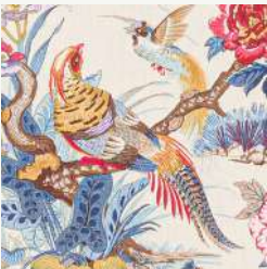
Marsan Available in 3 colours