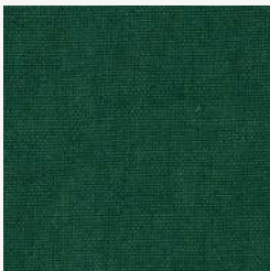
Gloria Available in 18 colours