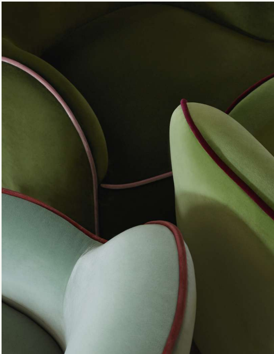
Chairs and piping: ORSO