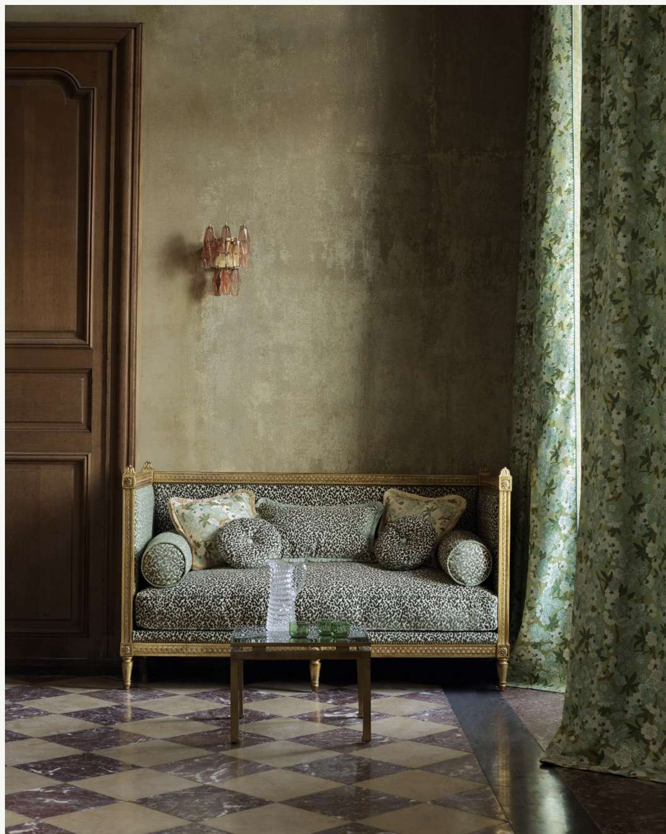
Curtain: FIORELLA with BERTILLE Daybed: TOBAGO