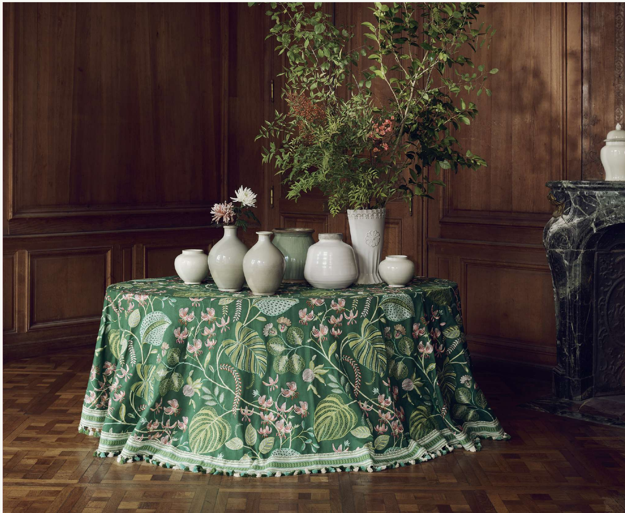
Tablecloth: PALMARIA with LIMA