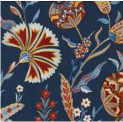
Siki Available in 3 colours