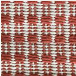
Sanary Available in 7 colours