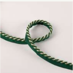
Wagram Available in 9 colours