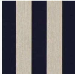
Portofino Available in 5 colours