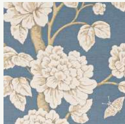
Thais Available in 3 colours