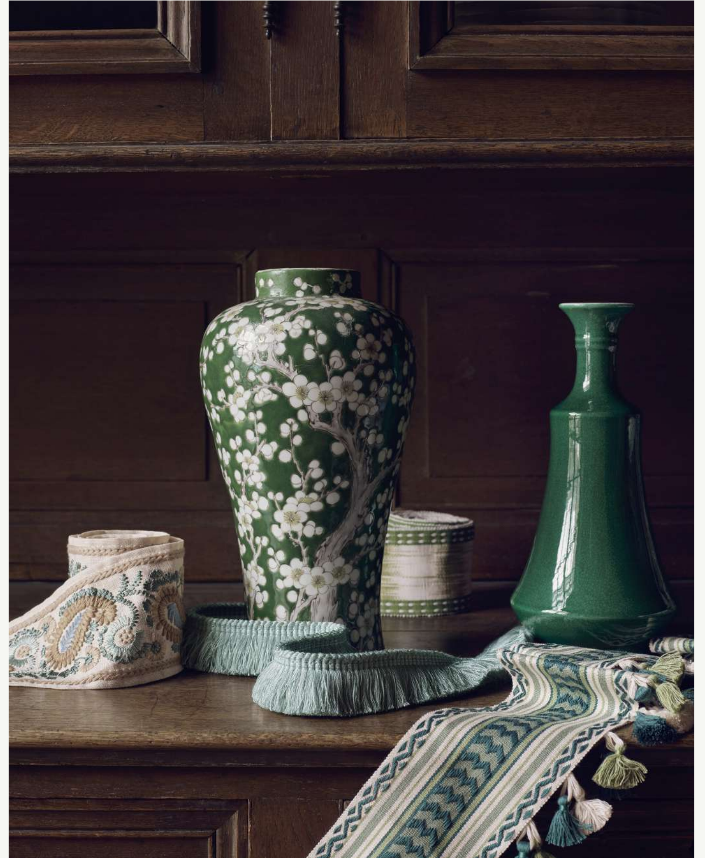
Trims ( left to right ): SATI, VISCONTI, ARYA, LIMA