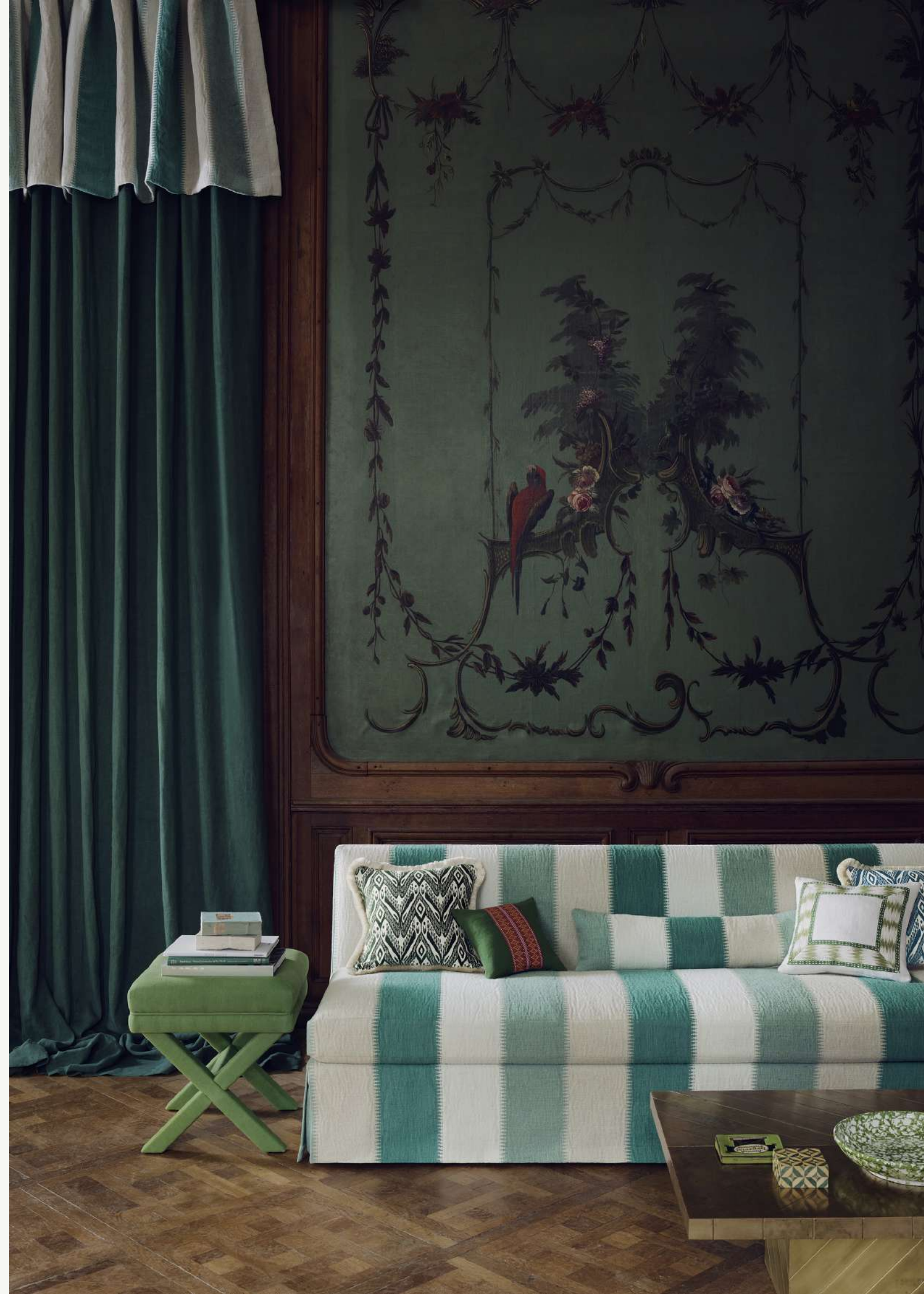
Right Curtain: OSCAR, REKHA Stool: OSCAR Sofa: REKHA Cushions ( left to right ): PADANG with VISCONTI, OSCAR with TULA, REKHA, OSCAR with ARYA, PADANG with VISCONTI