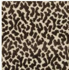
Tobago Available in 11 colours