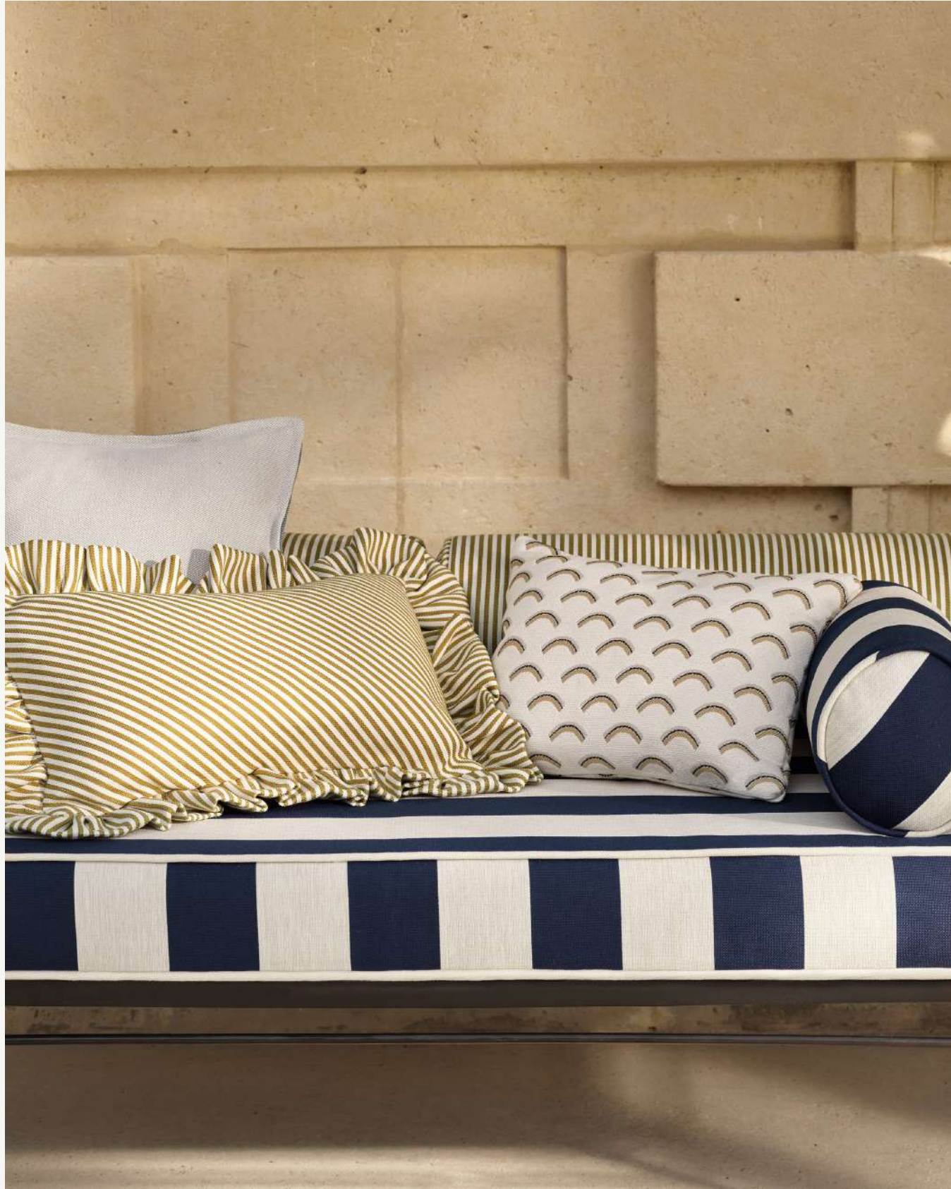
Daybed and bolster cushions: PORTOFINO Cushions ( left to right ): CALVI, CROISSETTE, TAMARIS