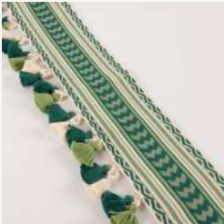
Lima Available in 6 colours