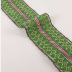
Tula Available in 5 colours