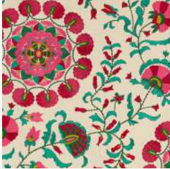
Koti Available in 3 colours