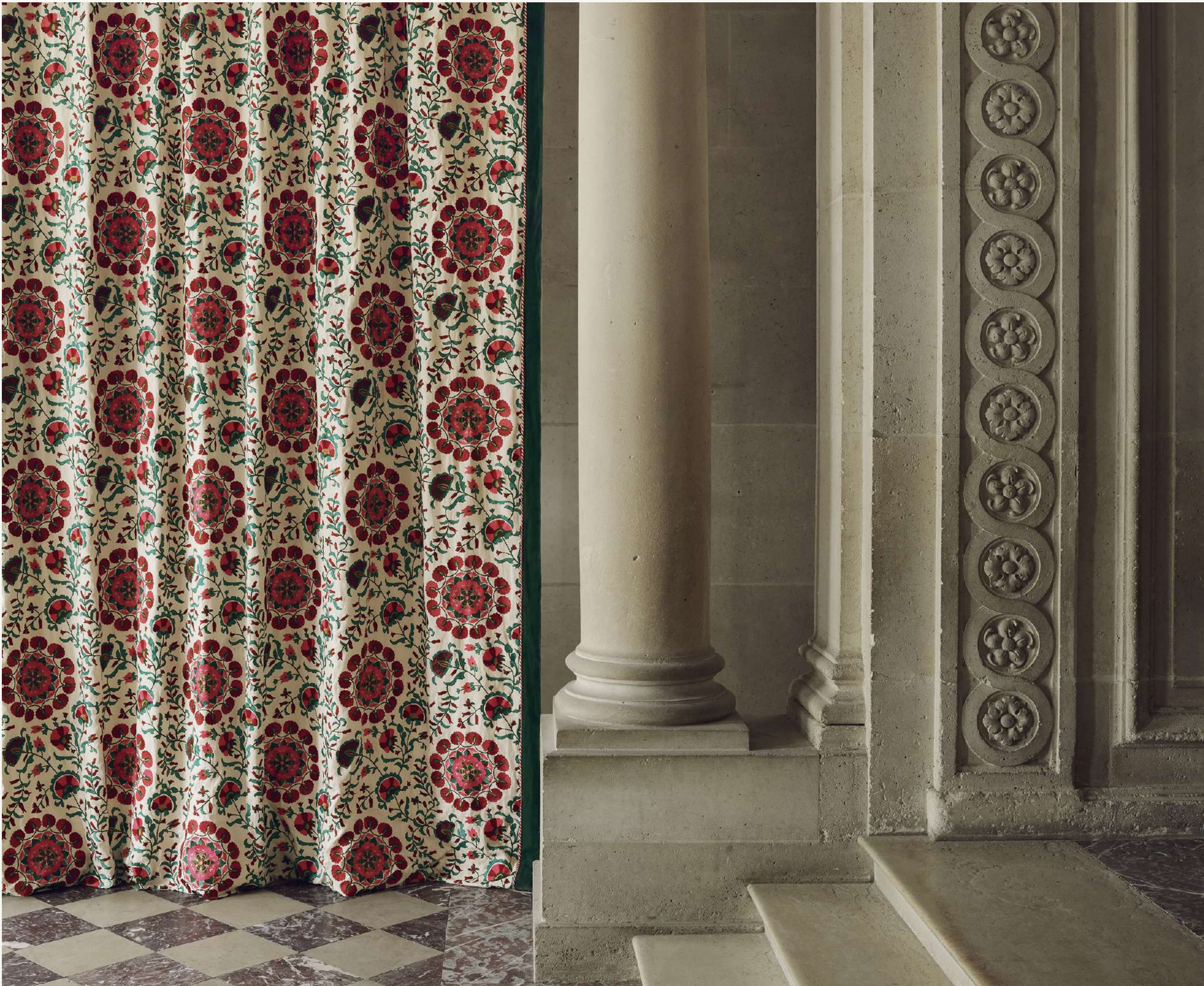
Curtain: KOTI with OSCAR and WAGRAM