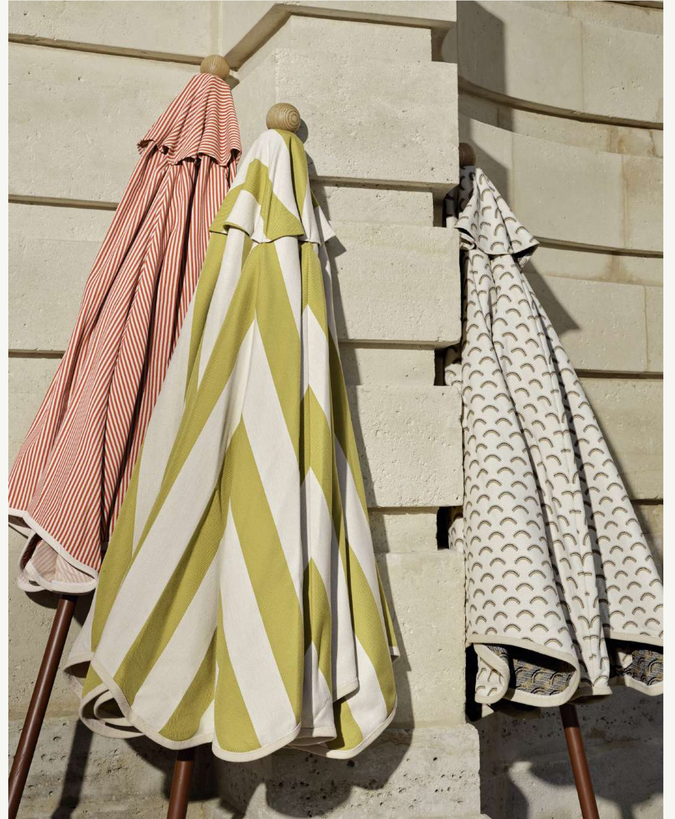
Parasols: CROISSETTE, PORTOFINO, TAMARIS