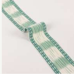
Arya Available in 3 colours