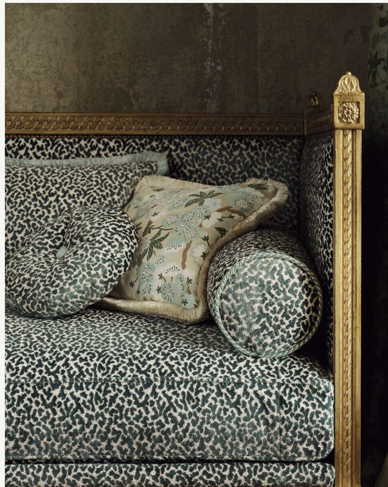
Circle cushion: TOBAGO with OSCAR Bolster cushion: TOBAGO with WAGRAM Square cushion: FIORELLA with VISCONTI