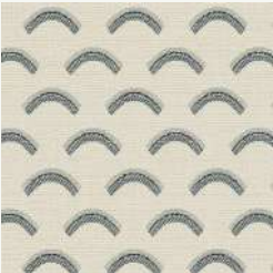
Tamaris Available in 6 colours