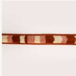
Clery Available in 5 colours