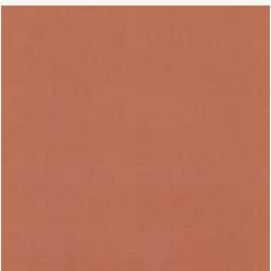
Orso Available in 37 colours