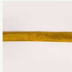
Romane Available in 6 colours