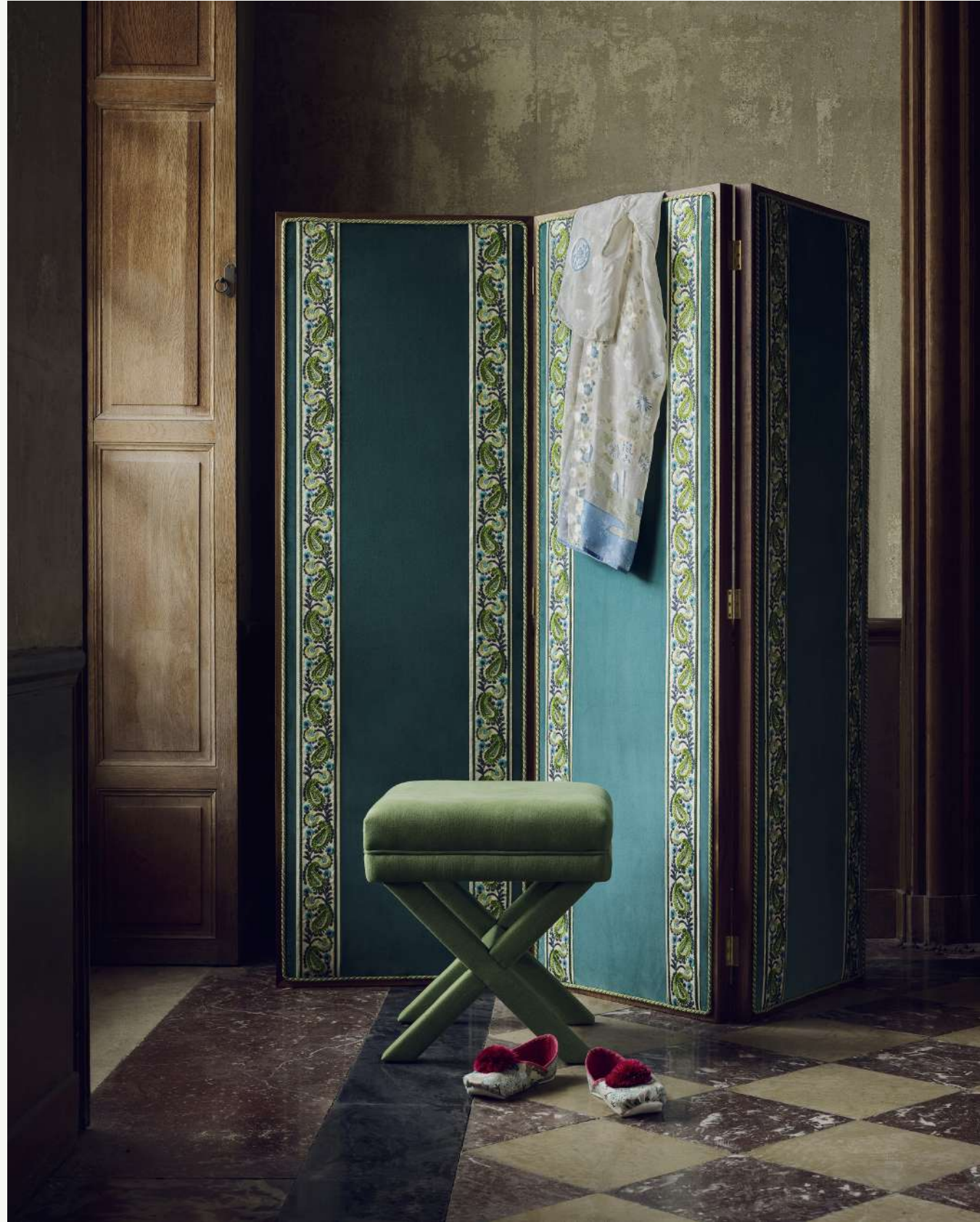
Screen: ORSO with SATI and WAGRAM Stool: OSCAR