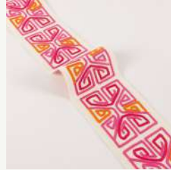
Coba Available in 4 colours