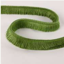
Visconti Available in 8 colours