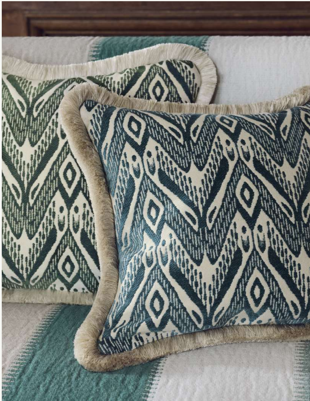
This page Cushions: PADANG with VISCONTI