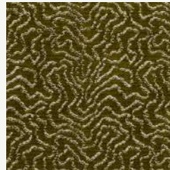
Titus Available in 9 colours