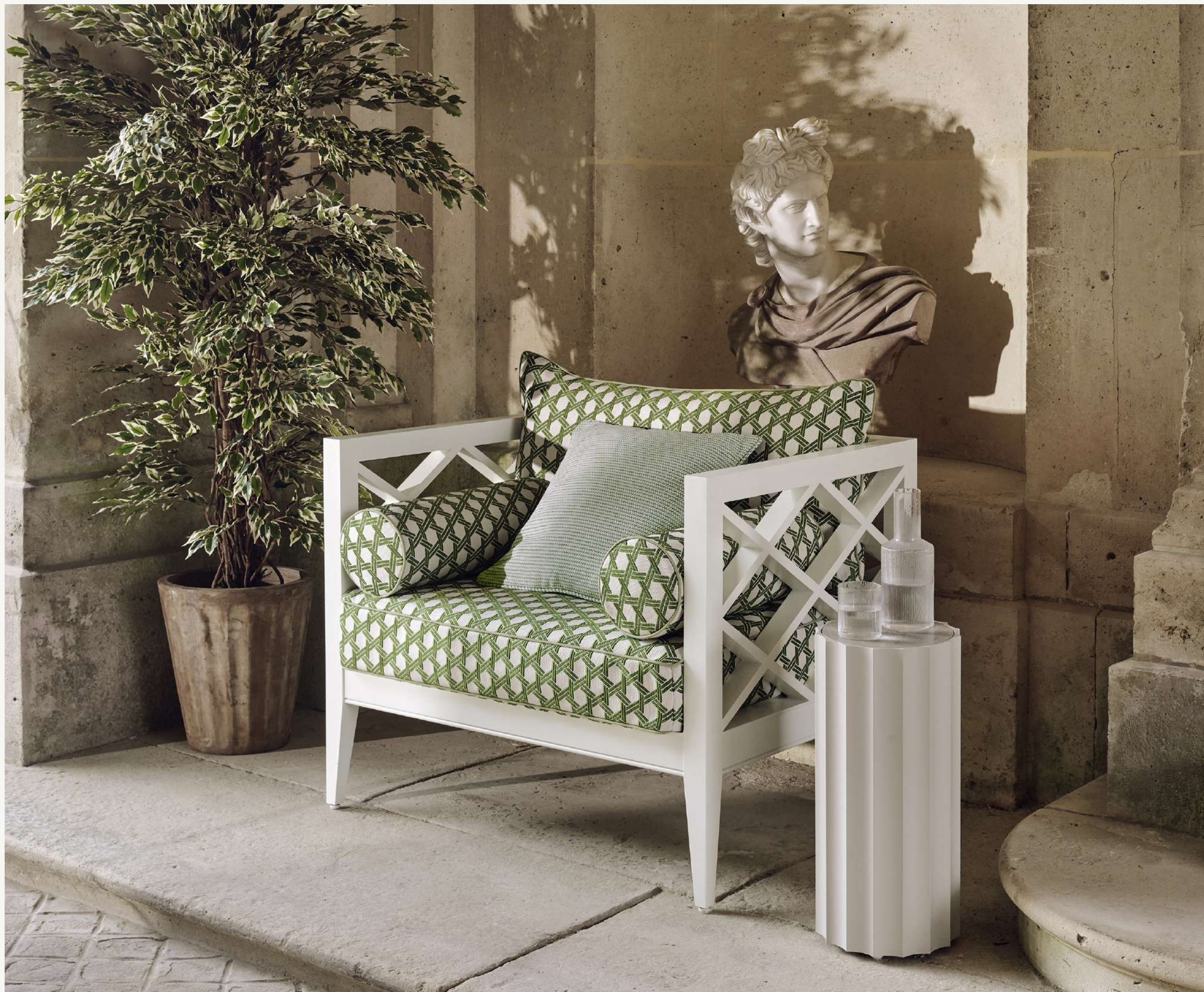
Chair and bolster cushions: SAINT-TROPEZ with CALVI Cushion: CASSIS