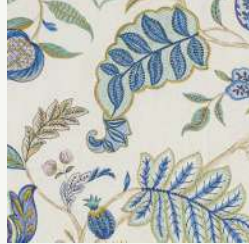
Colombe Available in 3 colours