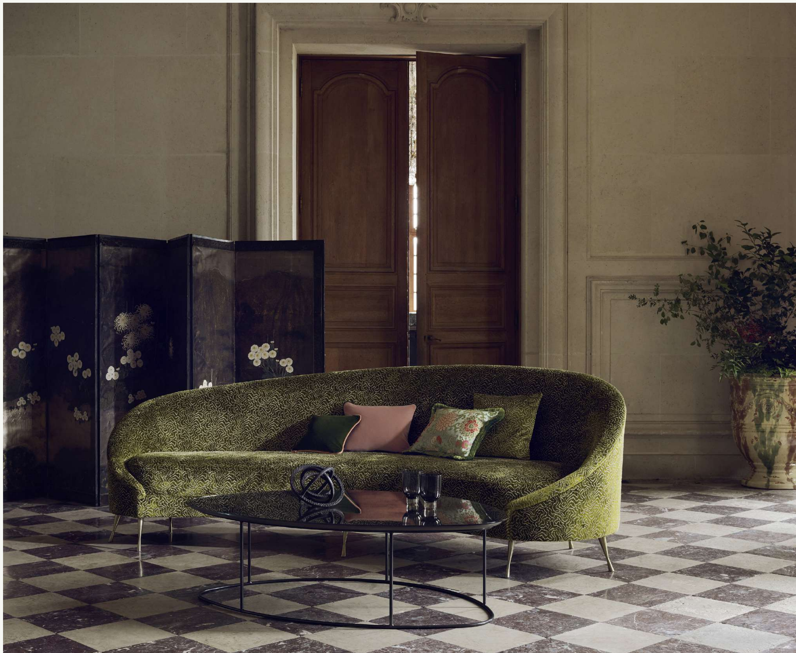
Sofa: TITUS Cushions ( left to right ): ORSO, LIAO with VISCONTI, TITUS