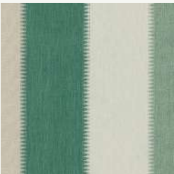
Rekha Available in 3 colours