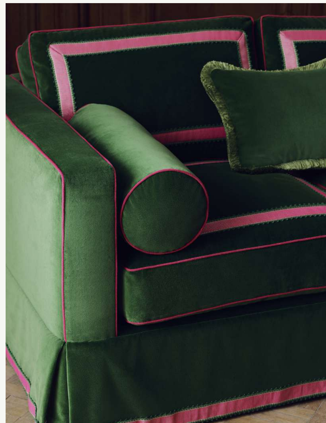
Sofa and bolster cushions: ORSO with OSCAR and BETILLE Rectangular cushion: ORSO with VISCONTI Square cushion: ORSO with CLERY