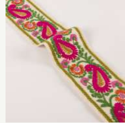
Sati Available in 5 colours