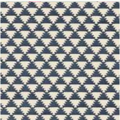
Palto Available in 9 colours