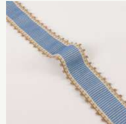
Bertille Available in 5 colours