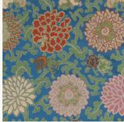
Liao Available in 4 colours