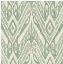
Padang Available in 6 colours