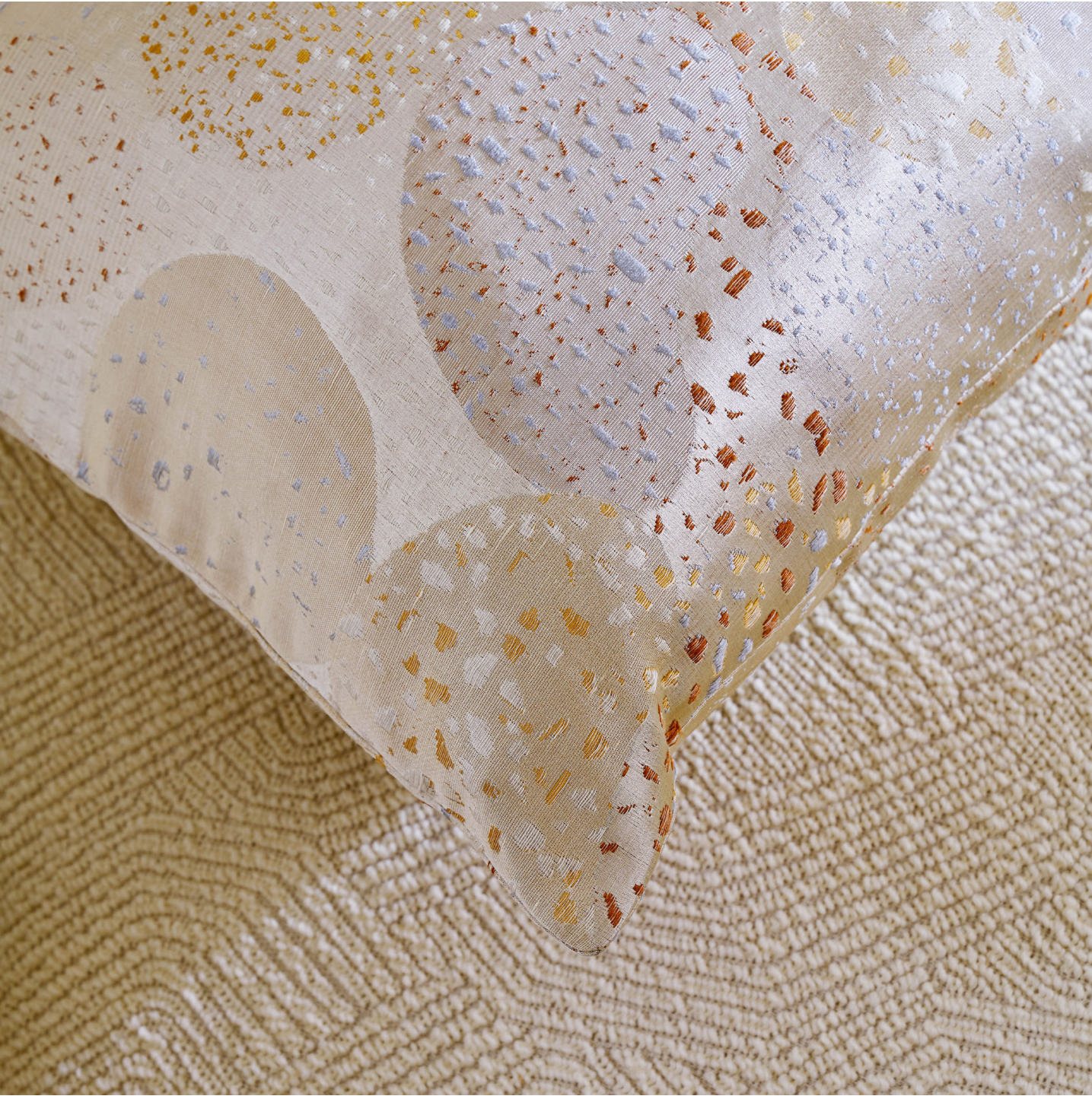
Cushion: Pepite Background: Alta