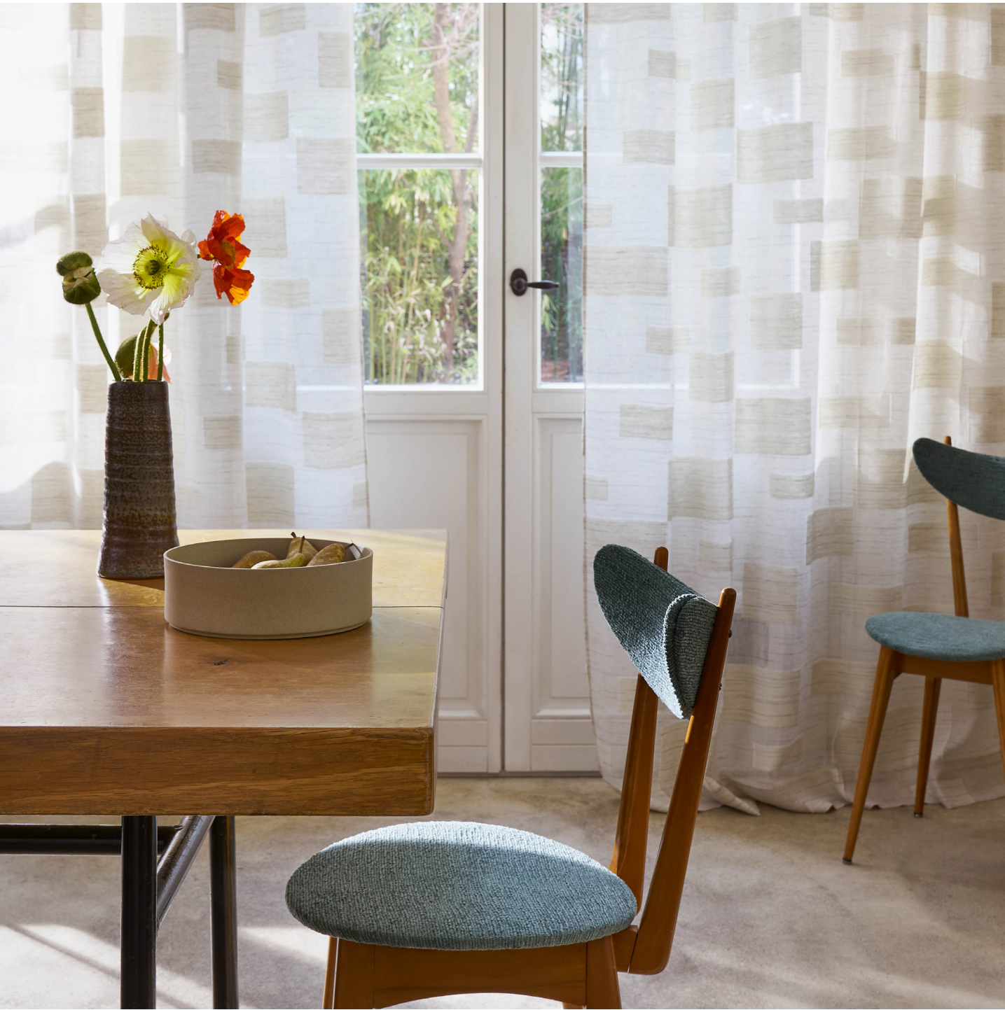
Curtains: Blocks Chairs: Montana