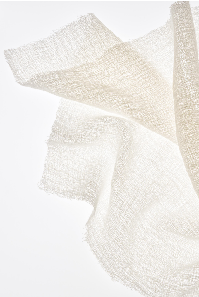
Fabrics clockwise from top left: Mistral, Fog, Wind Opposite: Alizee