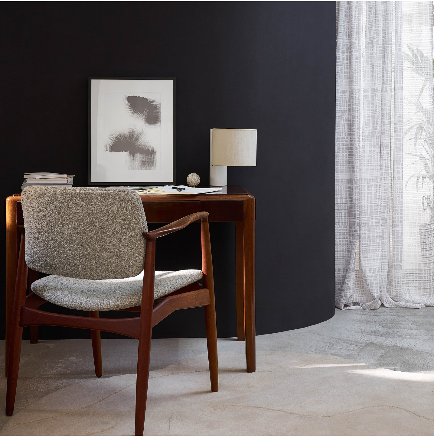
Curtain: Illusion Chair: Granit