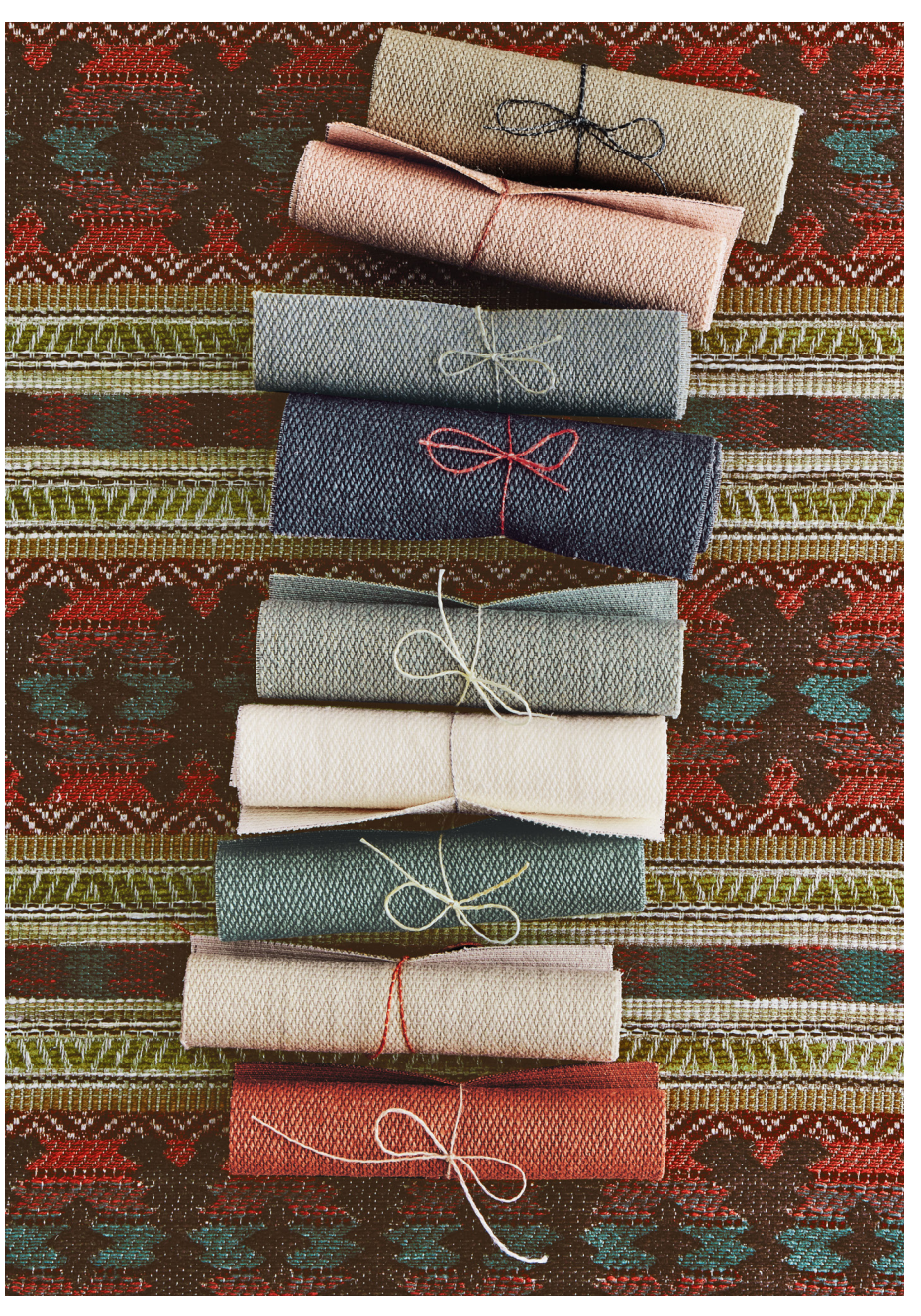
Rolled fabrics: DAVEY Background fabric: DORIAN