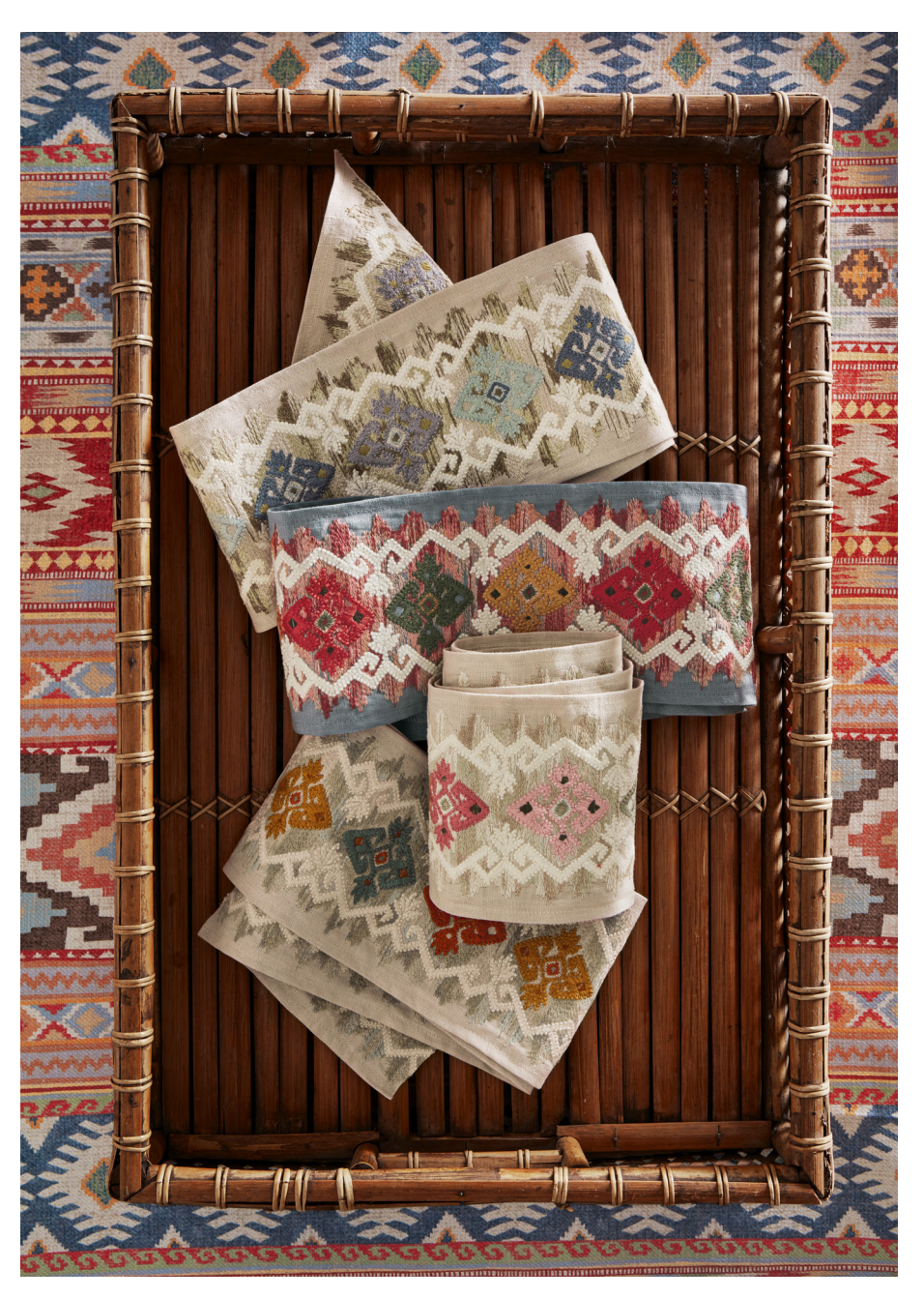
Braid: CORIN Fabric: DELGADO