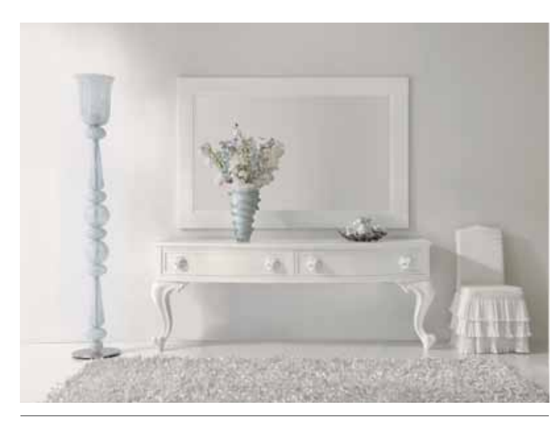
A display of endlessly refined lifestyle. Discover. Conceal. Love. Experience. Be.