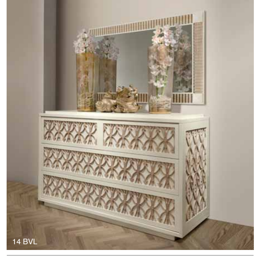
An elaborate, infinite twine streamlined by sober colours dominating the scene.