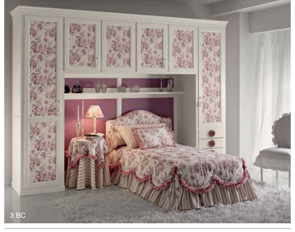
A refined elegance where delicacy combines with a quest for emotions to be shared.