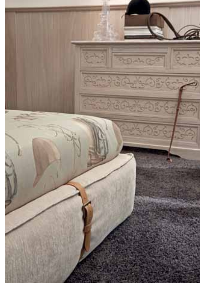
Wonderful details for a wonderful age.