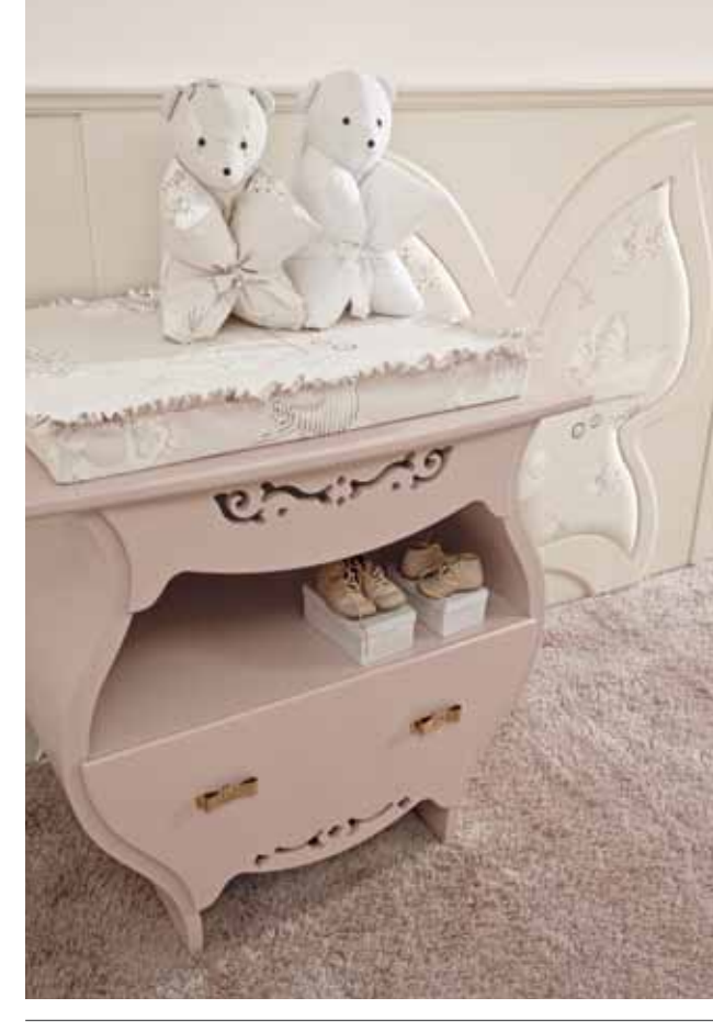
An oasis of enveloping candour, interrupted by the soft colours of happy awakening.