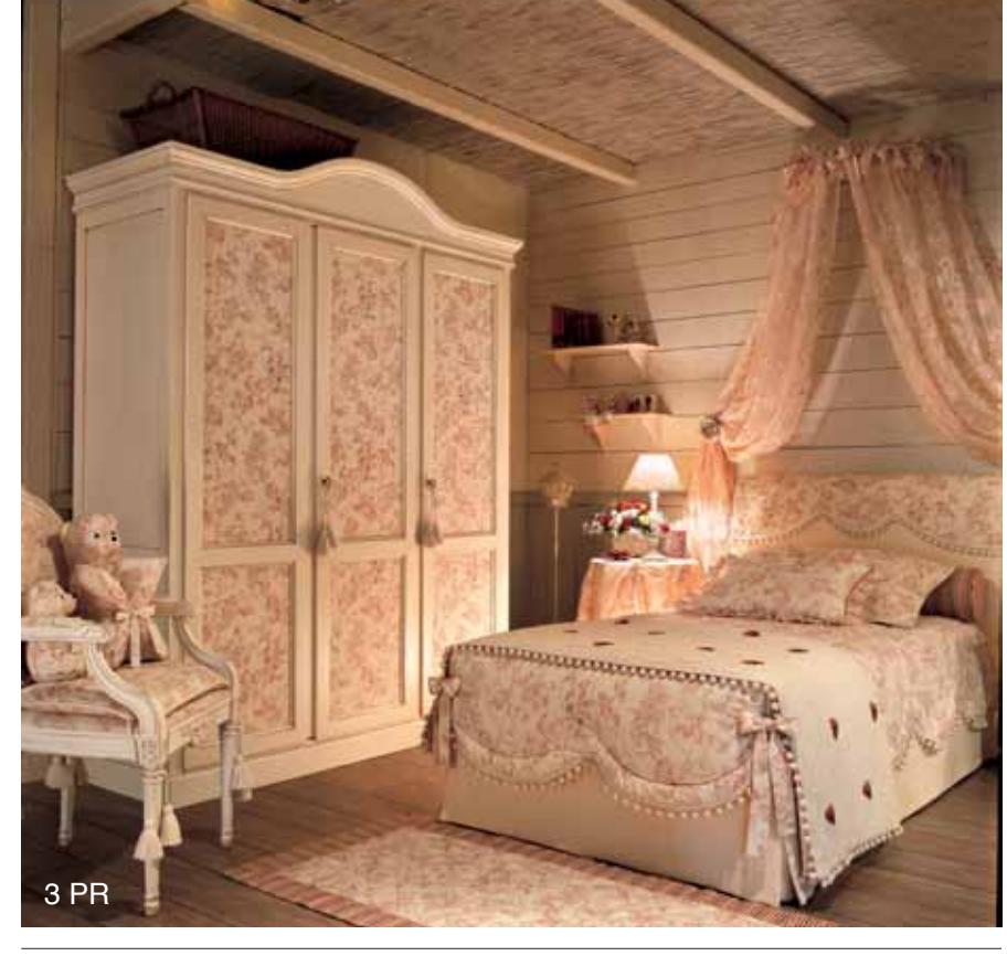
Nothing is banal; a harmonious seductive journey that is absolutely delightful.