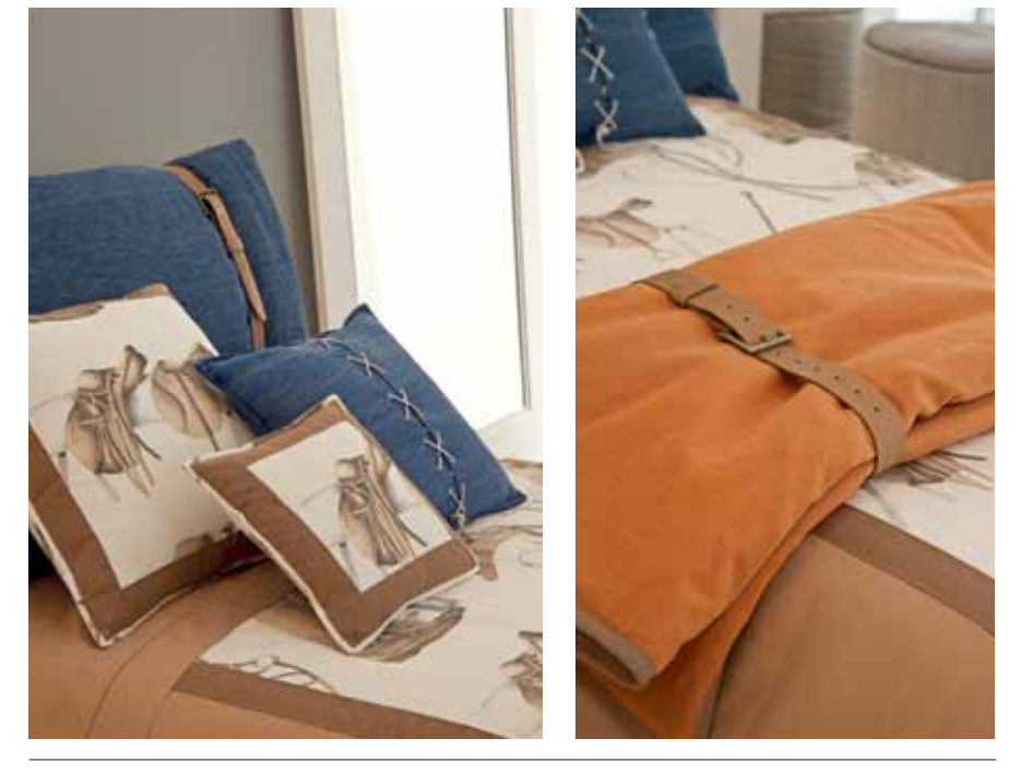
The I-boy collection is timeless style for a safe harbour in a fast-moving world.