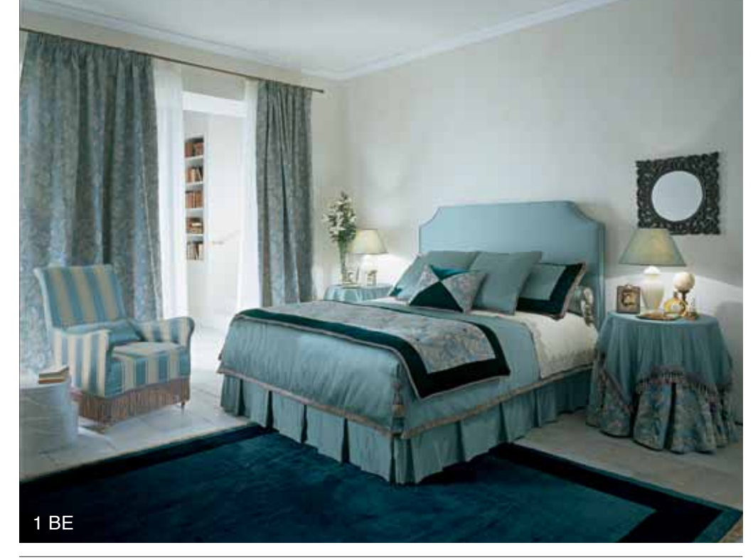
Elegance, delicacy, passion. Classic envelopes, seduces, conquers you. A journey through emotions, details and refinement. In any case beyond.