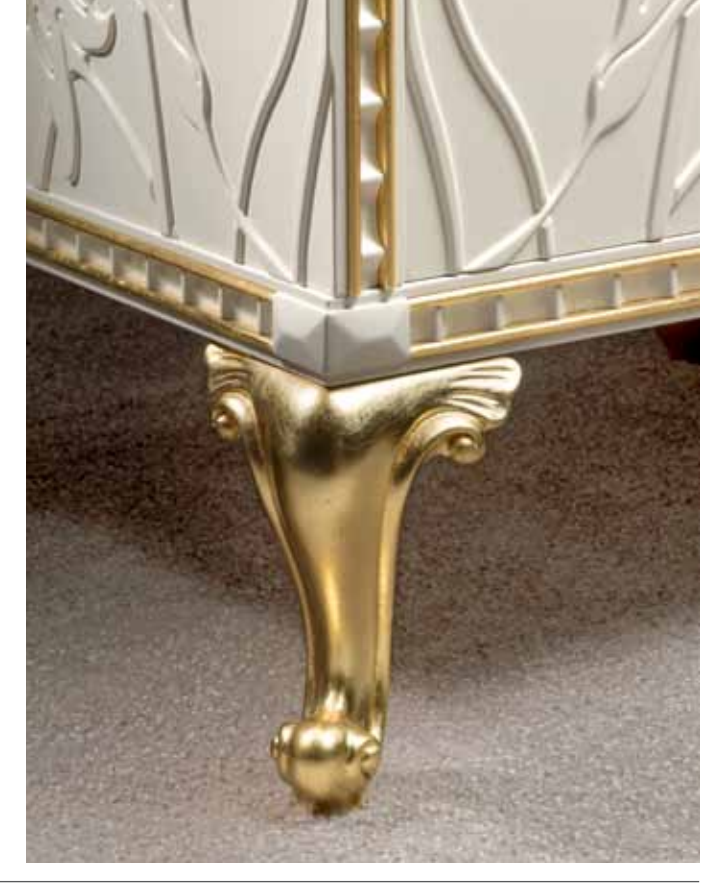
The concept of research enhanced by the original, peculiar touch that characterizes all works by Halley. Exclusively Made in Italy.