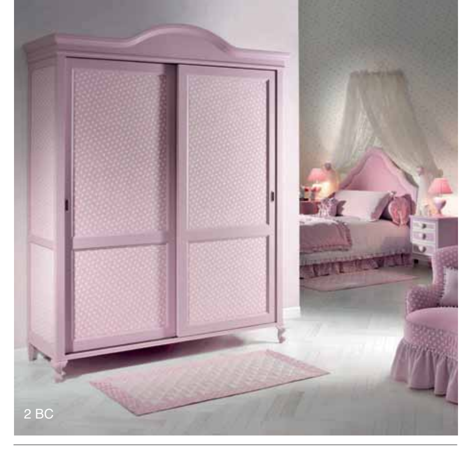
Details in play, colours in harmony.