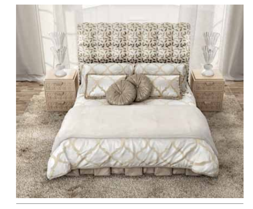
The quality is the final goal of all creations.