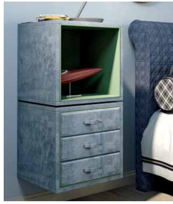
Vintage atmospheres unveil timeless elegance in any lifestyle setting.