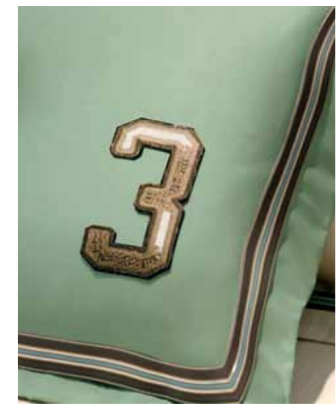
A contemporary mood revealed by timeless style.