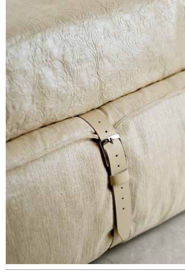
The expressive power of decorations.