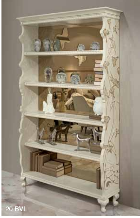
Bellavita Luxury stands out thanks to unparalleled excellence, where the central themes are charm and materials.