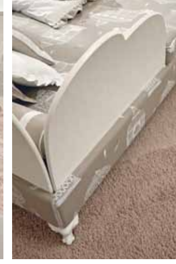
The hand that rocks the cradle is the hand that rules the world.