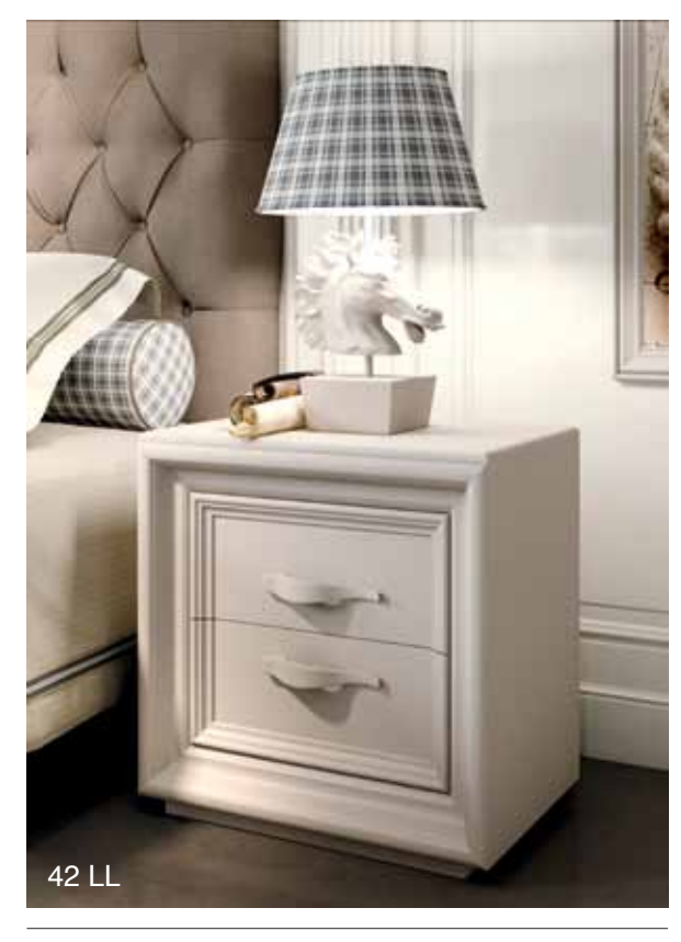
The furniture becomes language to express prestige and luxury.