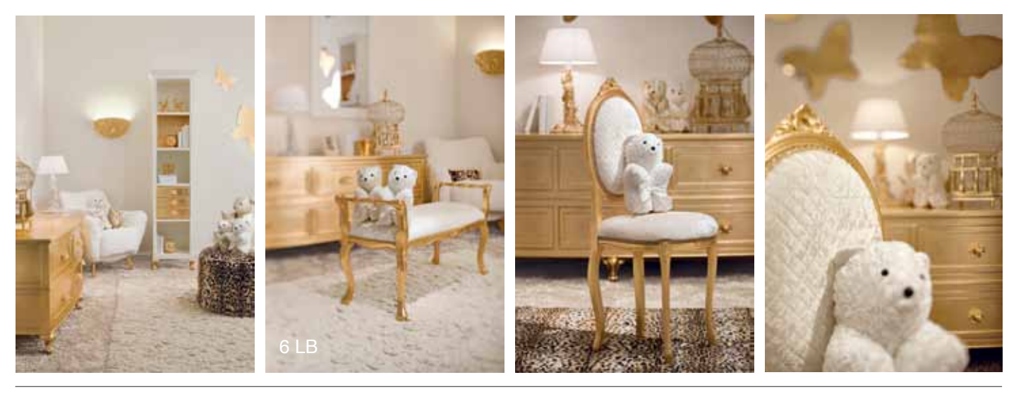
We love and protect everything that is small and vulnerable, in this way preserving intact the hidden traits of the child in us.