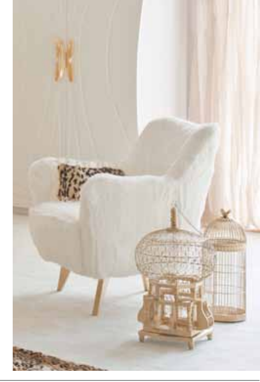
Transparency and reflections, a cosy nest, a luminous blanket of the morning's faint light.