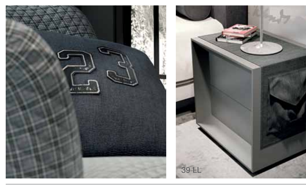
Contemporary hues accent spaces where geometric features and precious finishes weave together.