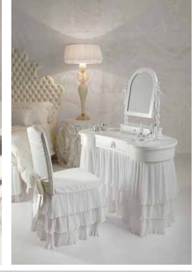
Refinement and innovation, passion and desire.