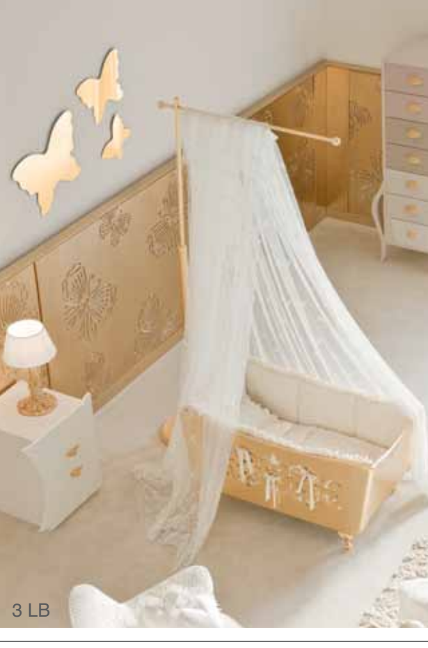
This child's bedroom becomes a jewel box that guards and protects the space for dreams and awakening.