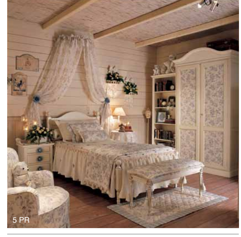
Love of details, composite refinement, and a gentle touch. Provence, shared emotions.