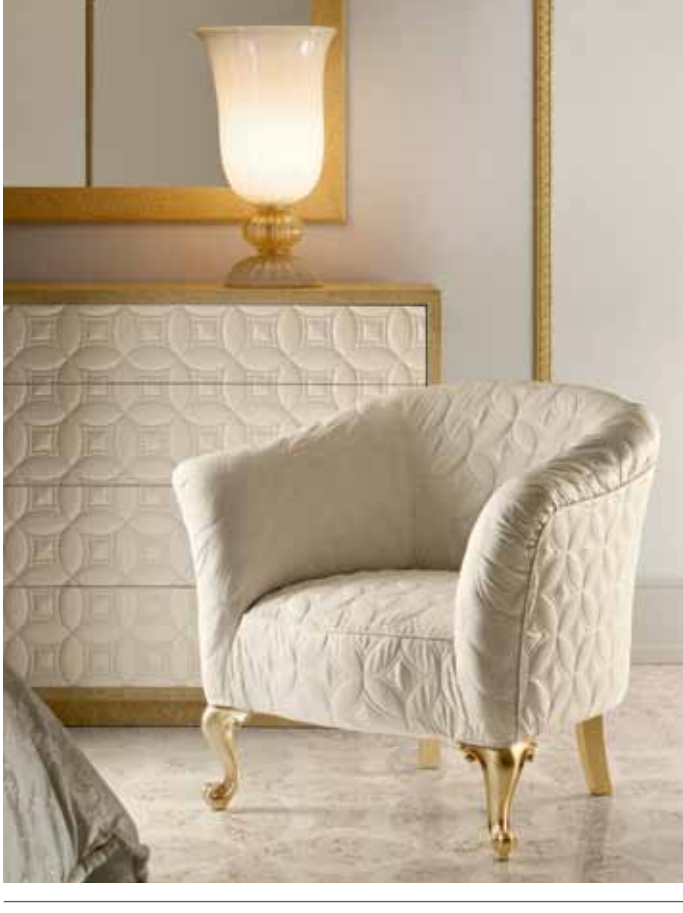
The furniture becomes language to express prestige and luxury.