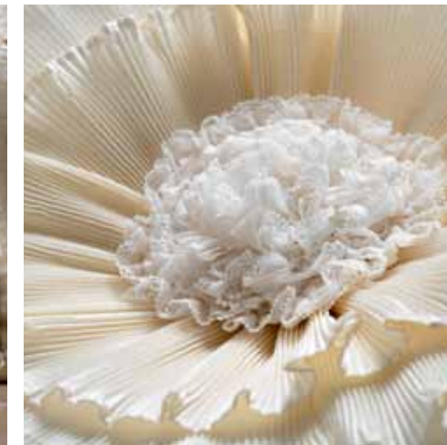
Sartorial details describe the essence of comfort.