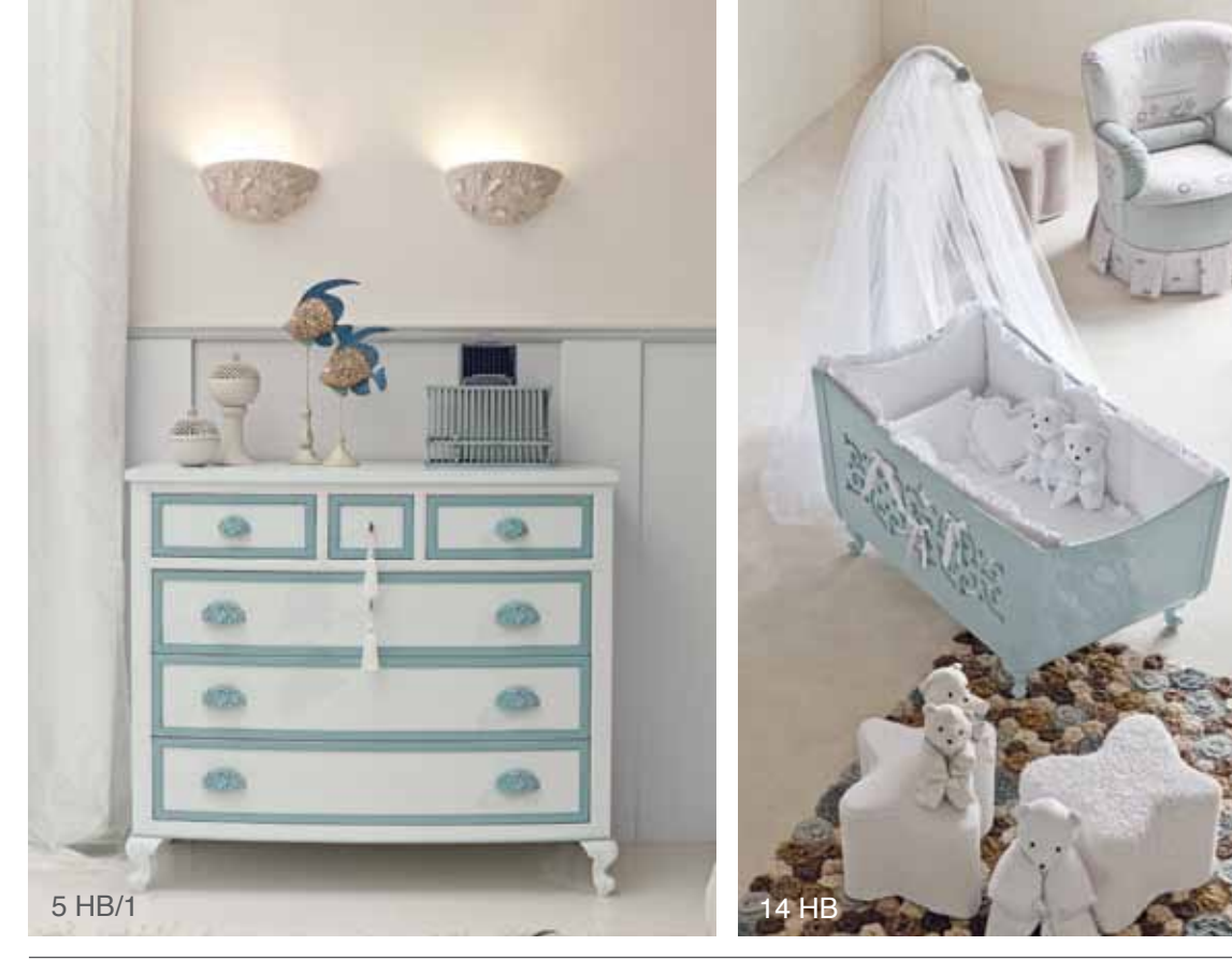
Perfect happiness is in the crib of a baby born of love.