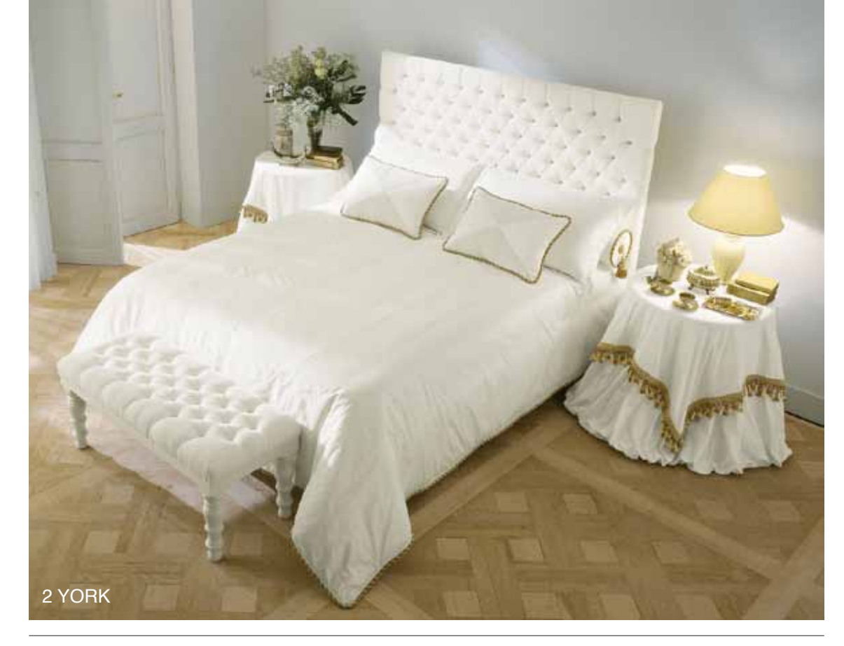
An exclusive model re-interpreted to my desires.