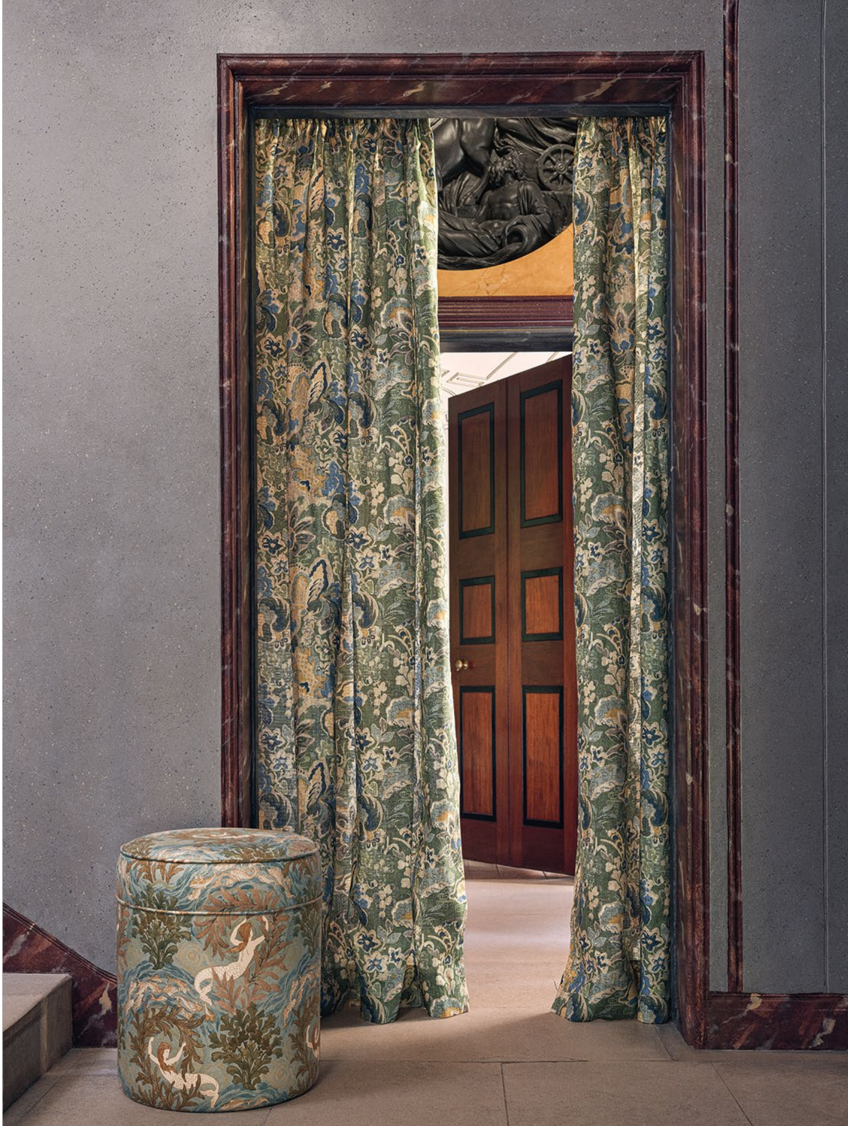
FOLKLORE A stunning conversational design, printed on linen satin, depicting Odyssean mermaids swimming gracefully amongst coral reefs.