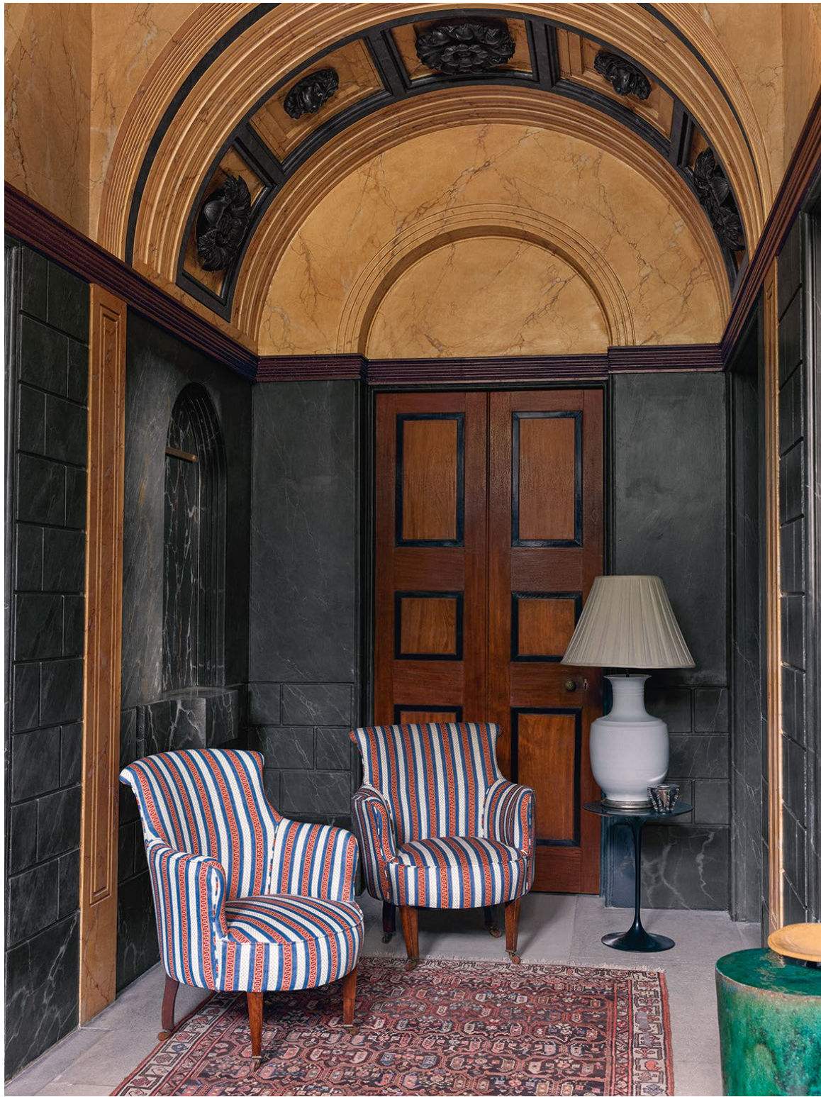
CARNIVAL STRIPE This dynamic print is inspired by the hand-painted motifs used to decorate the tents and trailers of travelling performers.