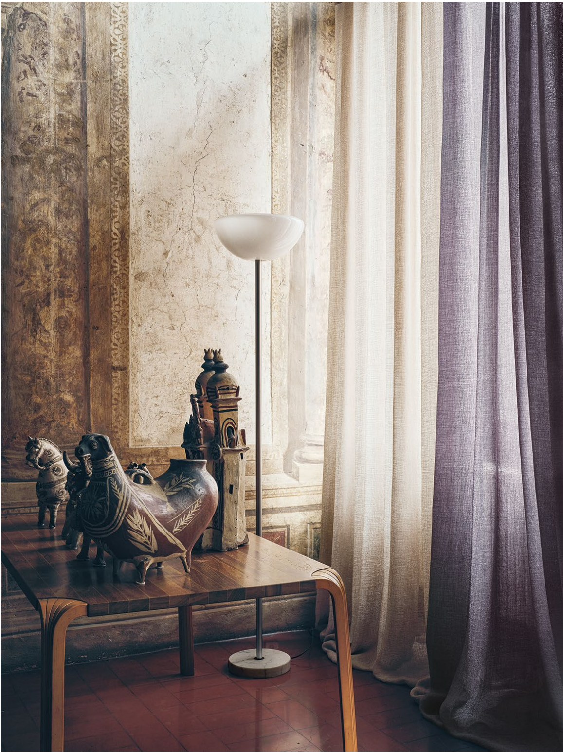
ZOE RE Both front and back of this translucent fabric boast different color nuances to create a delicate watercolor effect.