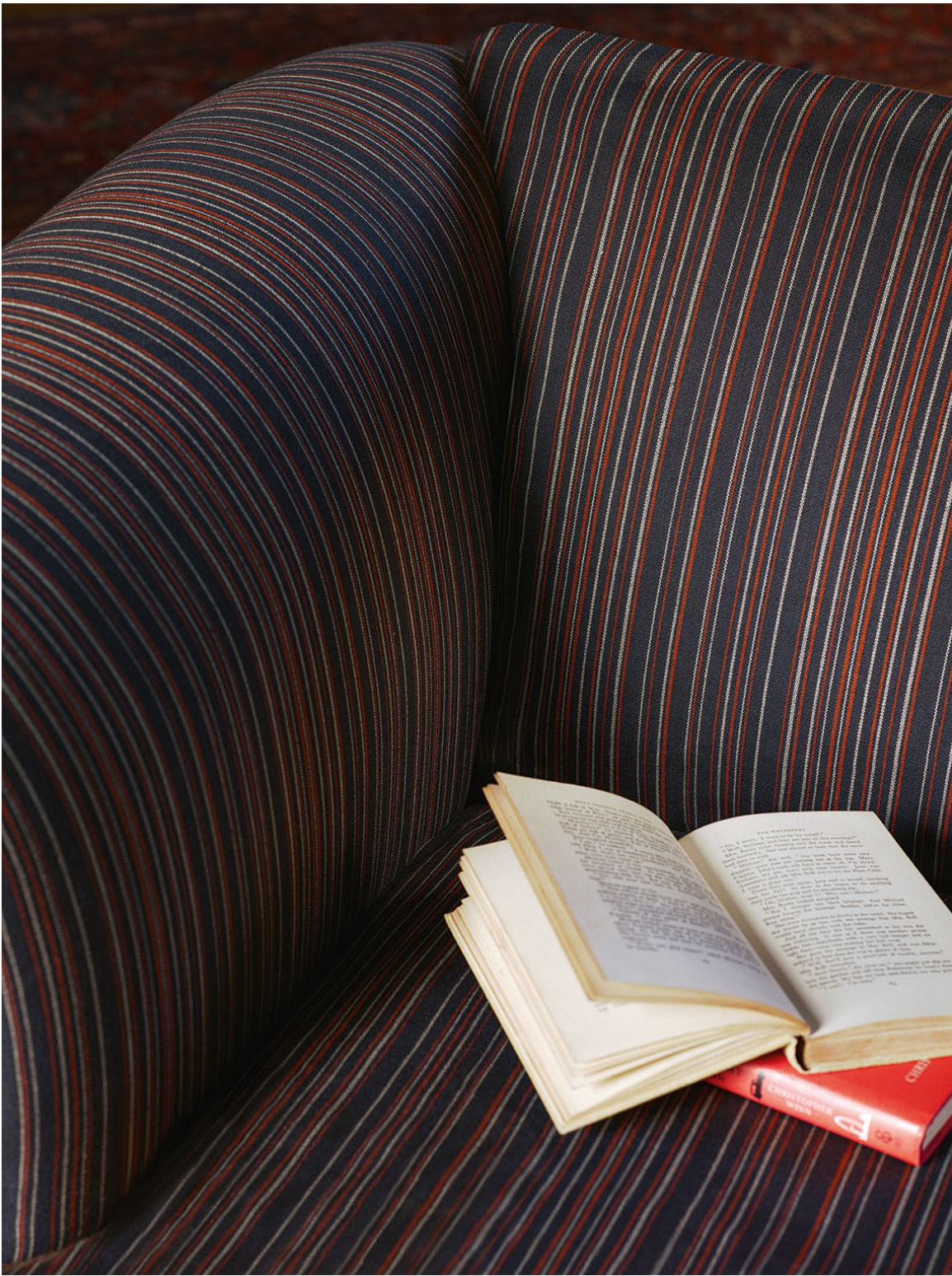
PARADE STRIPE Small-scale ribbons of color ripple across this dual purpose fabric, which is available in six clear color stories.