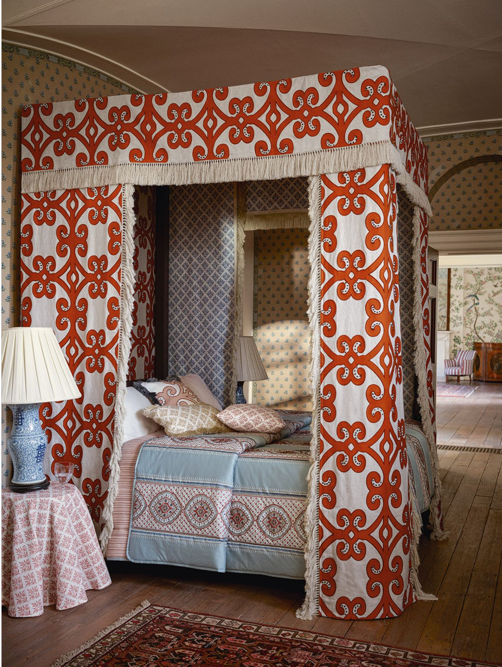
ANNA Inspired by the decadent costumes worn by ballerina Anna Pavlova, this multifaceted embroidery on cotton perfectly balances matte and lustre.