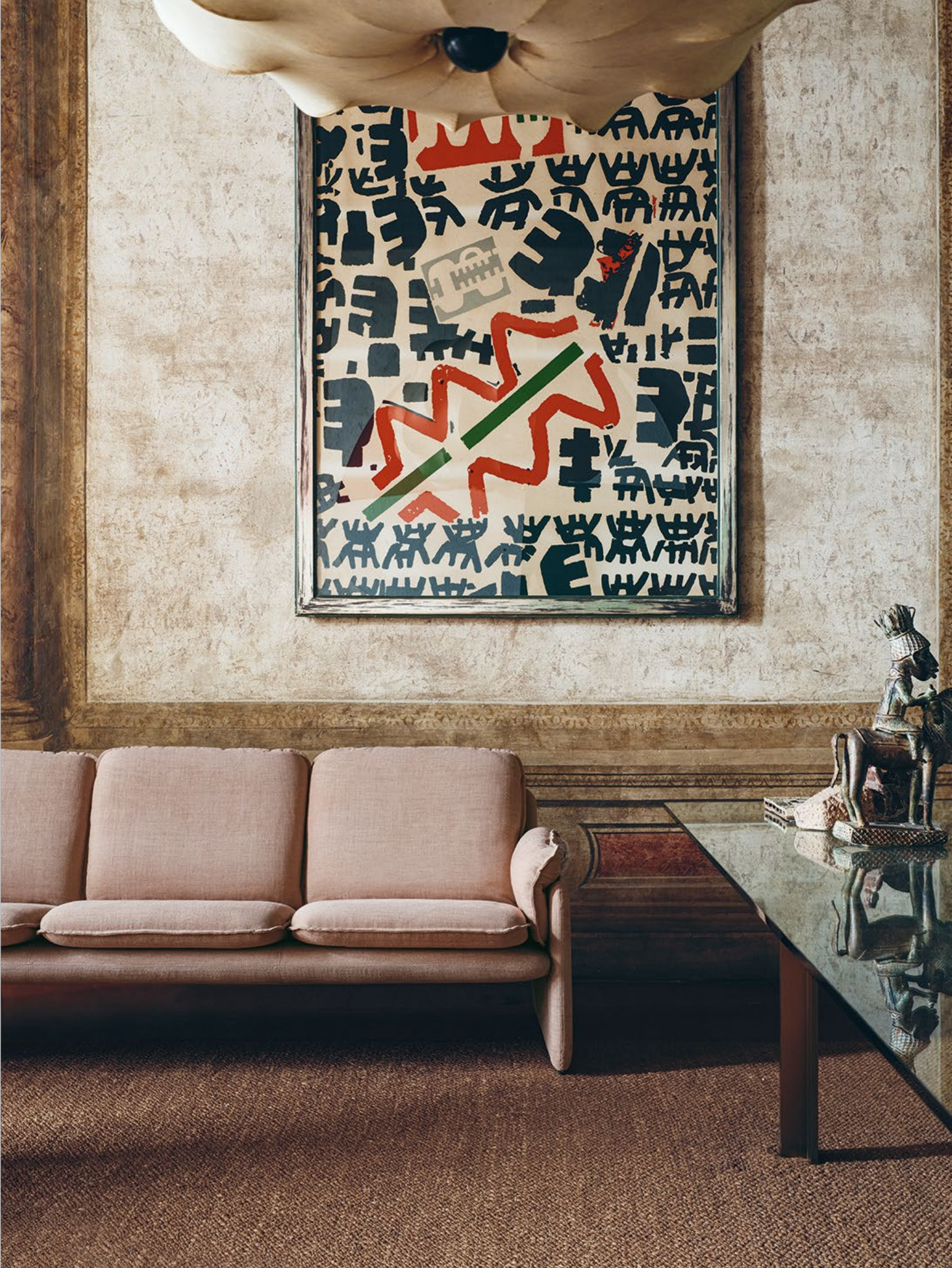
ELIAN This laid-back upholstery fabric boasts a natural look teamed with a rich color palette.