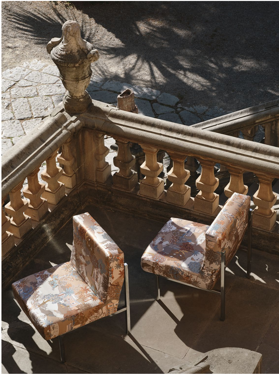
FONTANA PRETORIA The mosaics of the baroque cathedral of Monreale in Sicily served as the inspiration for this artistic embroidery on elegant cotton base.