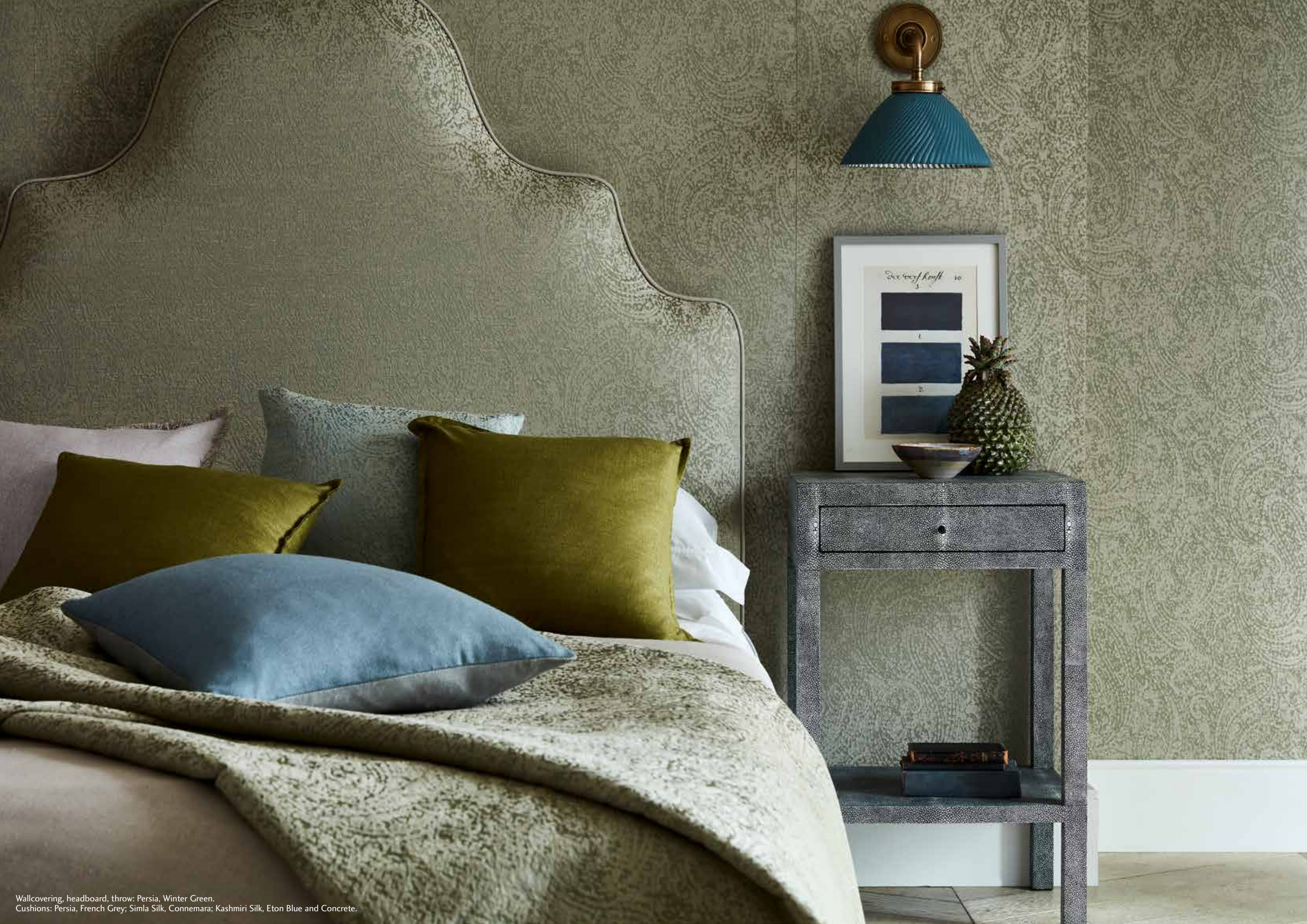
Wallcovering, headboard, throw: Persia, Winter Green. Cushions: Persia, French Grey; Simla Silk, Connemara; Kashmiri Silk, Eton Blue and Concrete.