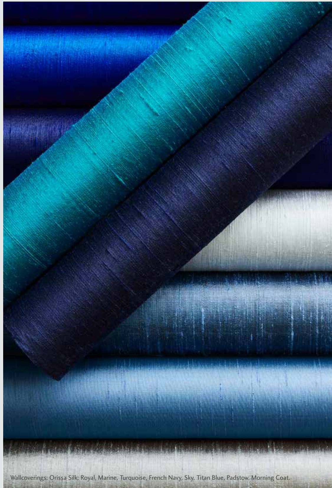
Wallcoverings: Orissa Silk; Royal, Marine, Turquoise, French Navy, Sky, Titan Blue, Padstow, Morning Coat.