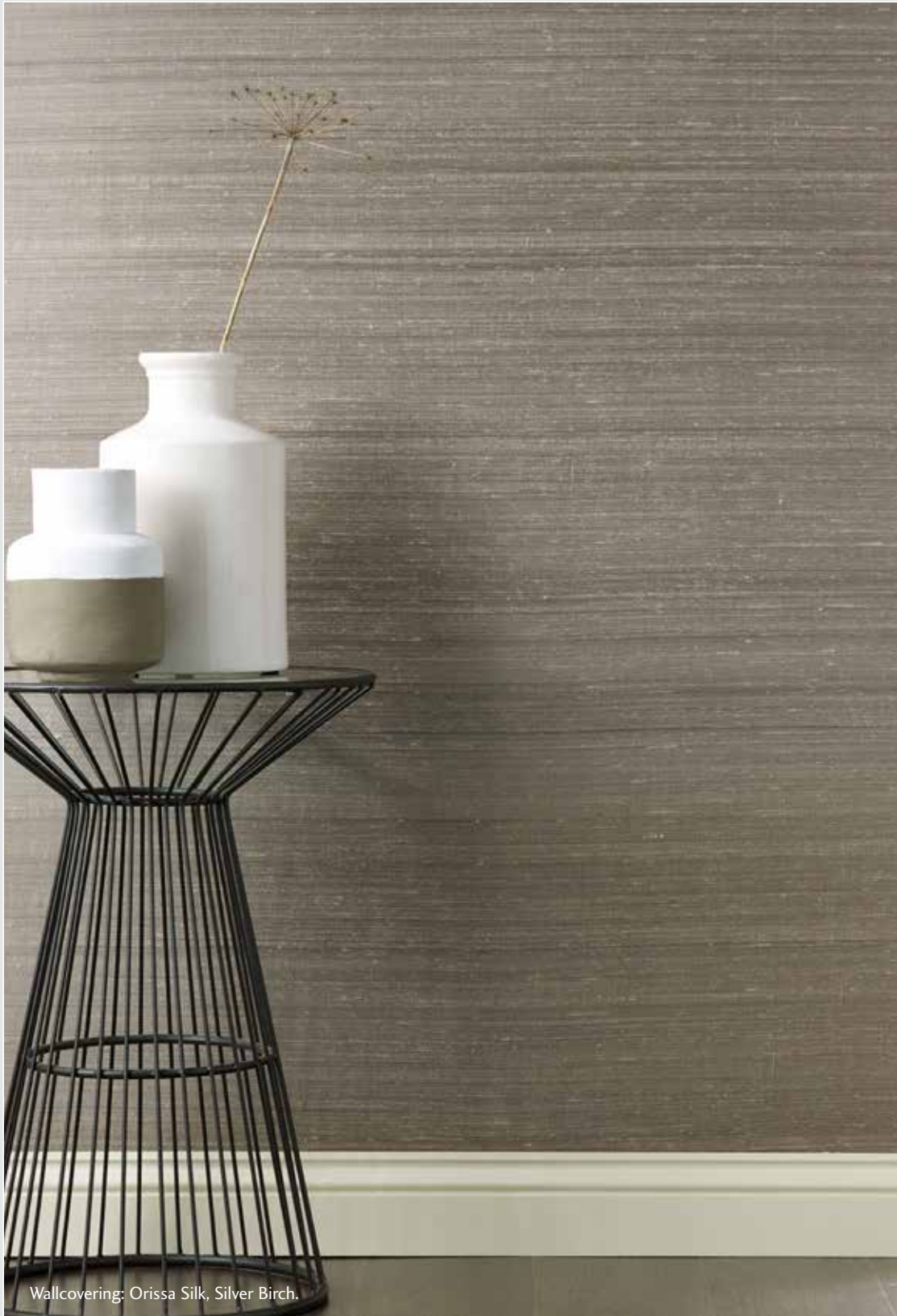
Wallcovering: Orissa Silk, Silver Birch.