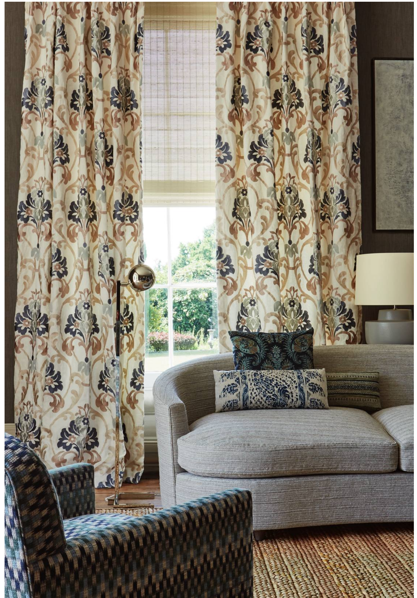
Curtains: Lombard Sofa: Quinton Cushions on sofa (left to right): Esta, Burdett, Carey Chair: Wyatt