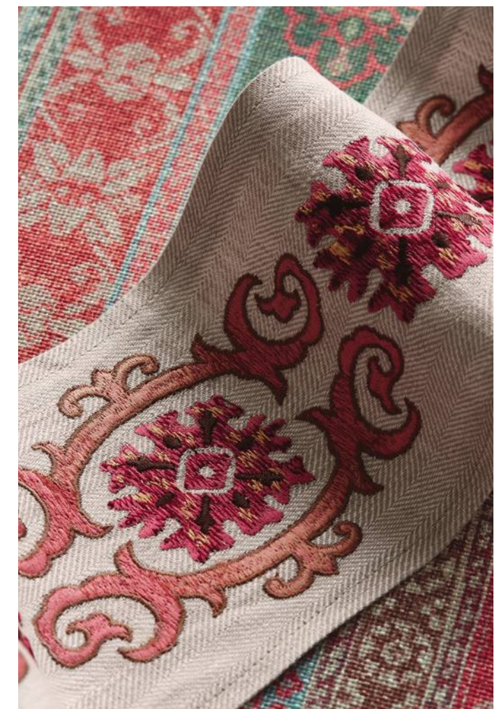
Top left: Braids: Florette