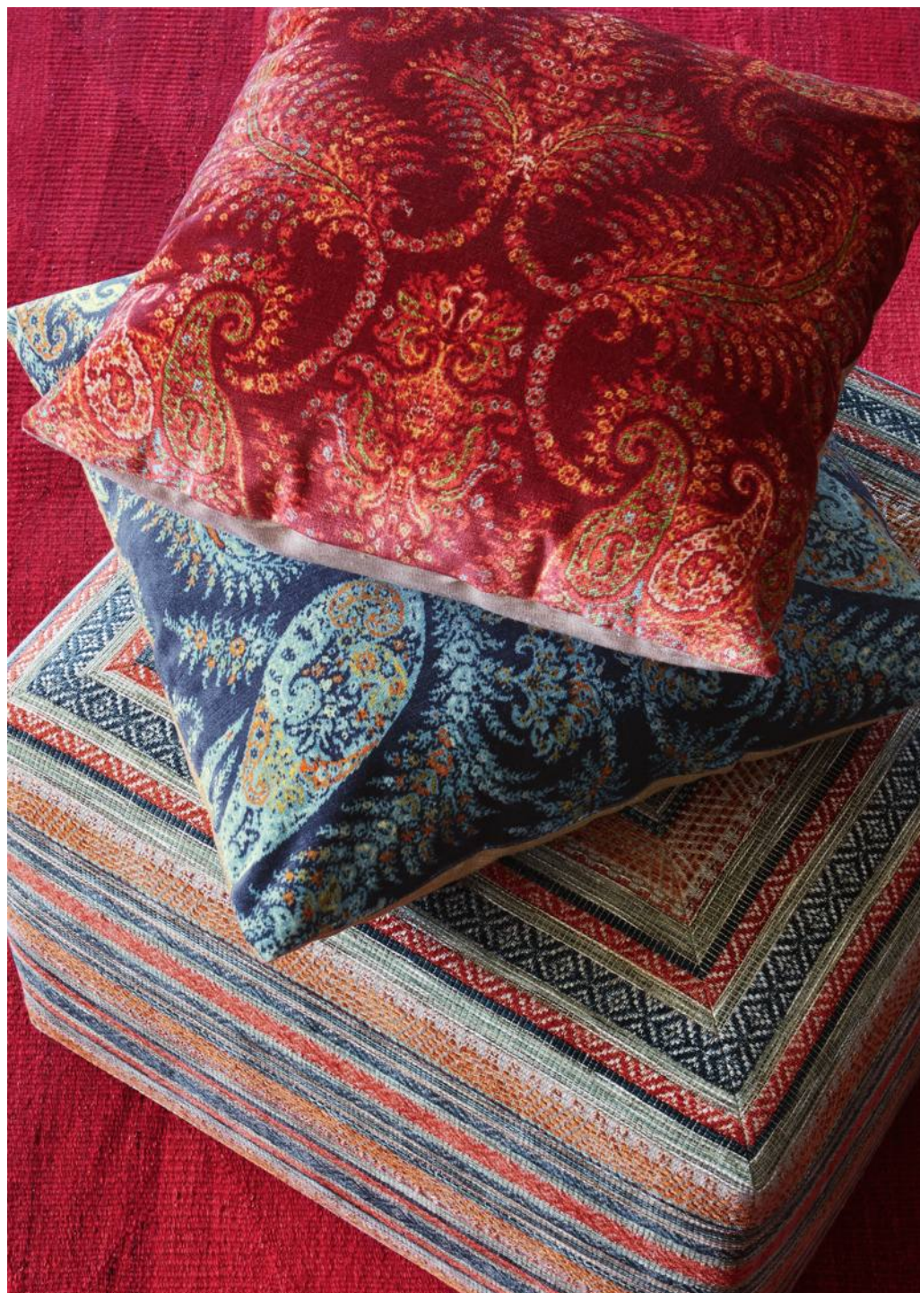
Cushions: Burdett Cube: Carey