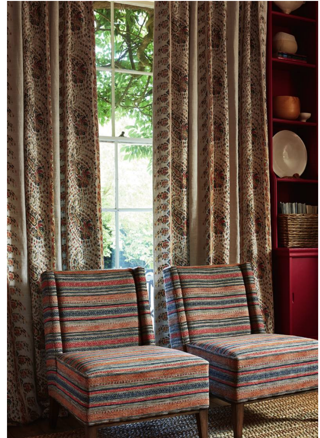
Curtains: Esta Chairs: Carey