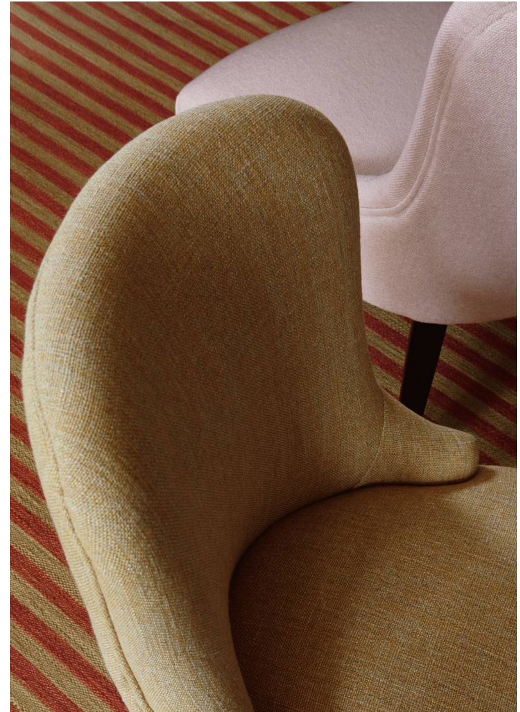
Chairs (from top): Tyndall, Conway