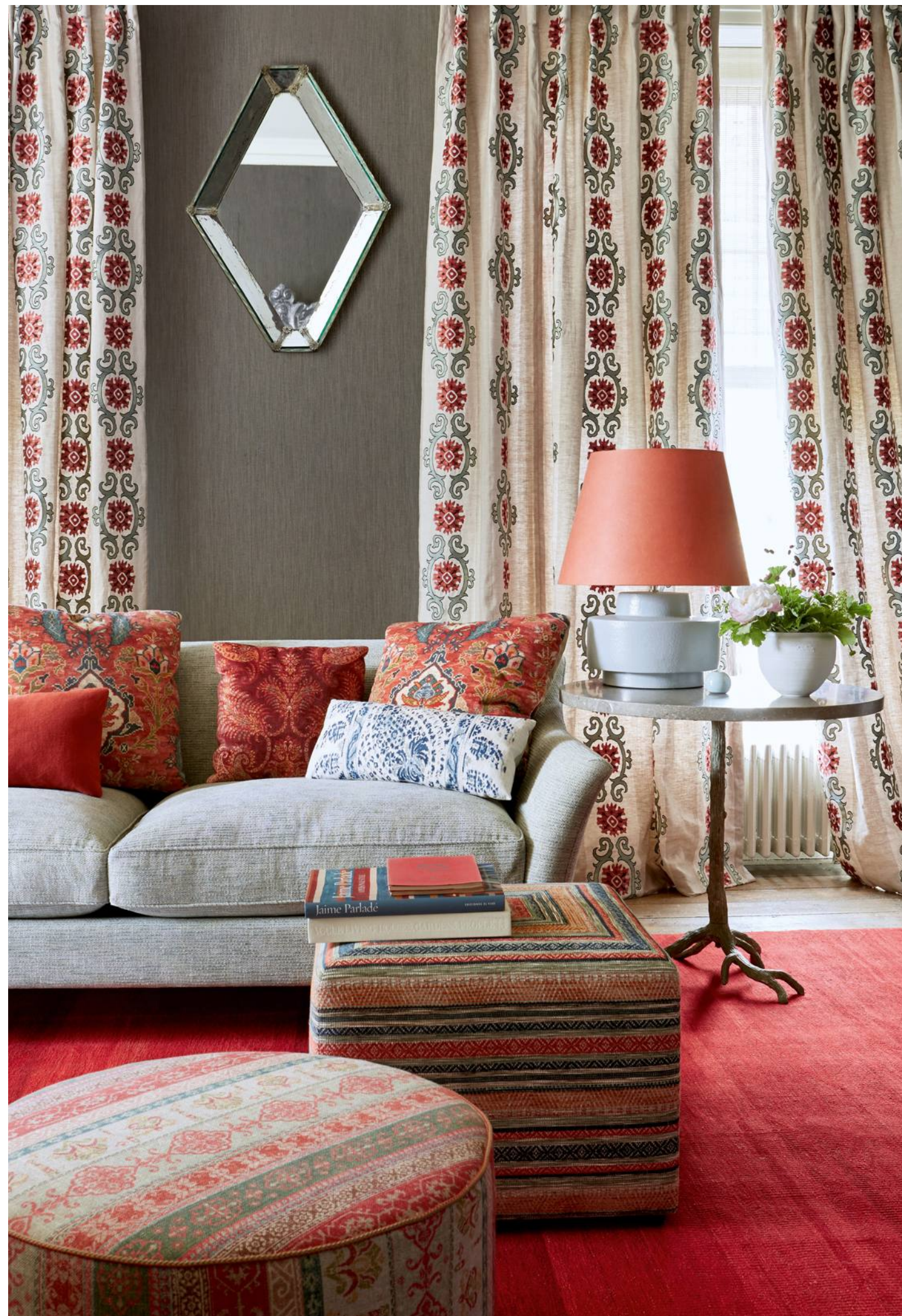
Curtains: Theodore Sofa: Brandon Cushions on sofa: (left, from rear) Floriana Velvet, Foss (centre) Burdett (right, from rear) Floriana Velvet, Esta Cube: Carey Round stool: Kempsey