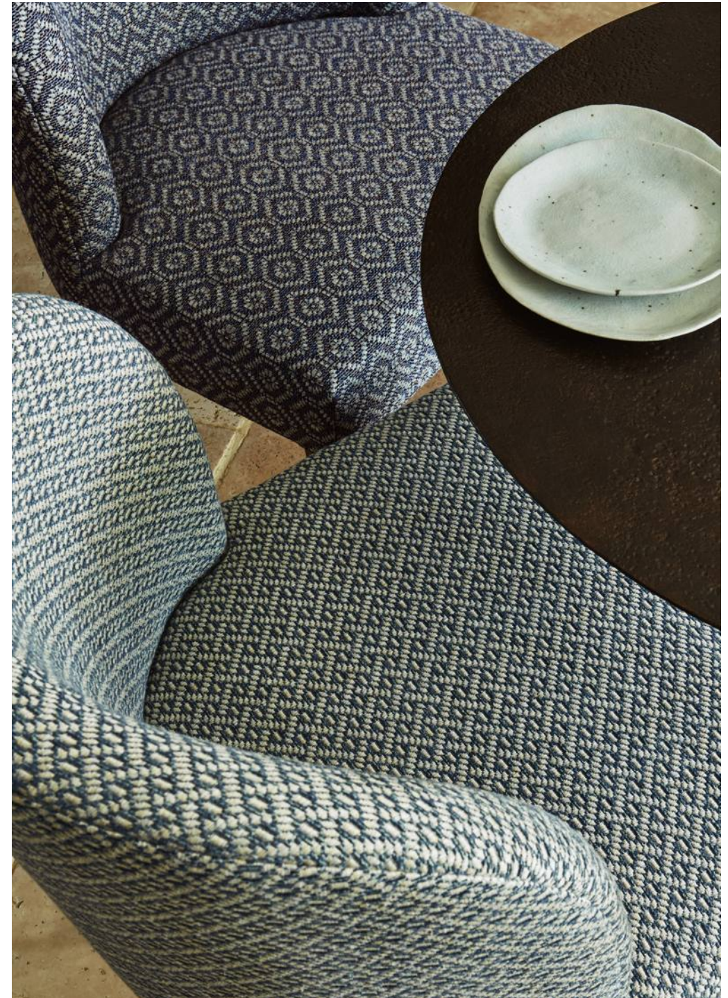
Chairs (from top): Arran, Kinsford