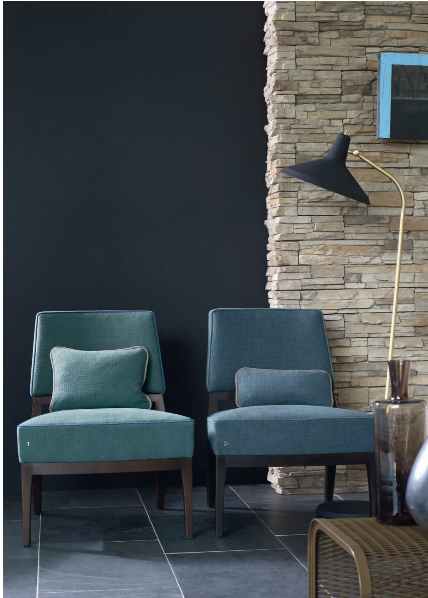
1 Cover 568 | 2 Cover 558