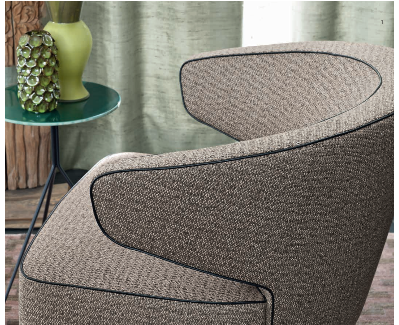
1 Monsoon 675 | 2 Tate 888