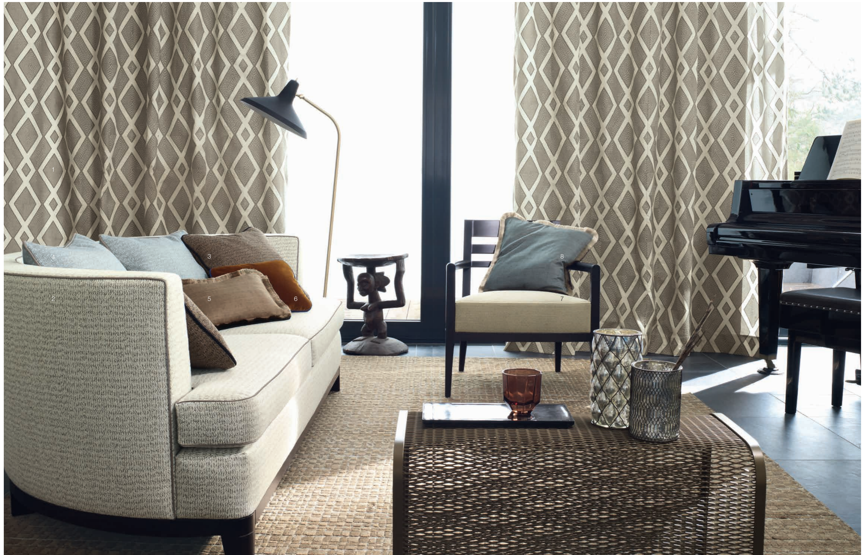
1 Diary 874 | 2 Tate 981 | 3 Tate 888 | 4 Tate 694 | 5 Monsoon 888 | 6 Infinity Plus 187 | 7 Cover 794 | 8 Monsoon 567