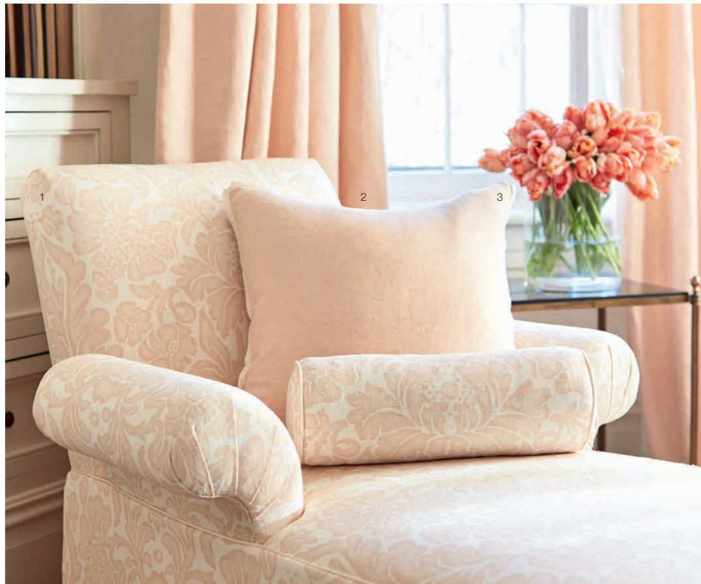
1 Colton Floral 492 | 2 Finley 442 | 3 Finley 442