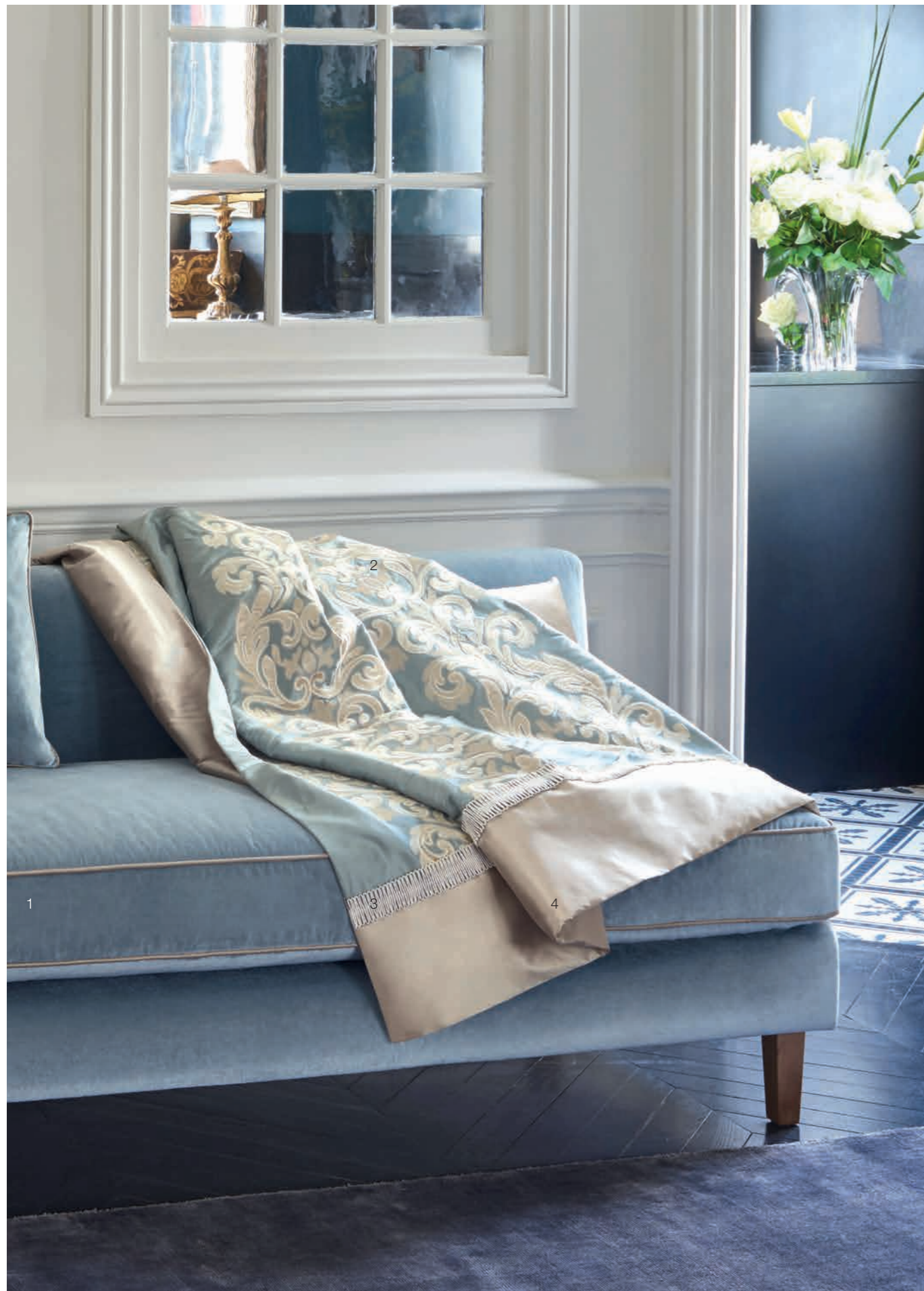
1 Gattopardo 593 | 2 Gala 684 | 3 Swinging 980 | 4 Colibri 983