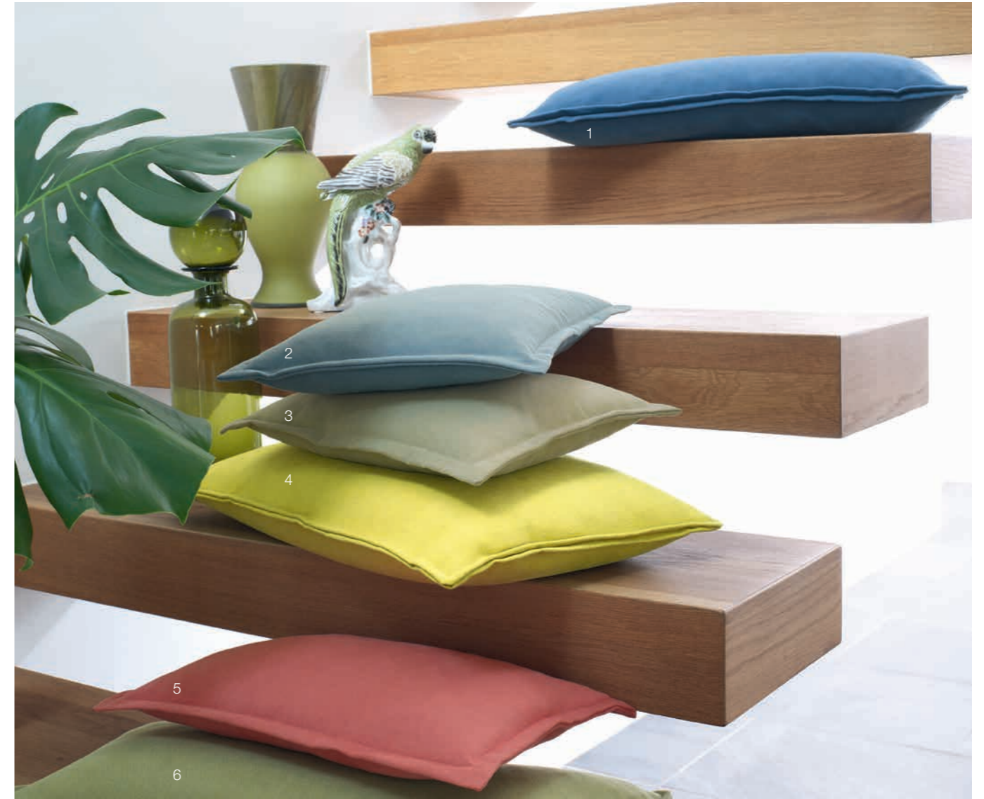
1 Luna 567 | 2 Luna 596 | 3 Luna 714 | 4 Luna 174 | 5 Luna 344 | 6 Luna 716