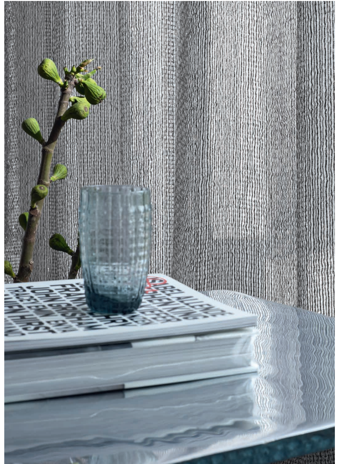
1 Noell 986