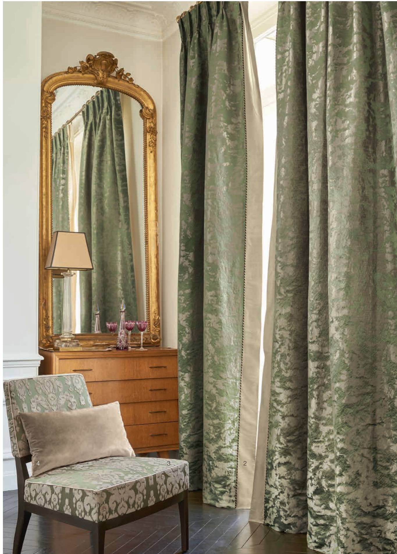
1 Amarcord 786 | 2 Colibri 874 | 3 Fellini 786 | 4 Desir 882