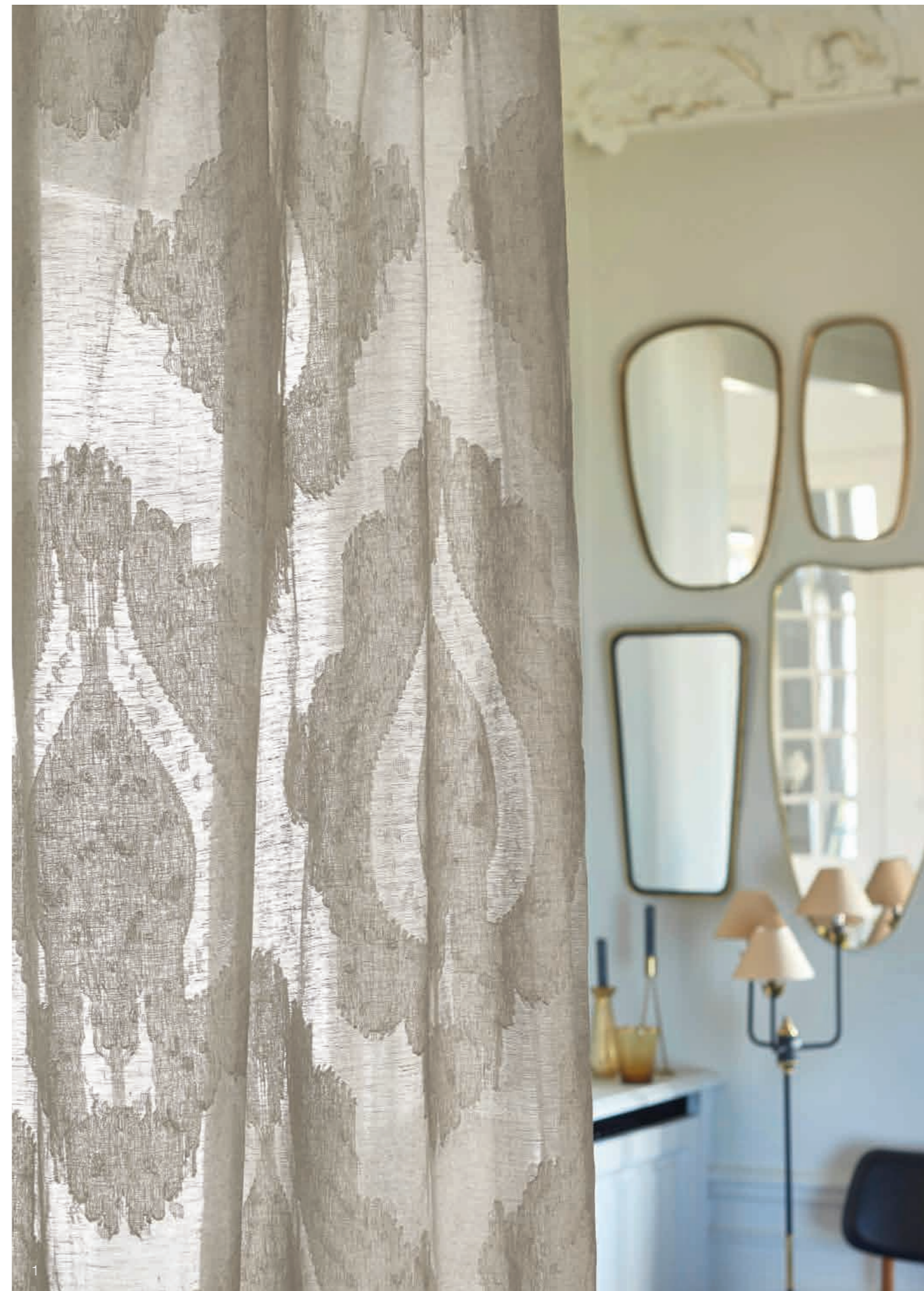
1 Intervista 994