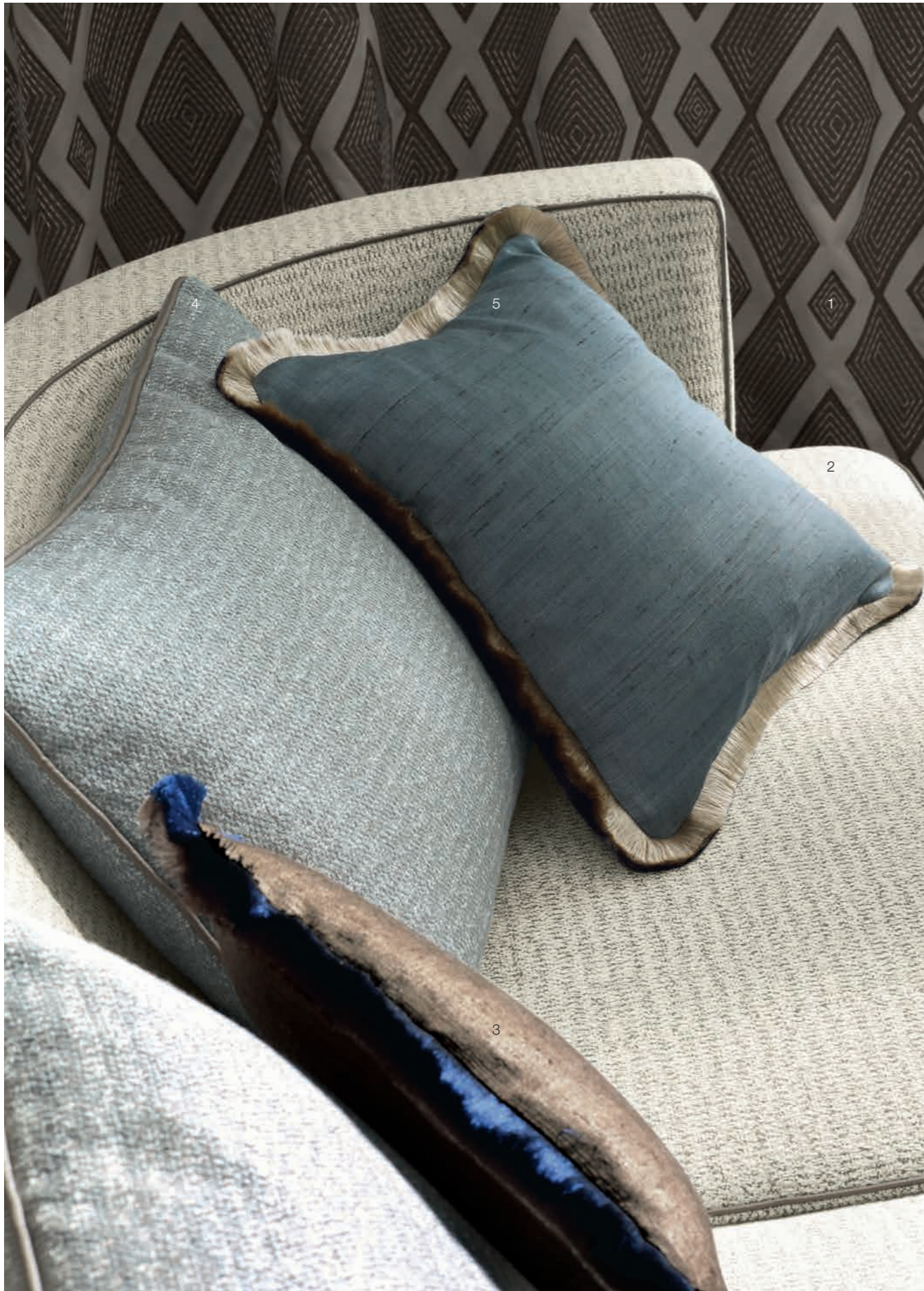
1 Diary 874 | 2 Tate 981 | 3 Monsoon 888 | 4 Tate 694 | 5 Monsoon 567