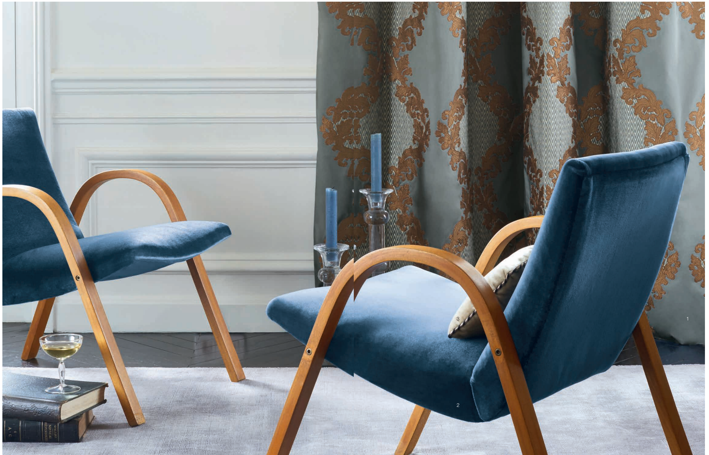
1 Cardinale 586 | 2 Gattopardo 555 | 3 Gattopardo 813