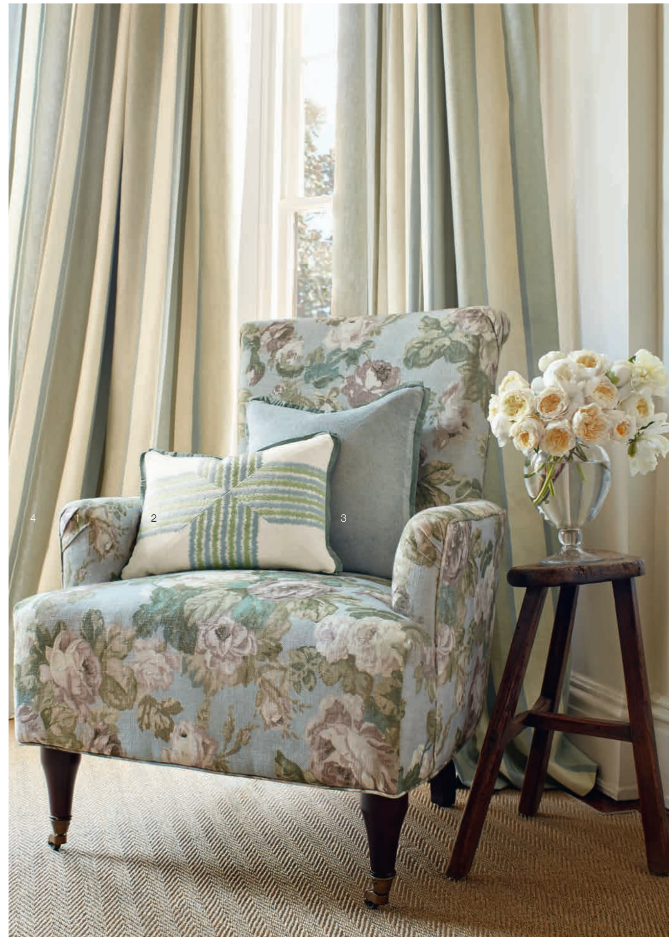
1 Rosemoor Garden 754 | 2 Surrey Stripe 672 | 3 Fenton Chenille 684 | 4 Derby Stripe 672