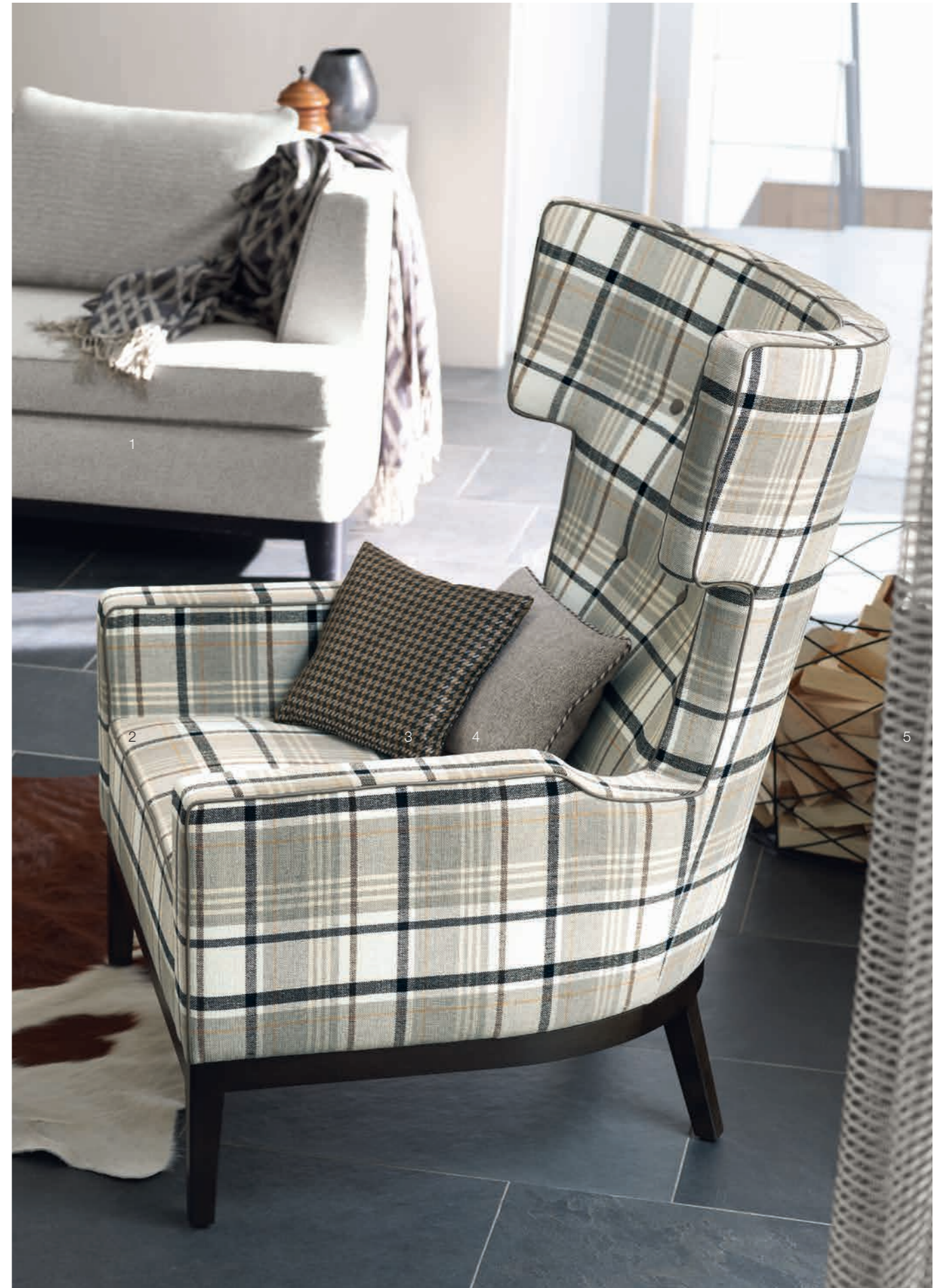
1 Pogo 991 | 2 Paros 993 | 3 Pepito 897 | 4 Pogo 995 | 5 Lace 894