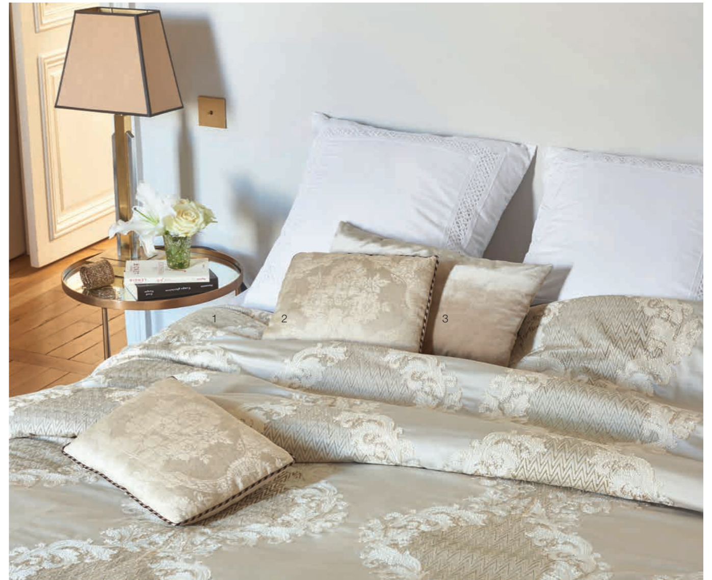
1 Cardinale 982 | 2 Anouk 993 | 3 Desir 882