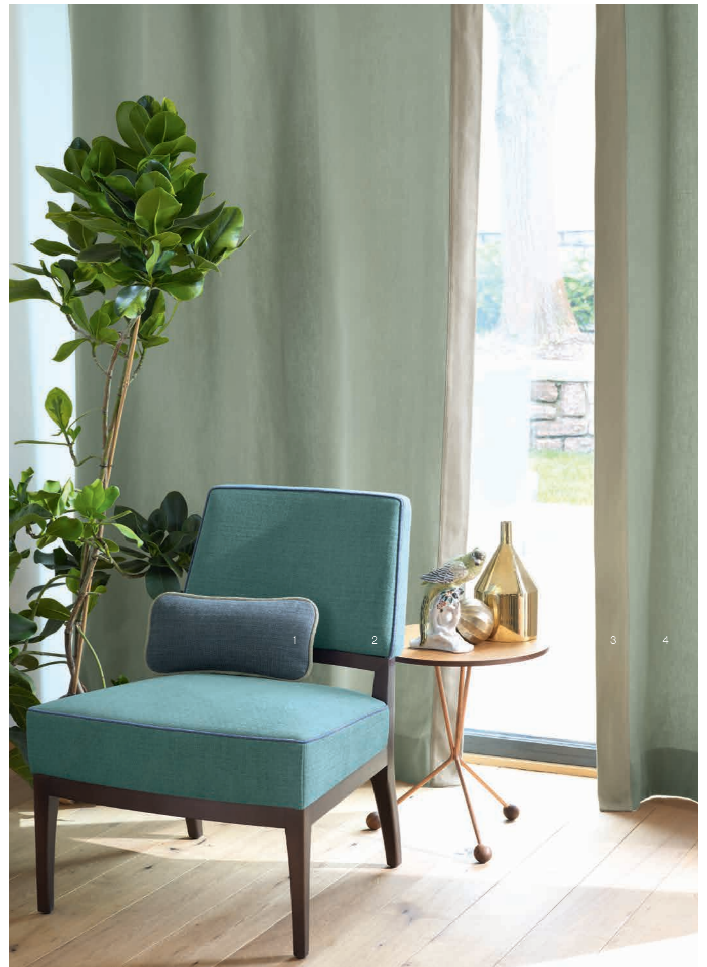
1 Cover 558 | 2 Cover 568 | 3 Luna 884 | 4 Luna 785