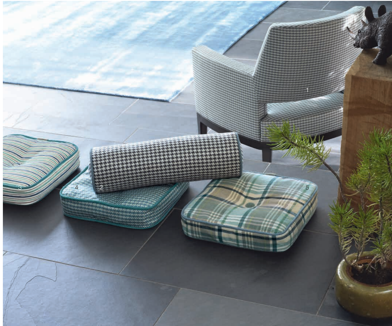
1 Pepito 685 | 2 Pepito 954 | 3 Pepe 653 | 4 Pepito 654 | 5 Paros 683