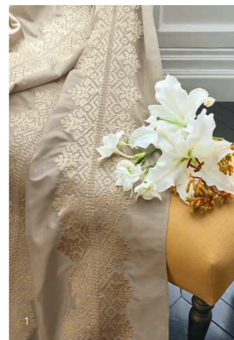
1 Bellissima 861