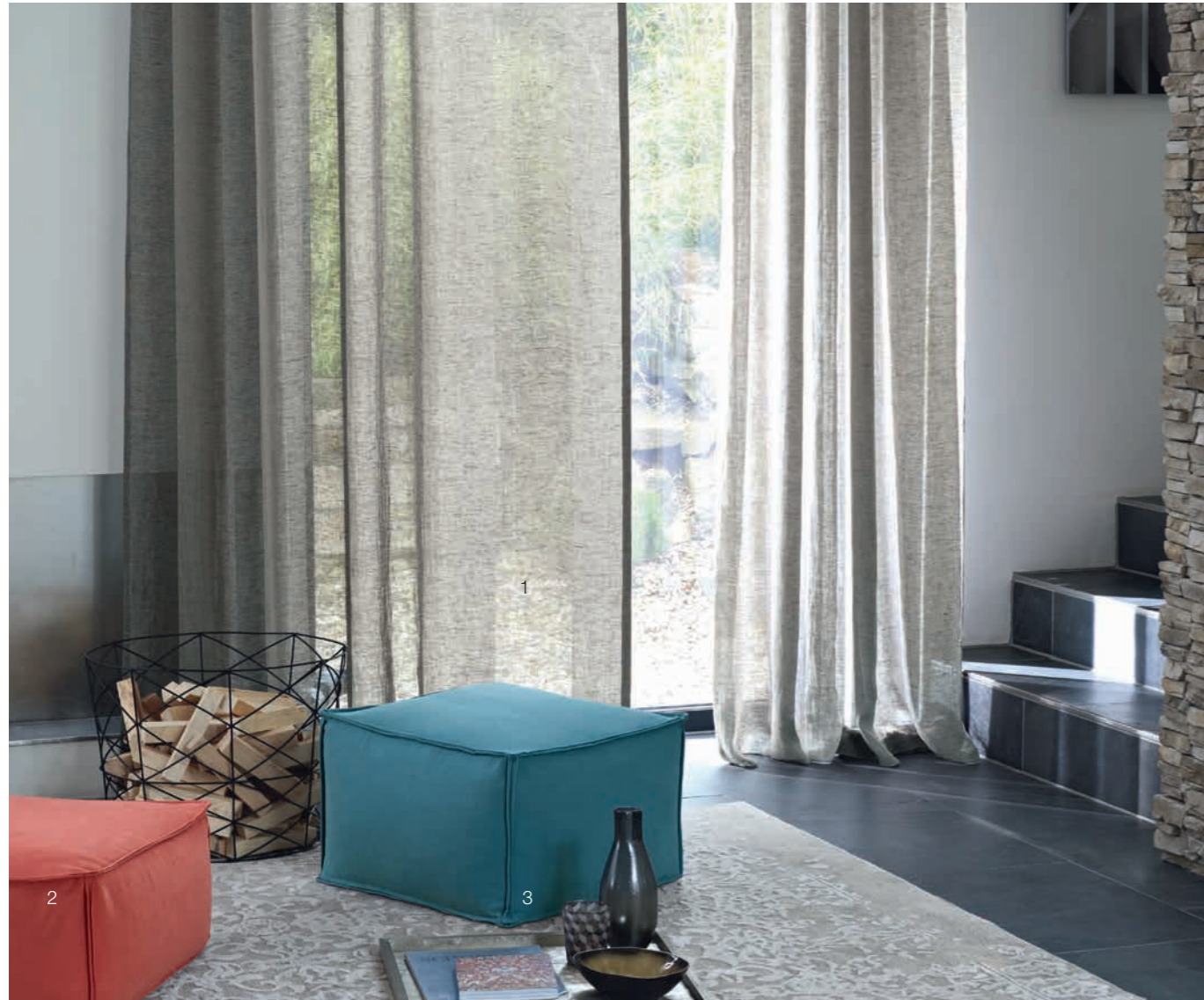
1 Ellis 998 | 2 Luna 344 | 3 Luna 666