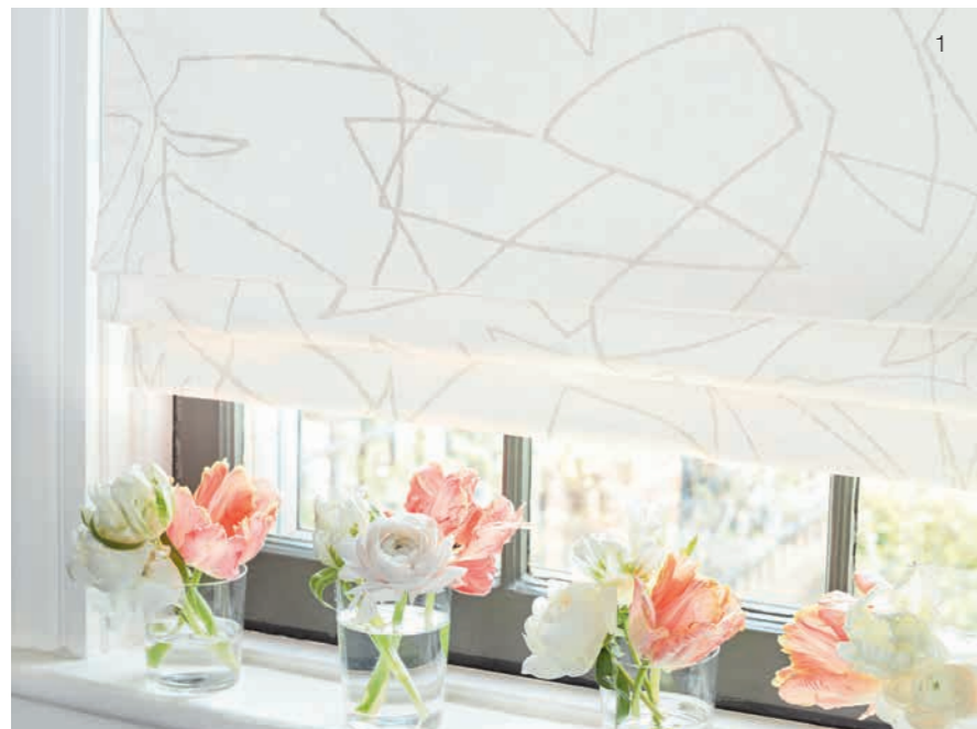
1 Callan Jacquard 982