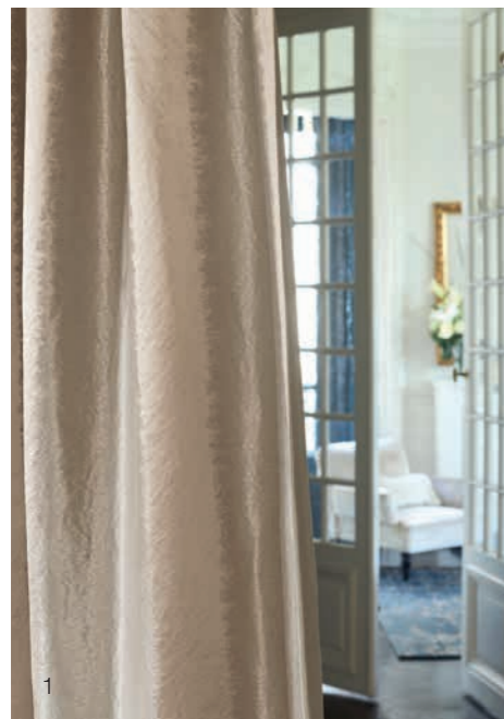
1 Set 494