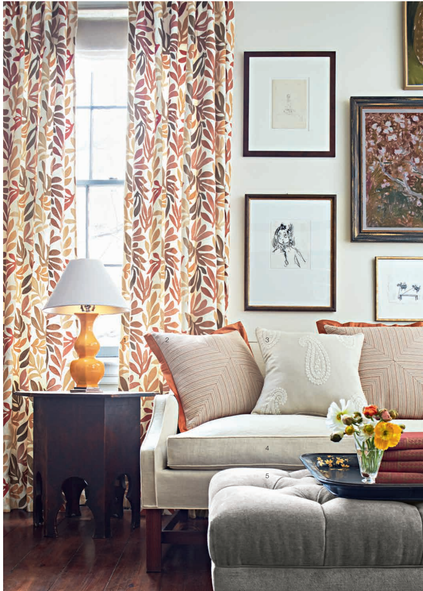
1 Cutouts 234 | 2 Landon Stripe 283 | 3 Addison Paisley 891 | 4 Finley 992 | 5 Fenton Chenille 995