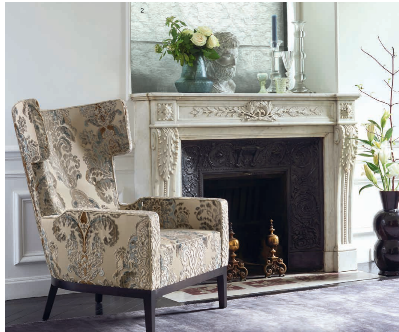
1 Casanova 854 | 2 Anouk 665