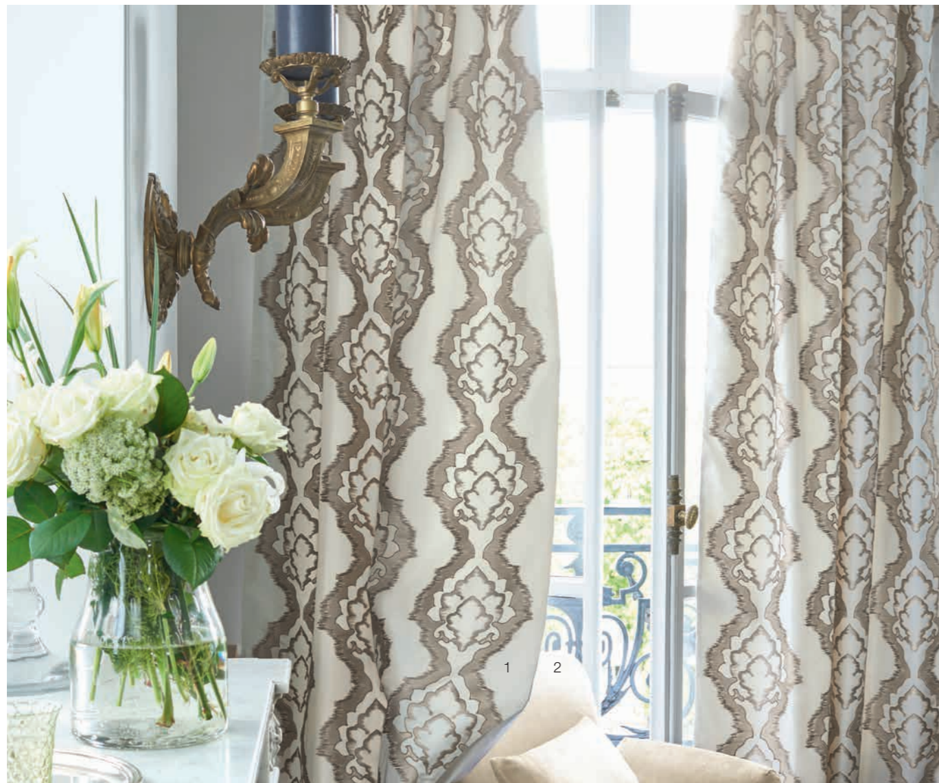
1 Cinema 993 | 2 Gattopardo 813