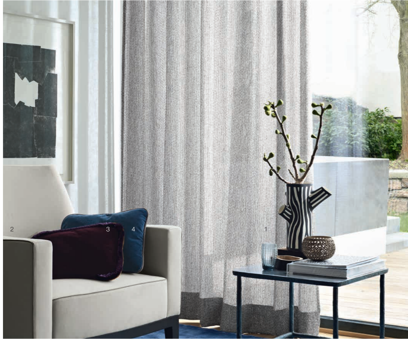
1 Noell 986 | 2 Luna 882 | 3 Saga 347 | 4 Infinity Plus 556