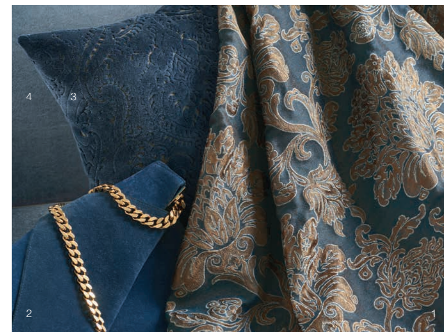
1 Ramona 587 | 2 Gattopardo 555 | 3 Evento 587 | 4 Gattopardo 593