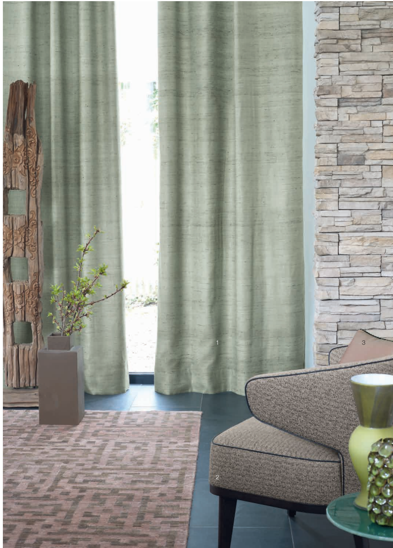
1 Monsoon 675 | 2 Tate 888 | 3 Colibri 484