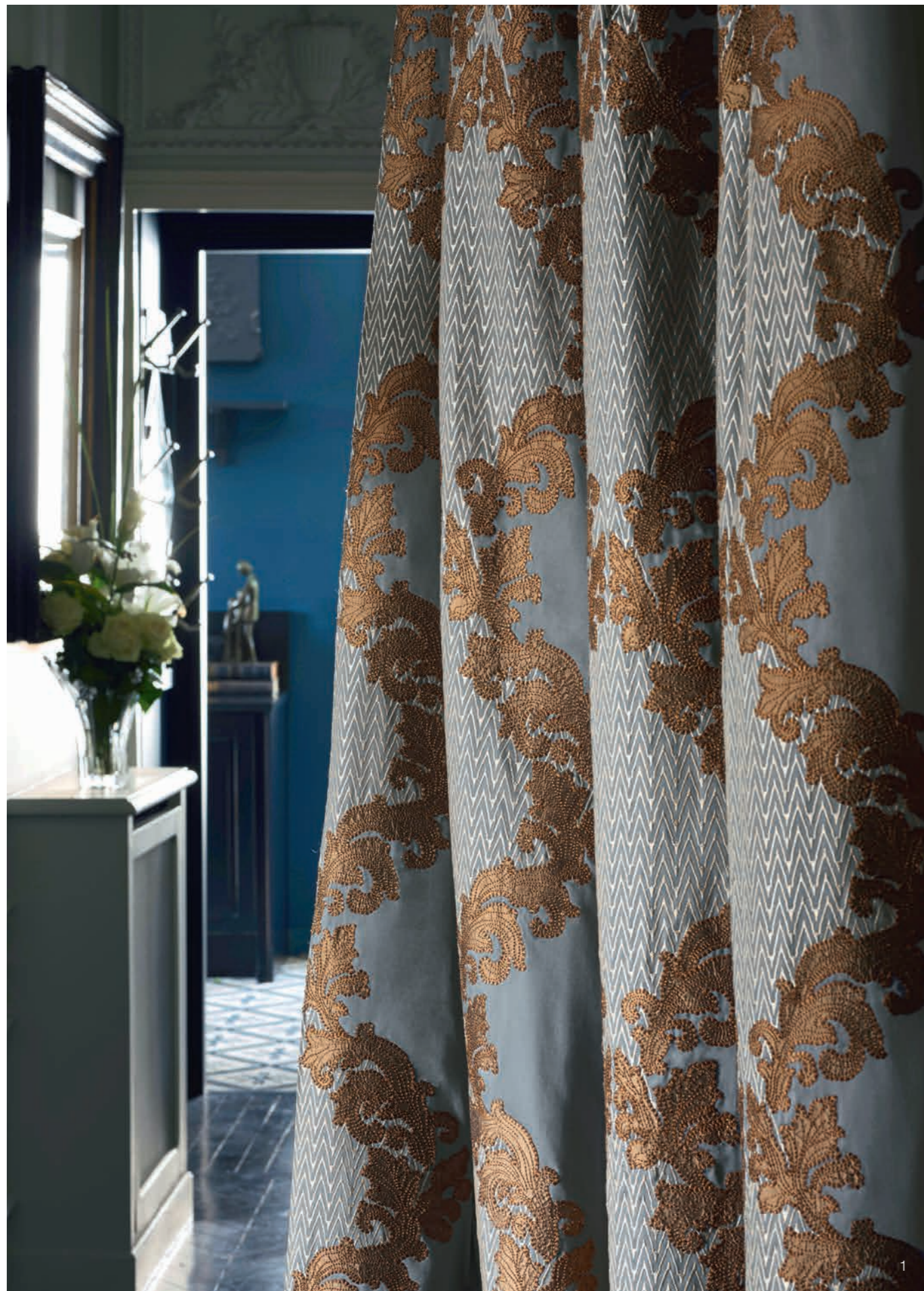
1 Cardinale 586