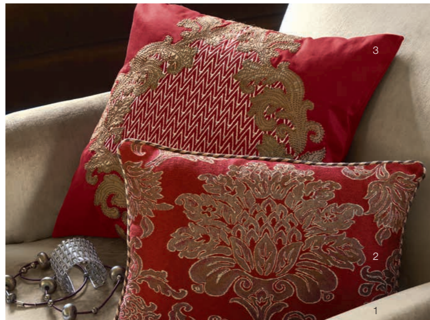
1 Gattopardo 813 | 2 Ramona 387 | 3 Cardinale 386