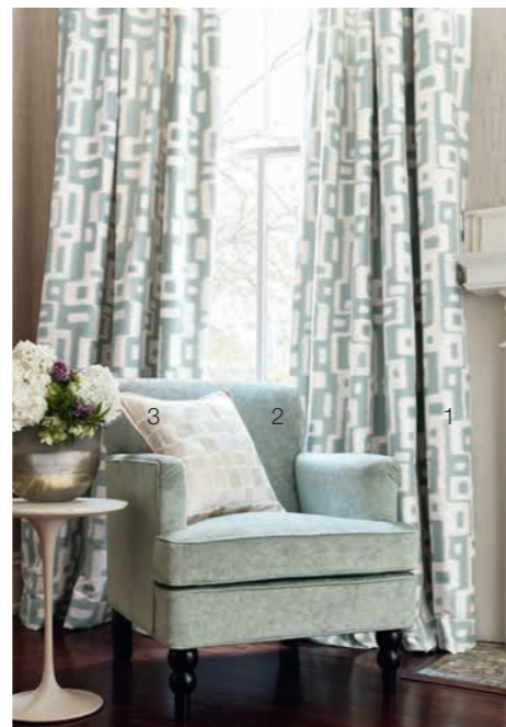
1 Everett 594 | 2 Fenton Chenille 684 3 Powell Embroidery 992