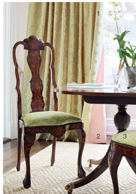
1 Lamour 784 | 2 Colibri 481 3 Astor Velvet 774