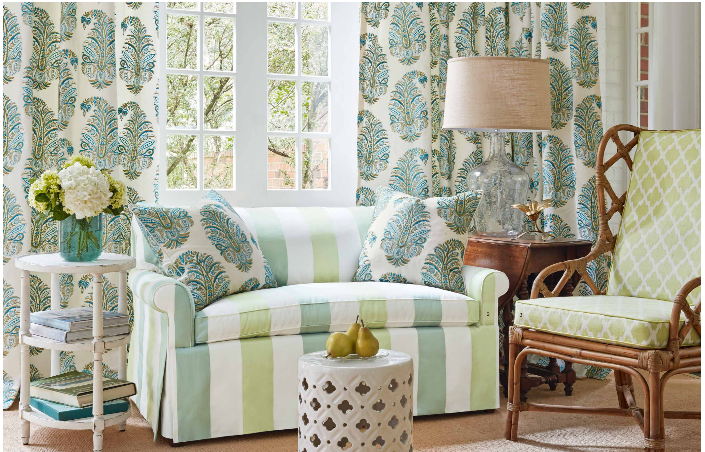
1 Balboa Paisley 674 | 2 Catalina Stripe 775 | 3 Sausalito 793