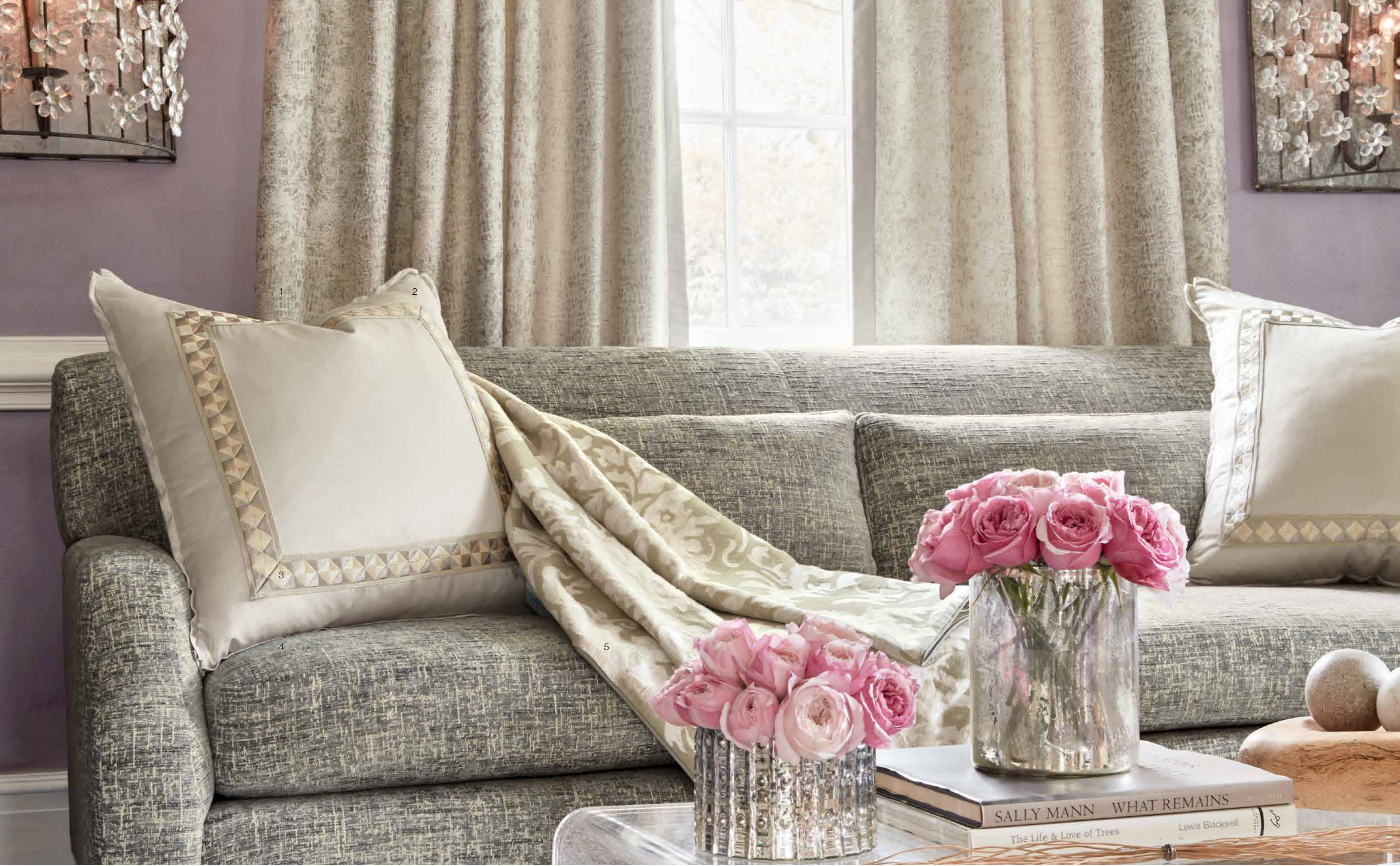
1 Sutherland 982 | 2 Latham 992 | 3 Chloe 882 | 4 Collins 996 | 5 Swinton Damask 893