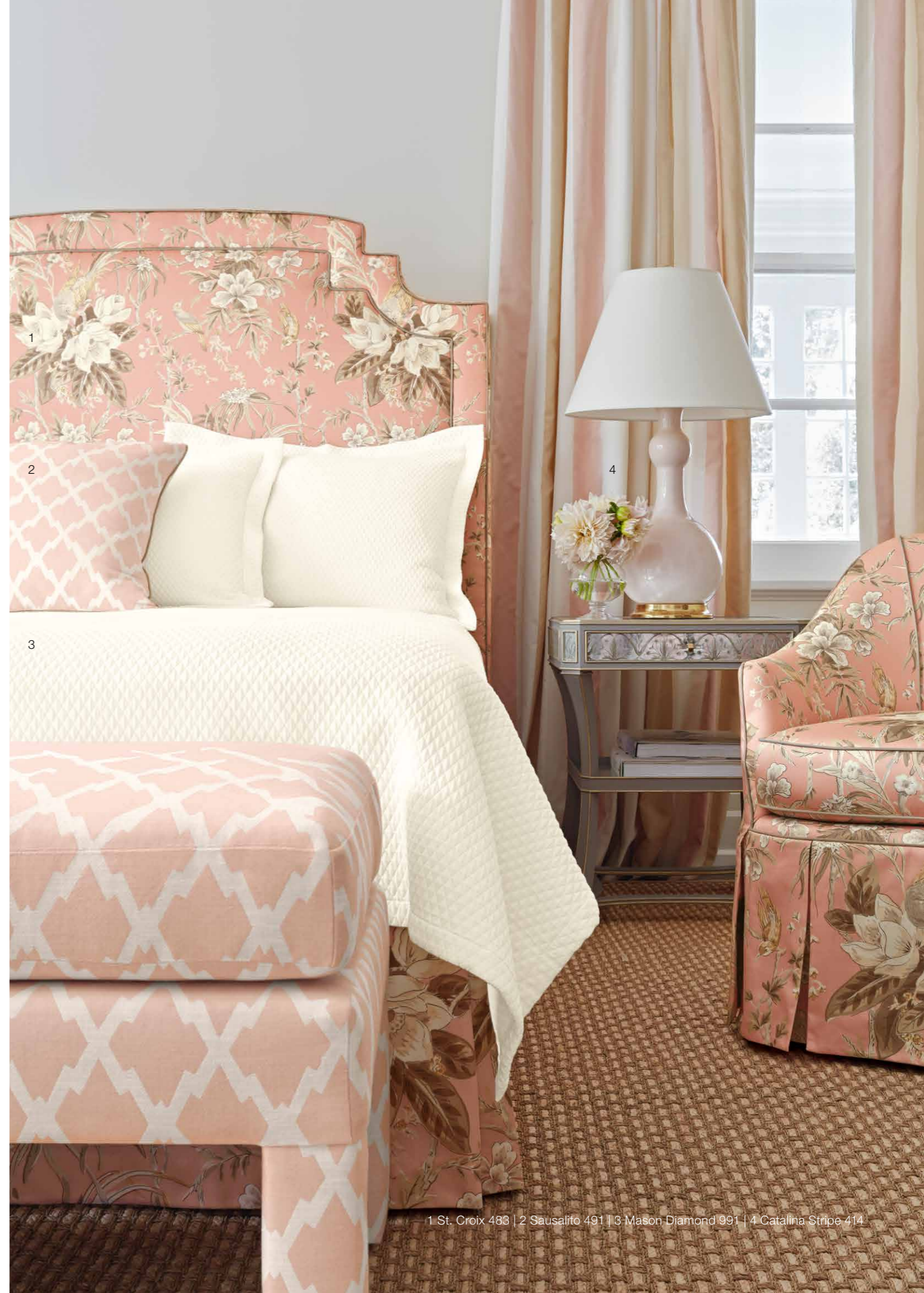
1 St. Croix 483 | 2 Sausalito 491 | 3 Mason Diamond 991 | 4 Catalina Stripe 414