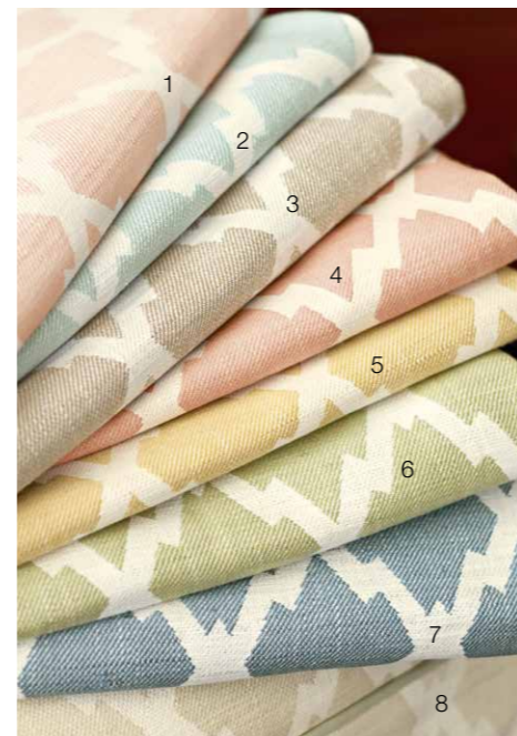
1 Sausalito 491 | 2 Sausalito 592 | 3 Sausalito 896 4 Sausalito 494 | 5 Sausalito 192 | 6 Sausalito 793 7 Sausalito 597 | 8 Sausalito 891