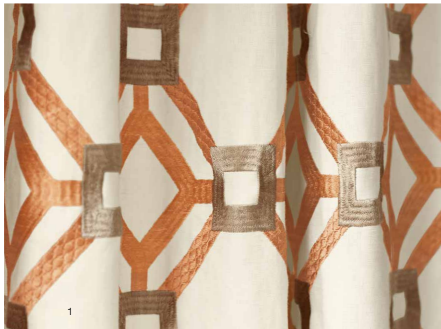
1 Temple Lattice 284