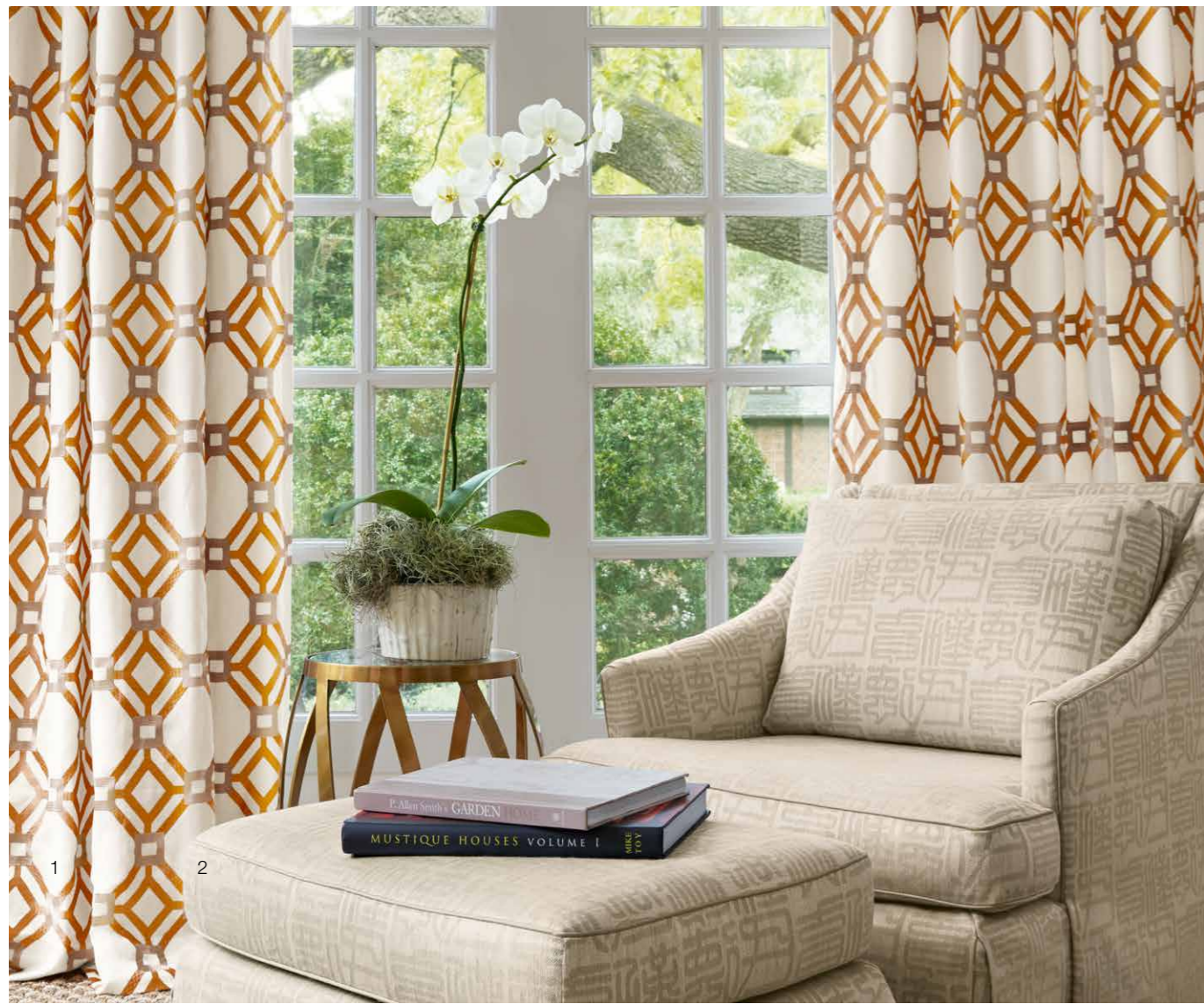
1 Temple Lattice 284 | 2 Emperor's Seal 894