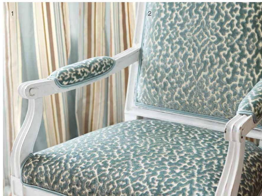
1 Belle Meade Stripe 584 | 2 Vermicelli Velvet 554