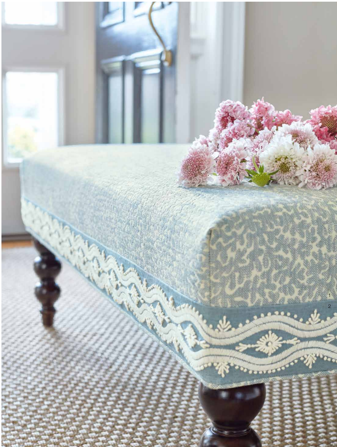
1 Brione 585 | 2 Emily Embroidery Tape 594