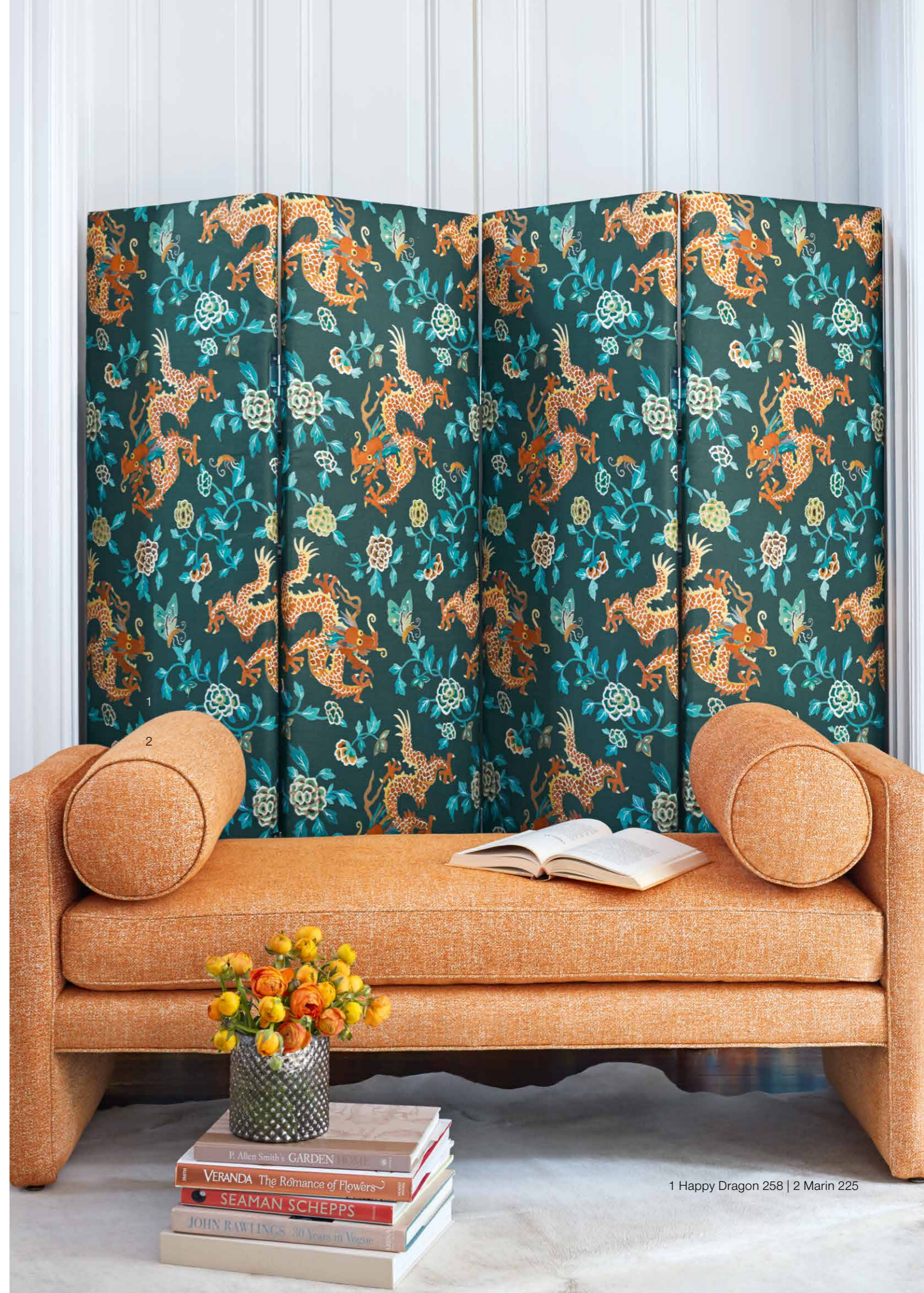
1 Happy Dragon 258 | 2 Marin 225