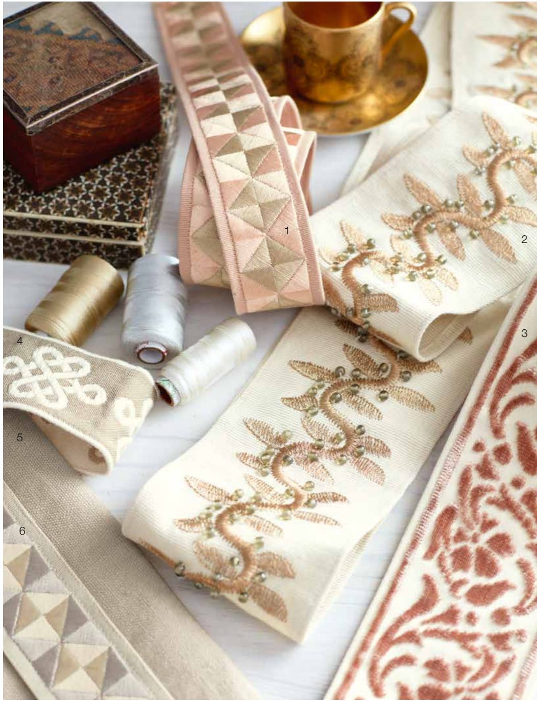
1 Chloe 482 | 2 Eleanor Beaded Tape 981 | 3 Corinne Velvet Tape 494 4 Madison 893 | 5 Dorset 883 | 6 Chloe 882