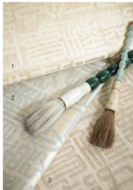
1 Emperor's Seal 991 | 2 Emperor's Seal 694 3 Emperor's Seal 894