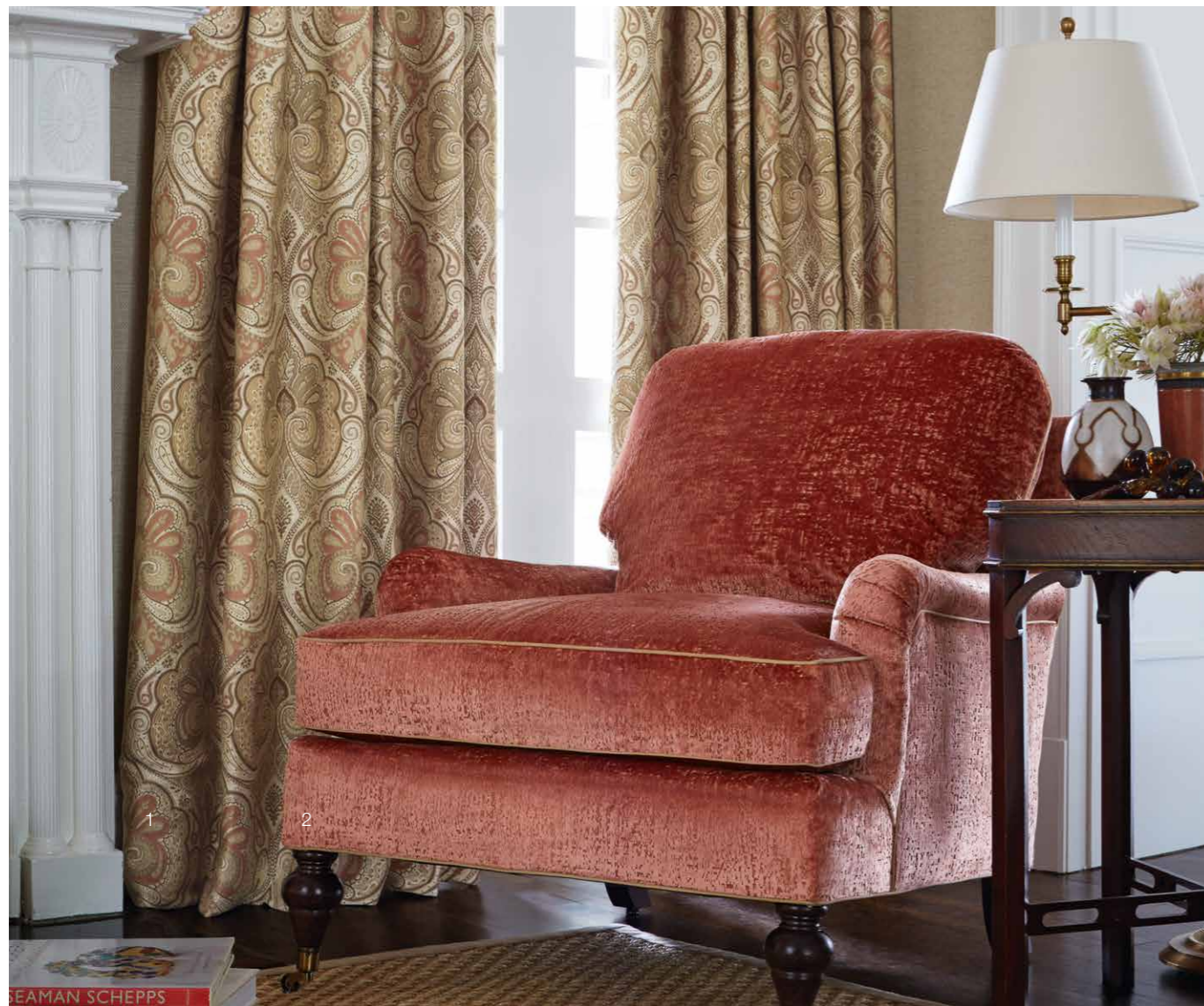
1 Grand Bazaar 485 | 2 Astor Velvet 444