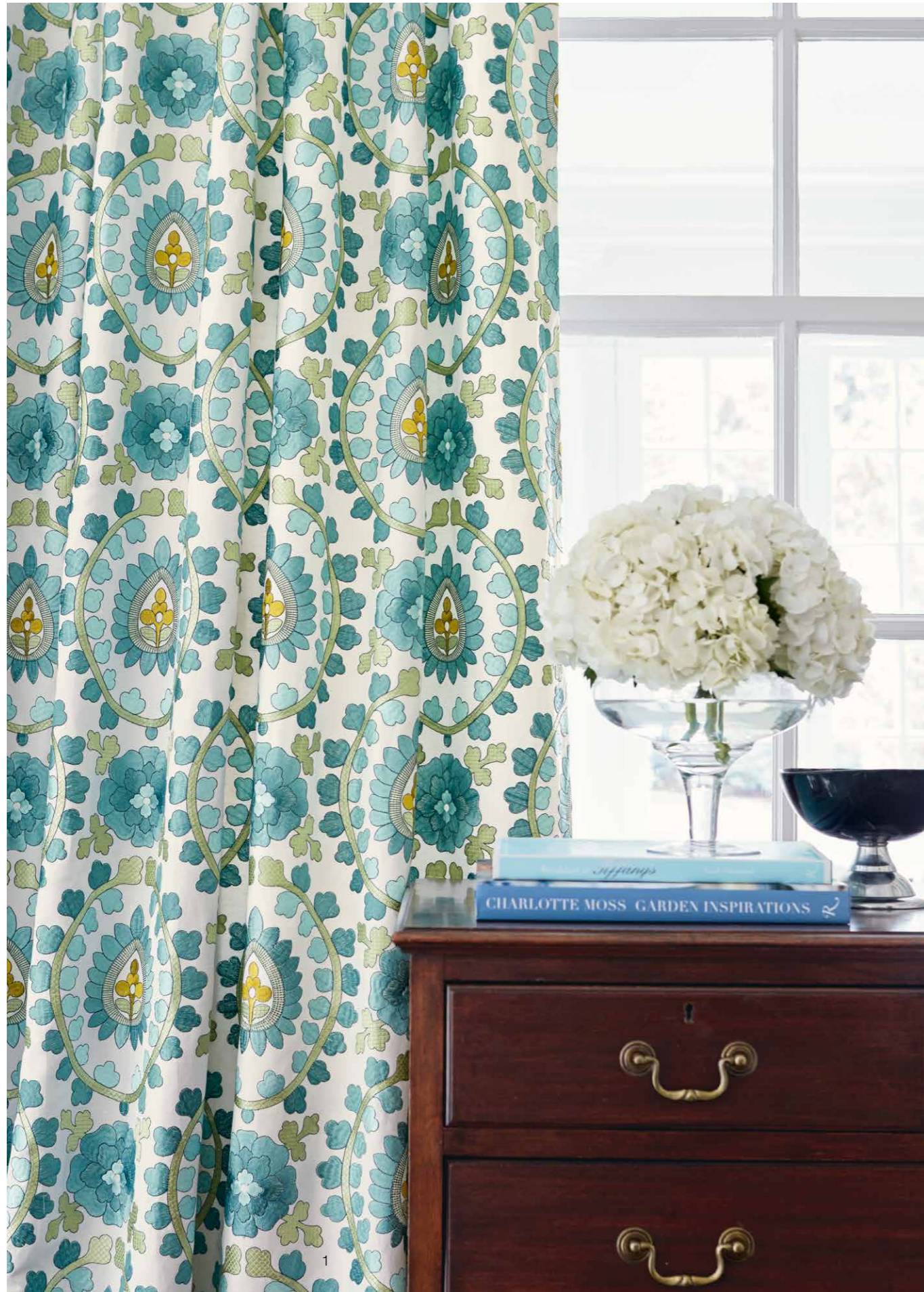
1 Cloisonné Embroidery 674