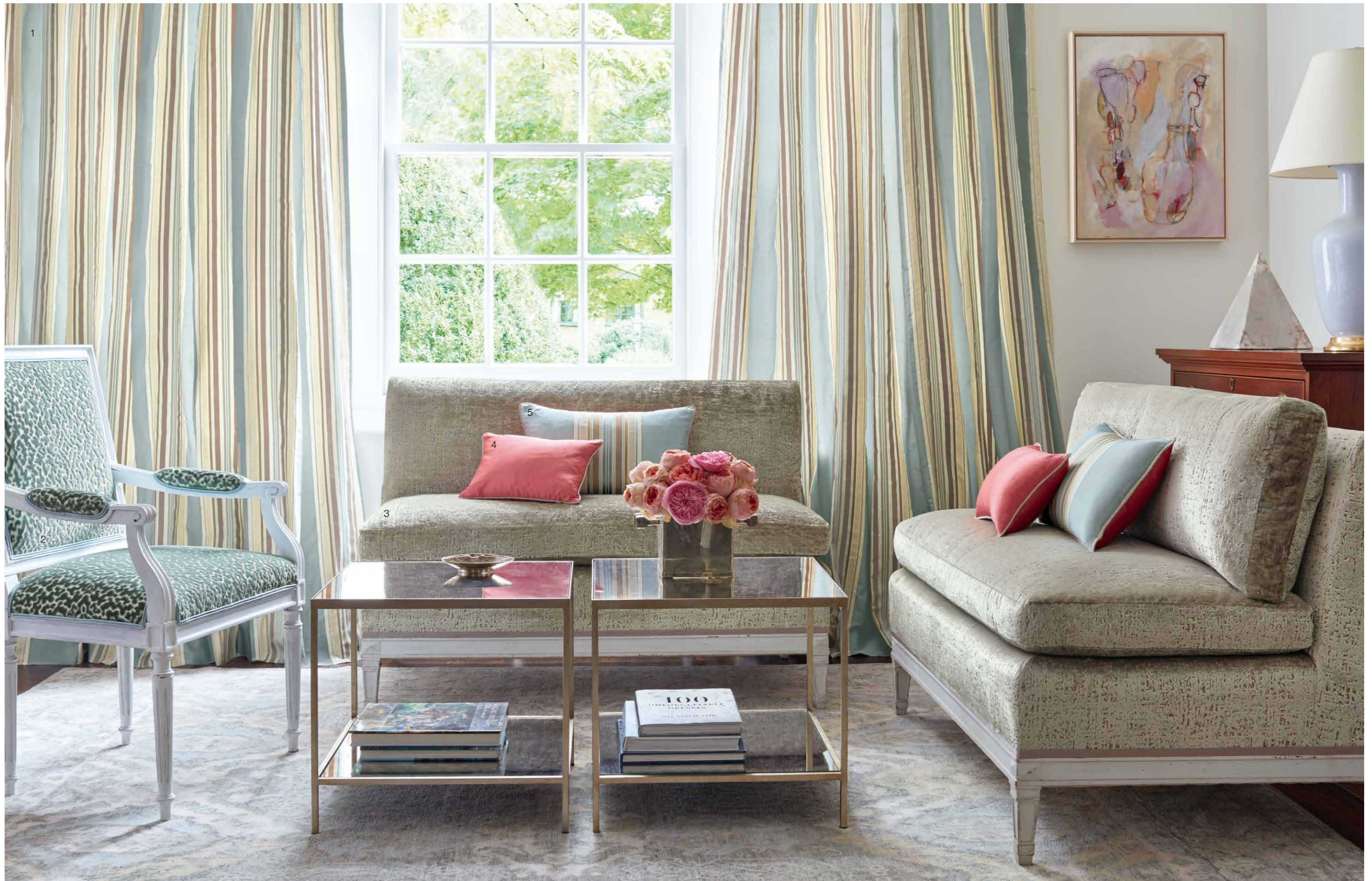
1 Belle Meade Stripe 584 | 2 Vermicelli Velvet 554 | 3 Astor Velvet 893 | 4 Colibri 434 | 5 Belle Meade Stripe 584