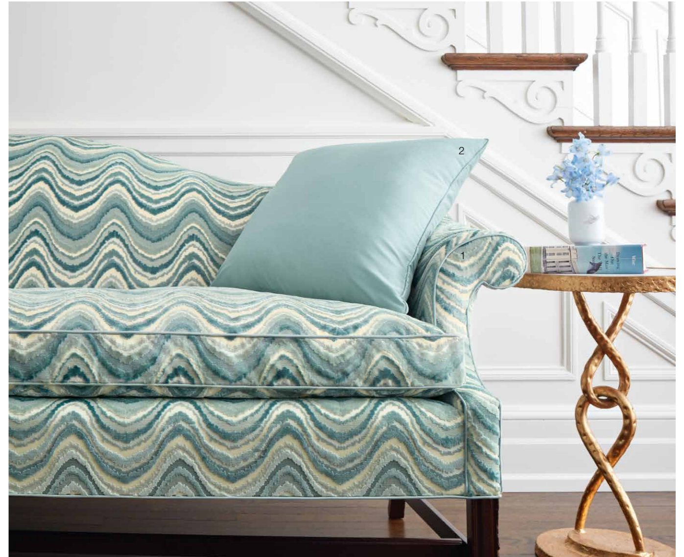
1 Beverly Velvet 555 | 2 Colibri 563