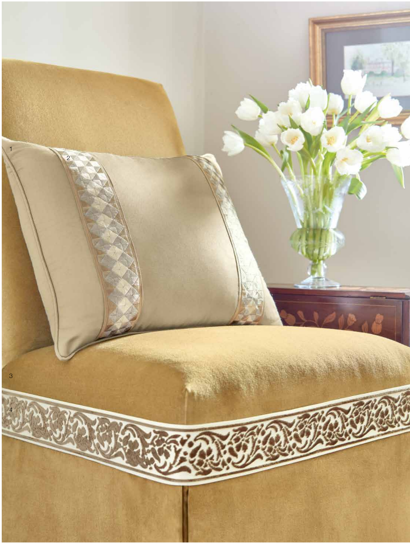
1 Latham 882 | 2 Madeline 883 | 3 Saga 885 | 4 Corinne Velvet Tape 895 Right Page: 1 Solano 684 | 2 Olivia Tape 573 | 3 Finley 991 | 4 Lilly Lattice Tape 694 Previous Page: Olivia Tape 554 | Emily Embroidered Tape 598