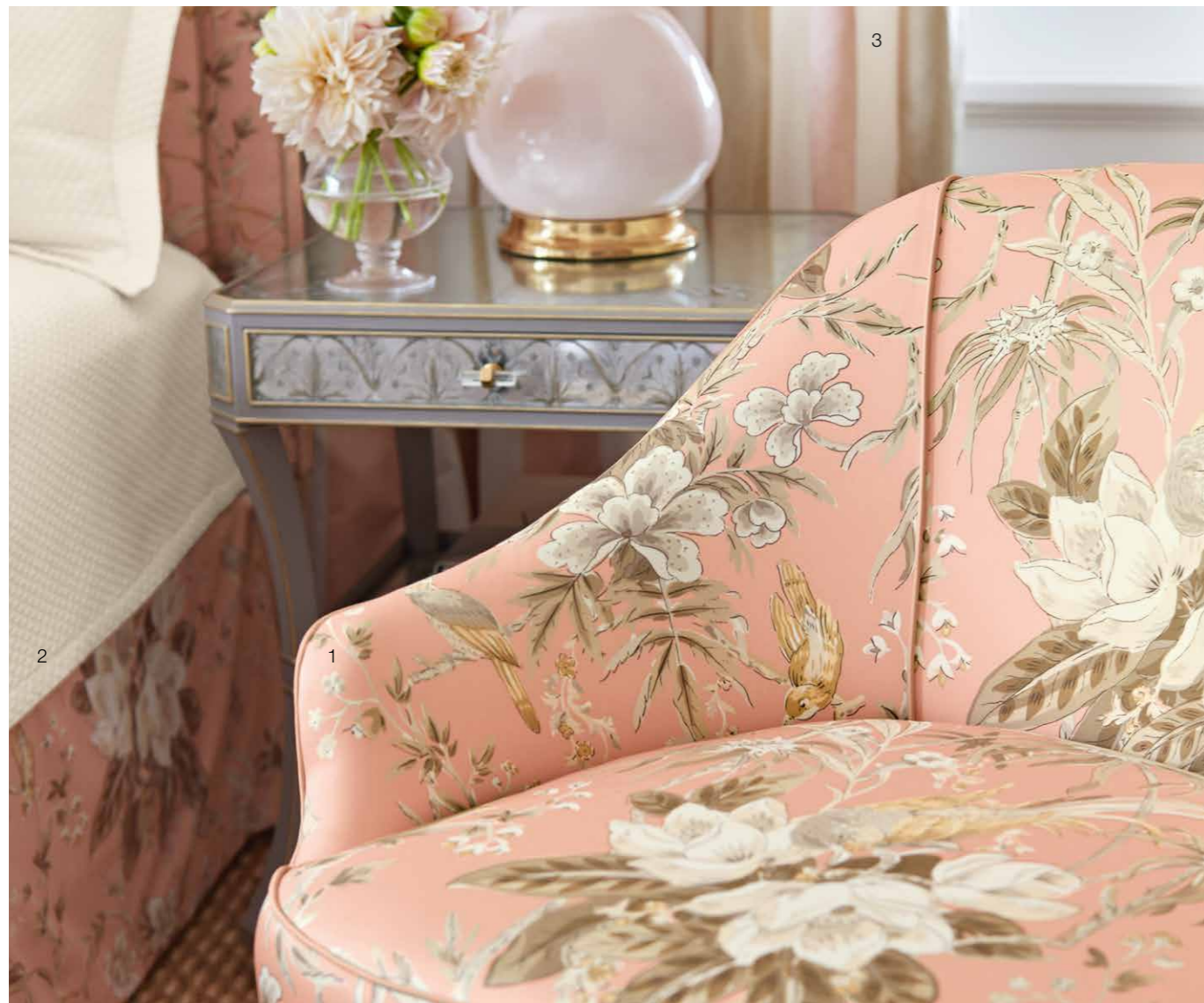
1 St. Croix 483 | 2 Mason Diamond 991 | 3 Catalina Stripe 414