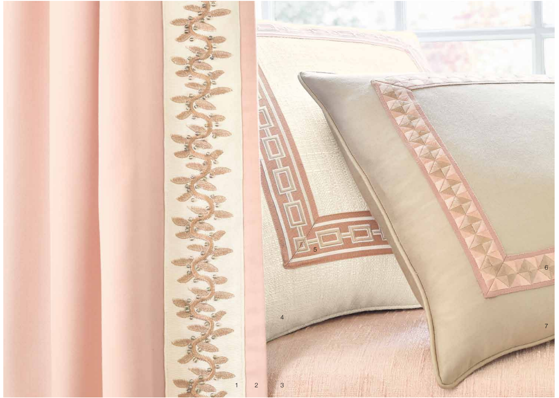
1 Eleanor Beaded Tape 981 | 2 Latham 442 | 3 Collins 442 | 4 Weiland 991 5 Jenna Velvet Appliqué 493 | 6 Chloe 482 | 7 Latham 882