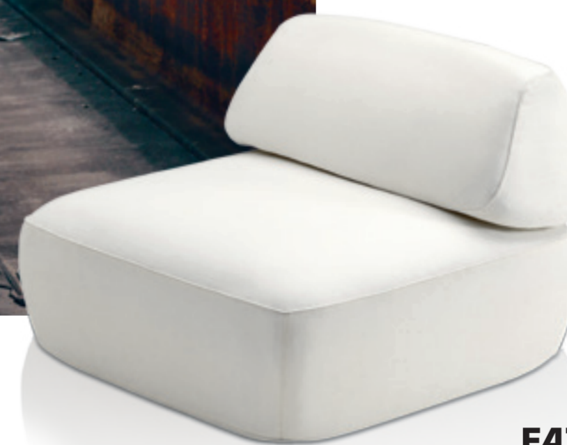
FAT TONY by GRAFT

Fat Tony doesn't want to be a chiselled model. Fat Tony wants to impress others by the charm that is the healthy beauty of well-formed curves. This modular sofa system transposes an image of pure grace into the world of furniture, suggesting – not just visually – the perfect relaxation of youthful form. Yet these distinct elements are striking not only by their outer appearance. Their unusual upholstery structure makes for a particularly ergonomic feeling when you sit on them. Nor do they limit your individuality: with easy-to-vary modules allowing countless combinations, your creative ideas are given free rein. This versatility, coupled with a timeless design, means Fat Tony can be used to make an impact in any space, either in its own right, or in high-impact groups.