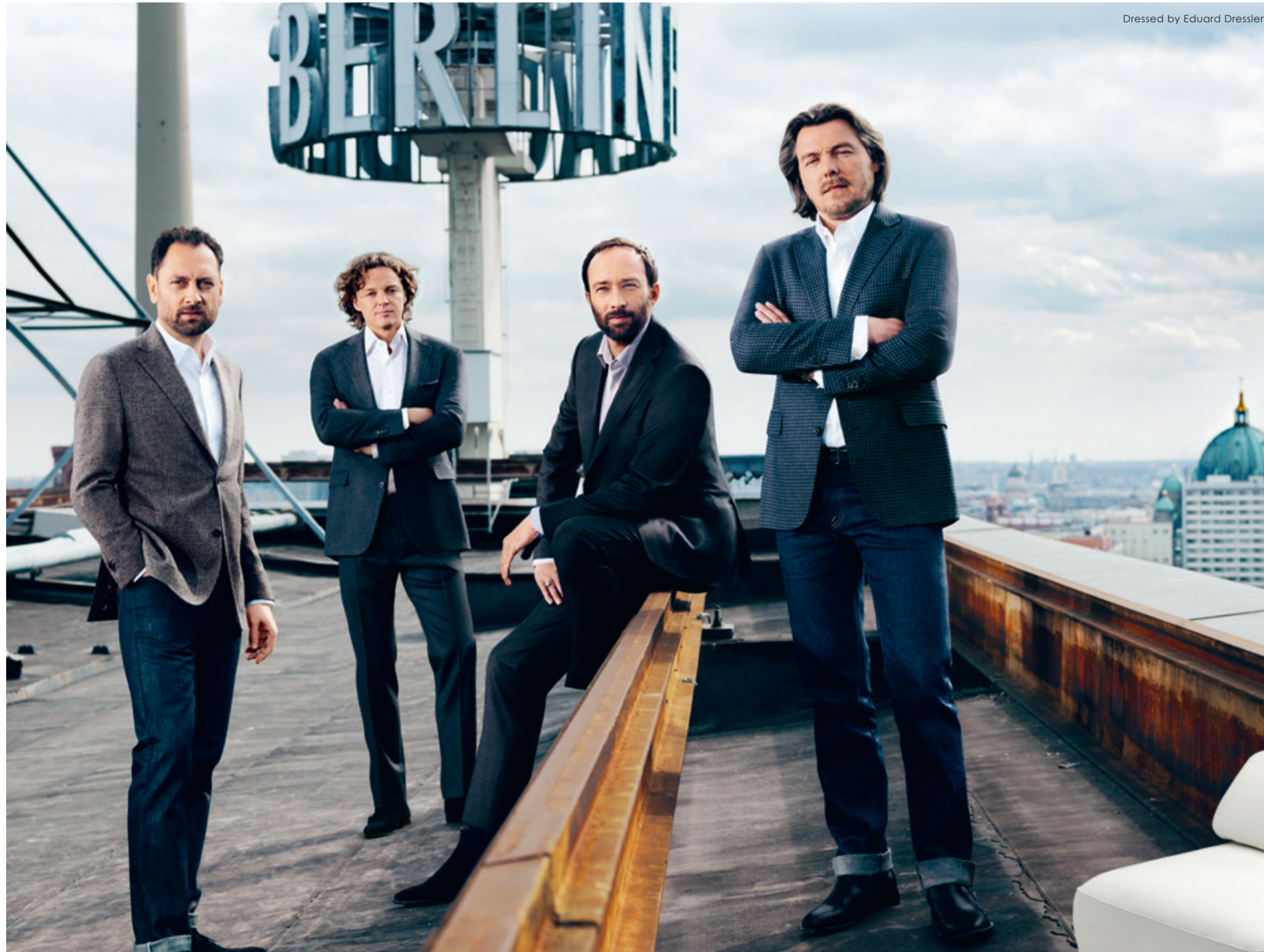
Dressed by Eduard Dressler